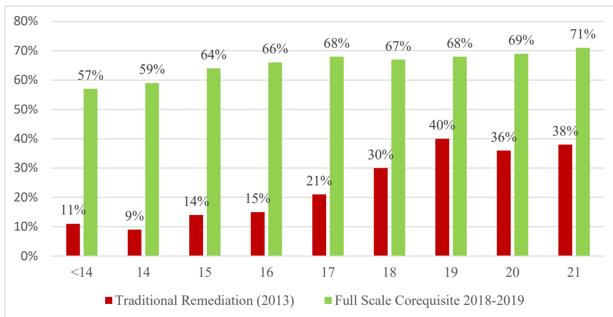
USG: Percentage of Students Who Completed a General Education Math Course in One Year by ACT Score

Implementing math pathways in conjunction with corequisite support developmental education has proven to be a game changer for students who begin at lower preparation levels. Multiple systems have made this change and phased out traditional prerequisite remediation. When looking at the ACT math subject score, ACT recommends a 22 as the requisite score to enroll in college algebra. Knowing this coupled with the common perception that corequisite remediation will only benefit students who are slightly below the collegiate level, many would likely conclude that the corequisite model is only effective for students scoring in the 18-21 math ACT range. Data from the University System of Georgia (USG) – which includes research universities, regional universities, and two-year colleges – clearly demonstrate that this perception is not a reality. While these data show that all students benefited significantly from corequisite, the students with the lowest ACT math scores – those scoring a 17 or lower – exhibited the highest gains. Thus, this provides evidence that the corequisite support developmental education model is a proven practice for all students, regardless of academic level.