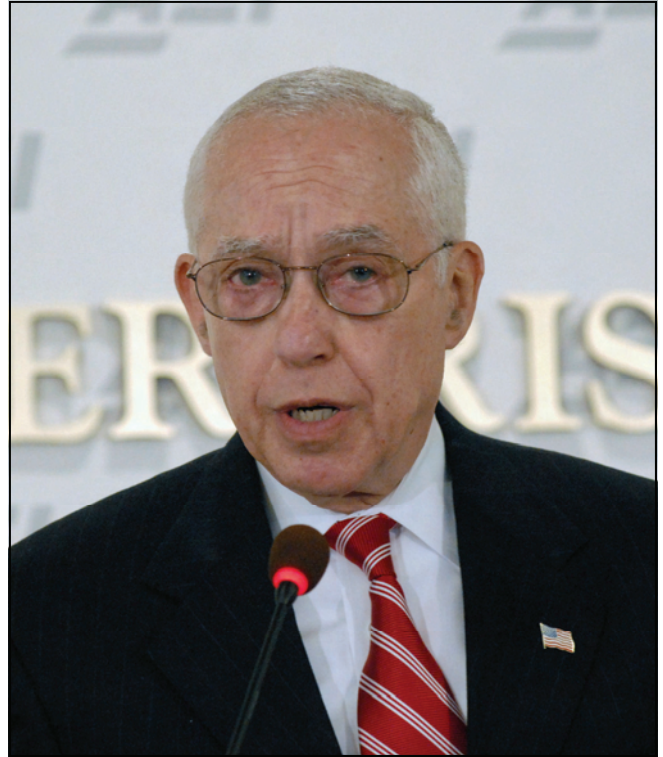
On July 21, 2008, Attorney General Mukasey delivered remarks on National Security at the American Enterprise Institute in Washington, D.C.

"So today, I am urging Congress to act – to resolve the difficult questions left open by the Supreme Court. I am urging Congress to pass legislation to ensure that the proceedings mandated by the Supreme Court are conducted in a responsible and prompt way and, as the Court itself urged, in a practical way."