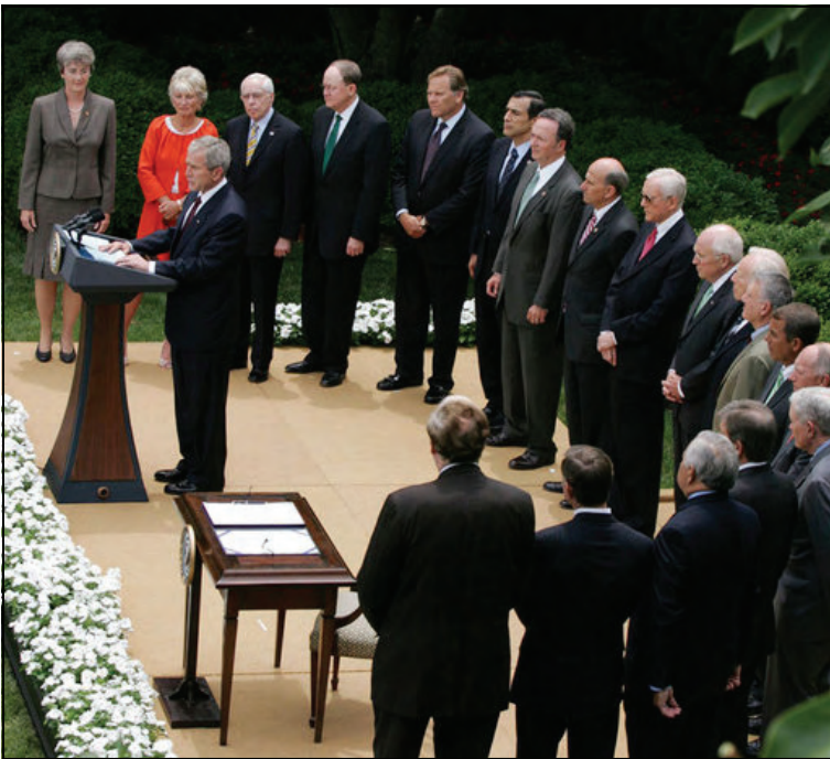
Members of Congress and various Cabinet members joined President Bush in the Rose Garden at the White House where he delivered remarks prior to signing the FISA Amendments Act of 2008 on July 10, 2008.

On July 10, 2008, President Bush, joined by members of Congress and members of his Cabinet, including Attorney General Mukasey, delivered remarks prior to signing the FISA Amendments Act of 2008. The bi-partisan legislation restores a critical authority to collect intelligence and includes liability protection for telecom service providers who assisted the government immediately after the September 11, 2001, terrorist attacks.