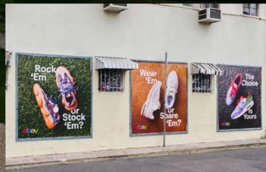
To drive excitement and promote the experience, we used wild postings, social, sneaker influencers, and earned outreach.