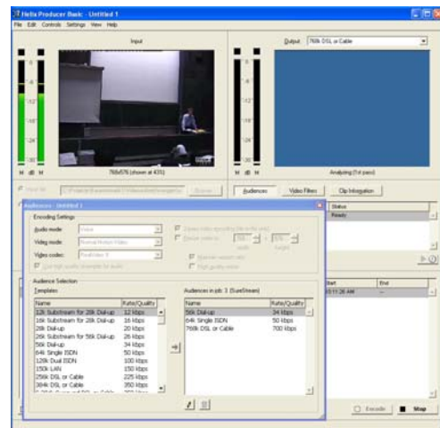
Figure 1. Development of a good quality lecture archive with the possibility for subsequent web streaming.

are seeking to maintain the close link between the student and lecturer.