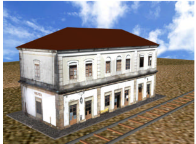
Figure 4. Rendering with photo-realistic textures