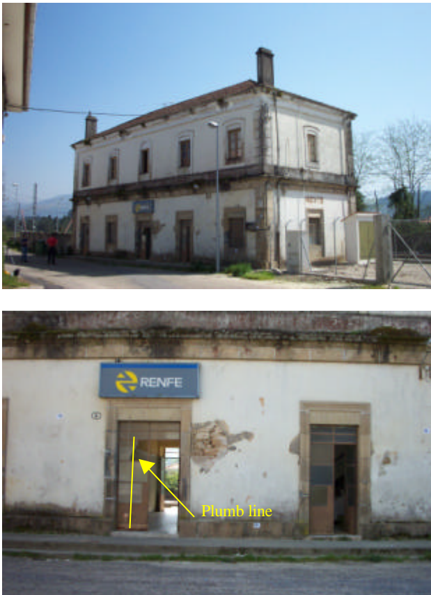
Figure 1. Example of the photographic shots. In the second image, z axis direction defined by the plumb line can be seen

In Figure 1, two examples of photographic shots are shown; a general shot and a detailed shot. In the right image, z axis direction defined by the plumb line is indicated.