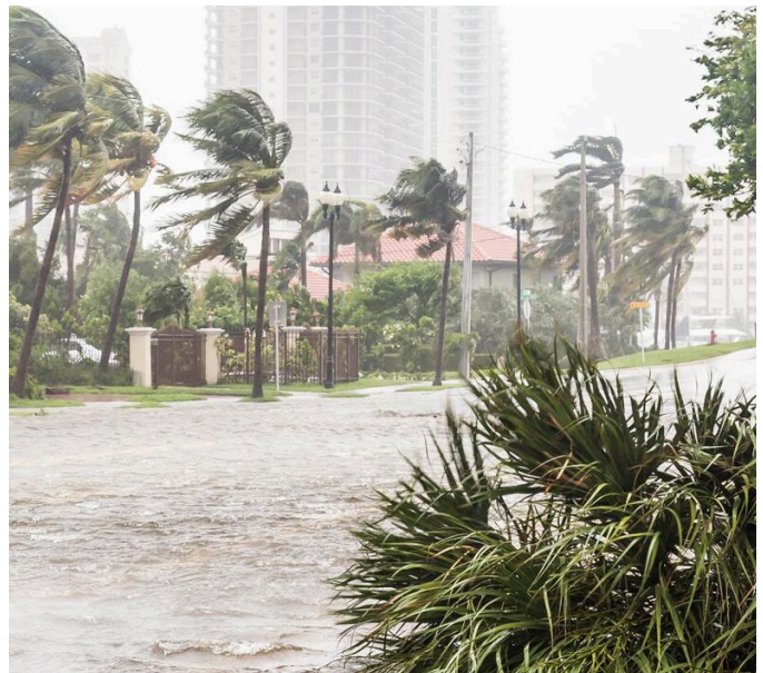
There is evidence that climate change is making hurricanes stronger and more destructive.

U.S. allies, partners, and competitors are assessing the implications of climate change on their respective strategic objectives. Malign actors may try to exploit regional instability exacerbated by the impacts of climate change to gain influence or for political or military advantage. Global efforts to address climate change – including actions to address the causes as well as the effects – will influence DoD strategic interests, relationships, and priorities. Cooperation with international partners to address the security implications of climate change can strengthen alliances and partnerships. Building awareness of how other nations are preparing for climate change is critical to understanding the risks and opportunities across strategic, operational, and tactical environments.