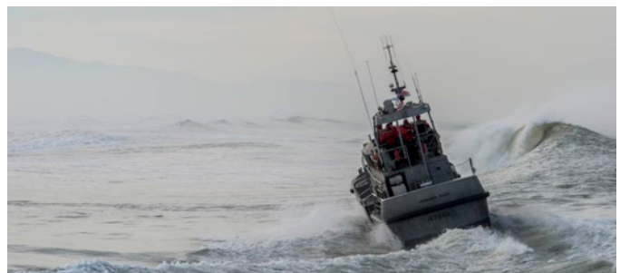
Coast Guard crews train in high surf to ensure they are prepared to respond to any maritime emergency during rough weather conditions.

scientific information at time scales required for DoD strategy and planning. DoD will validate its selection and use of climate data and projections internally and through consultation with scientific agencies and other partners such as DoD's Climate Working Group, DoD's Strategic Environmental Research and Development Program (SERDP), Federally Funded Research and Development Centers (FFRDCs), and the U.S. Global Change Research Program (USGCRP)—(of which DoD is a member)—within the White House Office of Science and Technology Policy (OSTP). DoD will continue to review and assess how to integrate climate science, data, and scenarios into Department documents and processes.