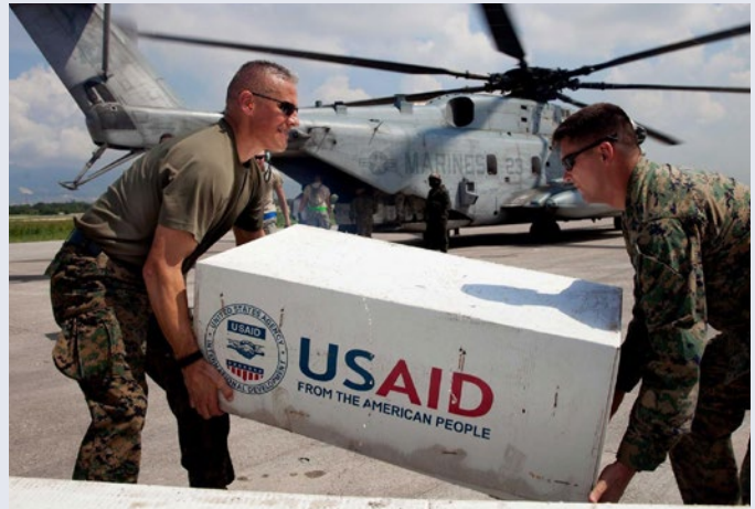
DoD supports the US Government Assistance to Haiti after Hurricane Matthew in 2016.