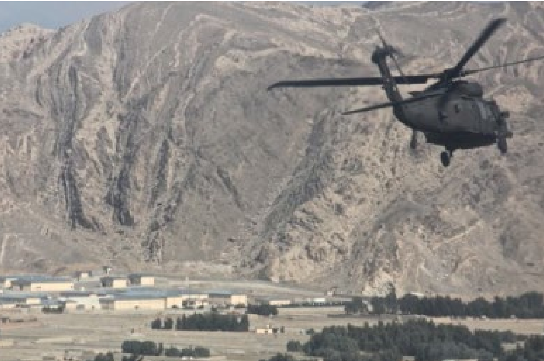
A UH-60 Black Hawk helicopter carrying leaders and advisers from Train, Advise, Assist Command-East, Resolute Support Mission, and Combined Security Transition Command-Afghanistan travels to the Nangarhar police Regional Logistics Center on February 17, 2015.

Assembly, to continue the Afghanistan and regional security discussions and to include other member states. According to the Administration, the United States and Afghanistan agreed on an early formation of a joint commission to oversee the implementation of the BSA, and President Obama affirmed ongoing U.S. support for Afghan security forces. 36