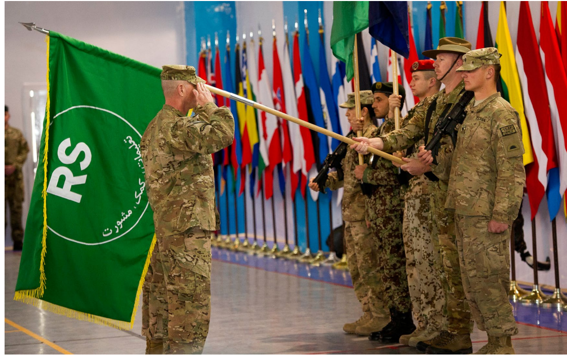
Change of mission ceremony for Resolute Support held in Kabul, Afghanistan, in December 2014.

subsequently committed to maintaining up to 9,800 troops through the end of 2015 in response to President Mohammad Ashraf Ghani’s request for flexibility in the U.S. drawdown timeline. 13 According to DoD, the United States will maintain its force level below 9,800 through the end of 2015, and, later this year, will establish plans for additional force drawdowns, which will begin in 2016. 14