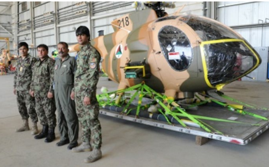
Afghan Airmen pose in front of the newest aircraft (one of six MD-530s) to enter the Afghan Air Force inventory on March 18, 2015.