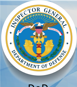
DoD OFFICE OF INSPECTOR GENERAL