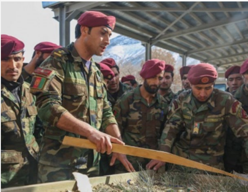
An Afghan commando leader from 6th Special Operations Kandak gives a mission brief on an operation near Kabul province, Afghanistan.

Afghanistan has five special security forces organizations, with a combined force strength of more than 18,000 personnel, which conduct direct-action missions against insurgents and their facilitators: 62