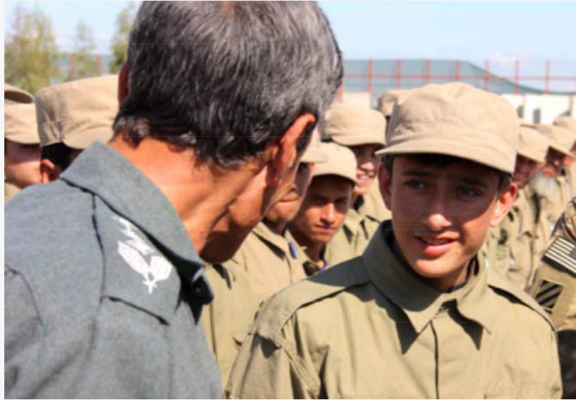
Local Police trainees at the Afghan police Regional Training Center in Nangarhar province in March 2015.

The ALP program began as an initiative of the Coalition Forces Special Operations Component Command-Afghanistan, but it is a village defense force, not an MOI special police force. The original MOI validation process for ALP members included approval by both the village elders and the Coalition partners. 75 In October 2014, the coalition reported that an MOI-certified ALP program of instruction had been newly integrated into the curriculum at the regional and provincial training centers. Because ALP units operate