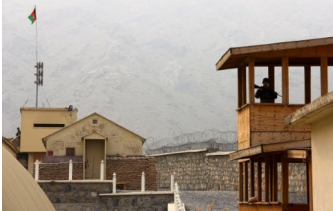
Afghan army soldiers on watch at the Khyber Border Coordination Center near Torkham Gate at the Afghanistan-Pakistan border January 4, 2015.

arrangements and agreements—from status of personnel issues to defense and security cooperation mechanisms. According to BSA Article 26, the agreement will remain in force from January 1, 2015, to December 31, 2024, and beyond, unless formally terminated, with notice. 25