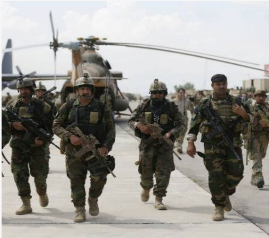
Forces from Afghanistan's Critical Response Unit in full battle gear.

Regarding operations, DoD reported that, during December–May 2015, the SMW conducted more than 840 Mi-17 and 1,008 PC-12 operations and training missions, proving its ability to provide ISR, develop targets, and conduct mission overwatch during infiltration and exfiltration of aircraft and ground personnel.