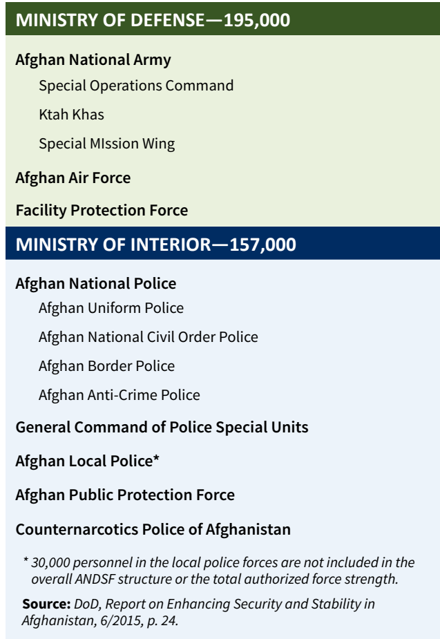
Figure 2 Afghan Security Institutions: Total Authorized Force Strength—352,000

NATO’s RS mission has several objectives, including establishing confident, self-sustaining and effective Afghan security forces, capable of protecting the population and countering terrorism, ensuring the country cannot again become a safe haven for malign actors. 82 NATO has conducted security operations in Afghanistan since 2003 and worked simultaneously to develop the Afghan forces. With the transition to the NATO RS mission, the coalition maintains its commitment to Afghanistan’s sovereignty and security, but through a continuing TAA effort 83 aligned along eight Essential Functions (EFs) that support the Functionally Based Security