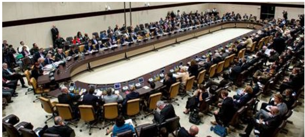
U.S. Secretary of Defense Ashton Carter participates in a meeting of the North Atlantic Council with Resolute Support partner nations at NATO headquarters in Brussels on June 25, 2015.

At the end of 2014, the U.S. and North Atlantic Treaty Organization (NATO) security assistance missions officially ended, as did offensive combat operations under Operation Enduring Freedom. The United States and NATO agreed to continue their commitment to Afghanistan security and sovereignty under the U.S.-Afghanistan Bilateral Security Agreement (BSA) and the NATO-Afghanistan Status of Forces Agreement (SOFA). These security assistance missions are expected to continue beyond 2016 through a U.S. security cooperation element and a NATO enhanced Enduring Partnership with Afghanistan. On January 1, 2015, U.S. forces began two missions within OFS described by DoD as “well-defined and complementary,” helping to provide the opportunity for Afghanistan to be independent and self-supporting: 3