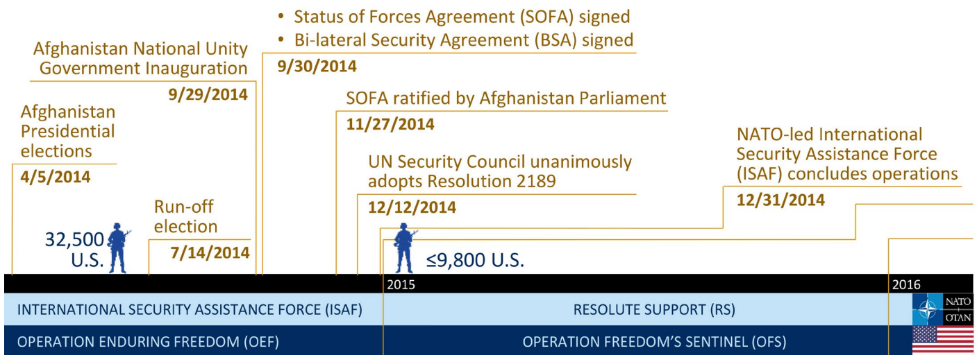
Figure 1 U.S. Mission Transition in Afghanistan, 4/2014–12/31/2017

More than 3 years ago, the United States began laying the groundwork to transition from combat operations in Afghanistan to enabling the Government of the Islamic Republic of Afghanistan (GIROA) to take responsibility for its own security. In May 2011, the Administration announced a plan to draw down U.S. forces from a peak of 100,000 9 to a minimal military presence, while supporting the continued development of the ANSDF. The 2014 Quadrennial Defense Review described the path to ending the U.S.-led combat mission 10 and transitioning to a limited military mission focused on counterterrorism and training, advising, and assisting Afghan security forces. 11 In May 2014, President Obama set the U.S. troop number at 9,800, with the drawdown to be completed by December 31, 2014. 12 The President