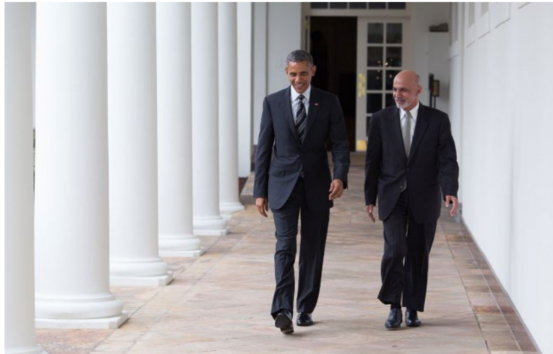
President Barack Obama and President Ashraf Ghani of Afghanistan walk on the Colonnade en route to a working lunch in the Old Family Dining Room of the White House, March 24, 2015.

The two presidents agreed that bettering the Afghan-Pakistani relationship will build trust and improve regional security. They also agreed to organize a high-level meeting, near the timing of the fall 2015 United Nations General