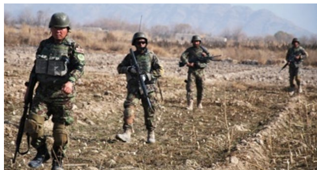
Afghan soldiers patrol in southeastern Afghanistan during a large-scale, coordinated operation to attack anti-government forces’ safe havens.