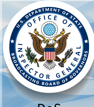
DoS OFFICE OF INSPECTOR GENERAL