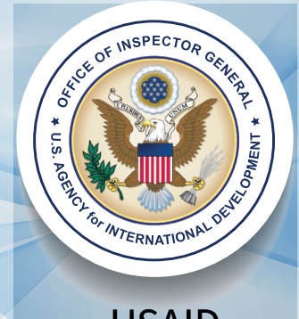
USAID OFFICE OF INSPECTOR GENERAL

Quarterly Report to the United States Congress