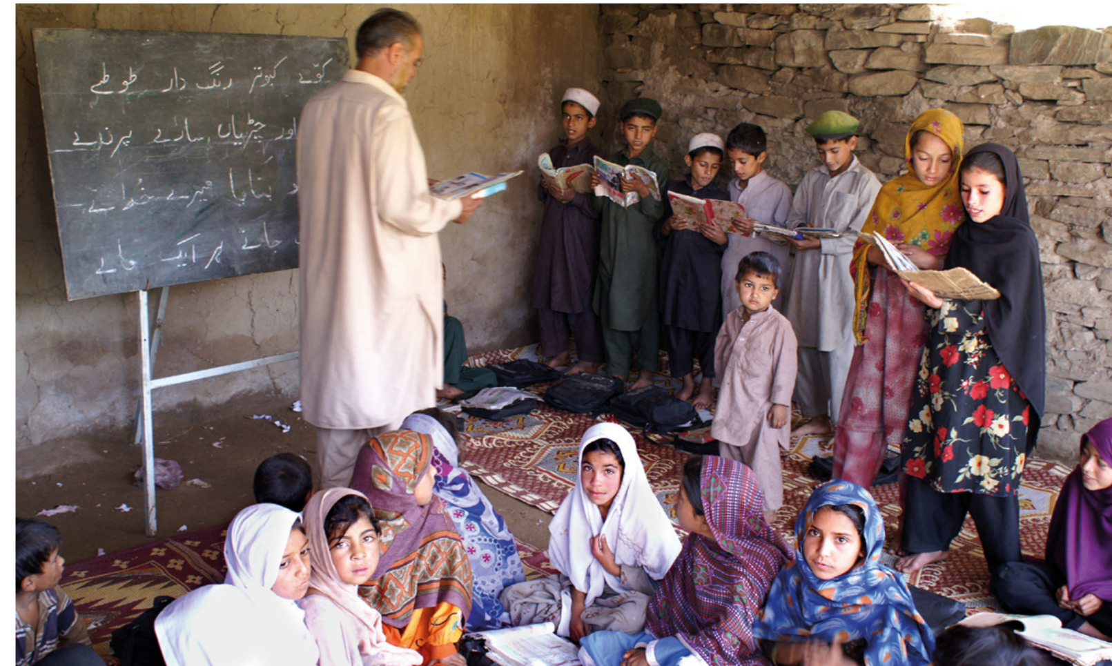
The Federal Government promotes the human right to education all around the world.