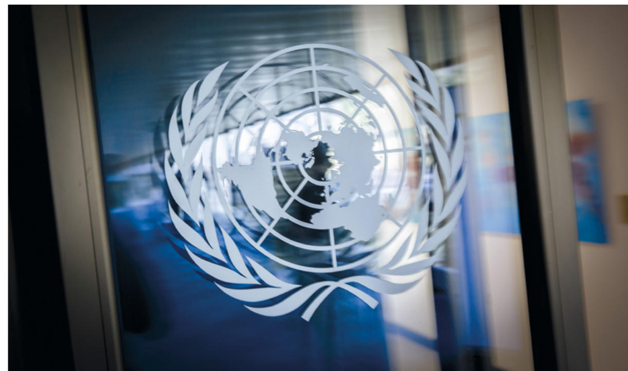
Germany actively supports multilateralism and the United Nations.

The Federal Government advocates the strengthening and further development of a free international order based on international law and the United Nations Charter. Such a rules-based order creates stability and the conditions for peace, security and human development. It also provides our open and interconnected country with protection and scope for development.