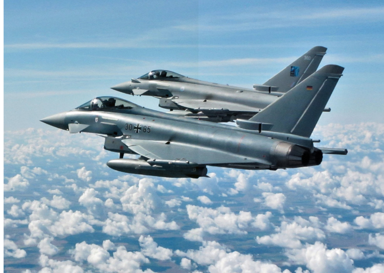
NATO's Baltic Air Policing mission

We are strengthening the Bundeswehr as a cornerstone of conventional defence in Europe. We will therefore make targeted efforts to expand our military presence in Allied territory and place it on a more permanent basis, all in accordance with the planning of the Alliance. We will also continue to meet our responsibilities as a logistical hub at the heart of the Alliance. The Federal Government will thus focus on expanding national capabilities in logistical support, health-care, traffic routing and protecting all allies while they are in Germany. Furthermore, together with the Länder we want to establish the necessary infrastructure and legal framework, and firmly support initiatives in the EU and NATO aimed at fostering military mobility.