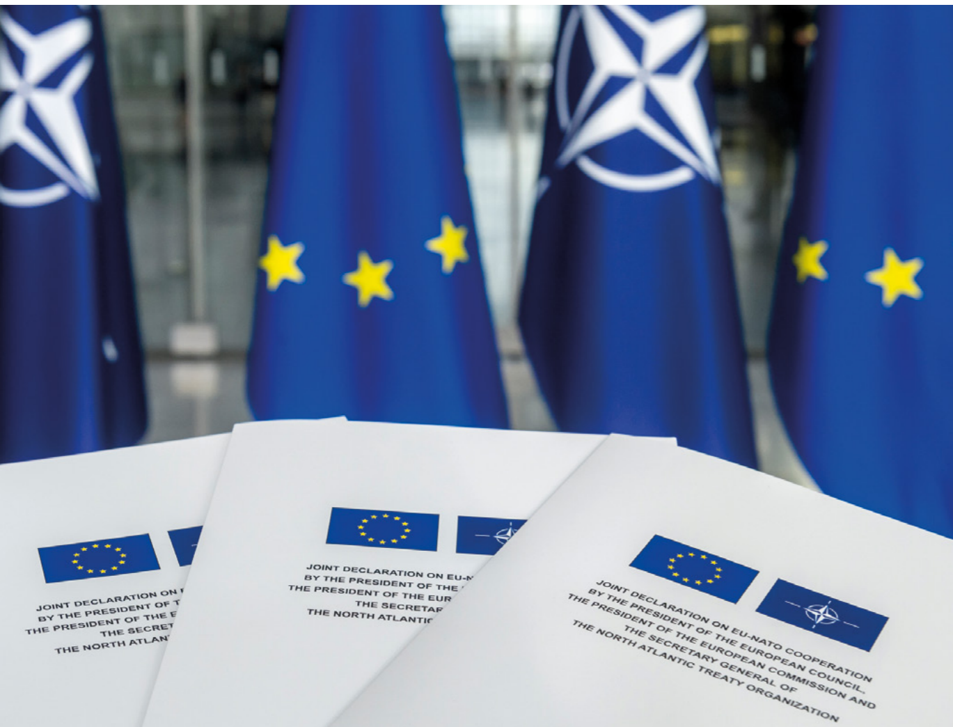
Joint declaration on cooperation between the EU and NATO