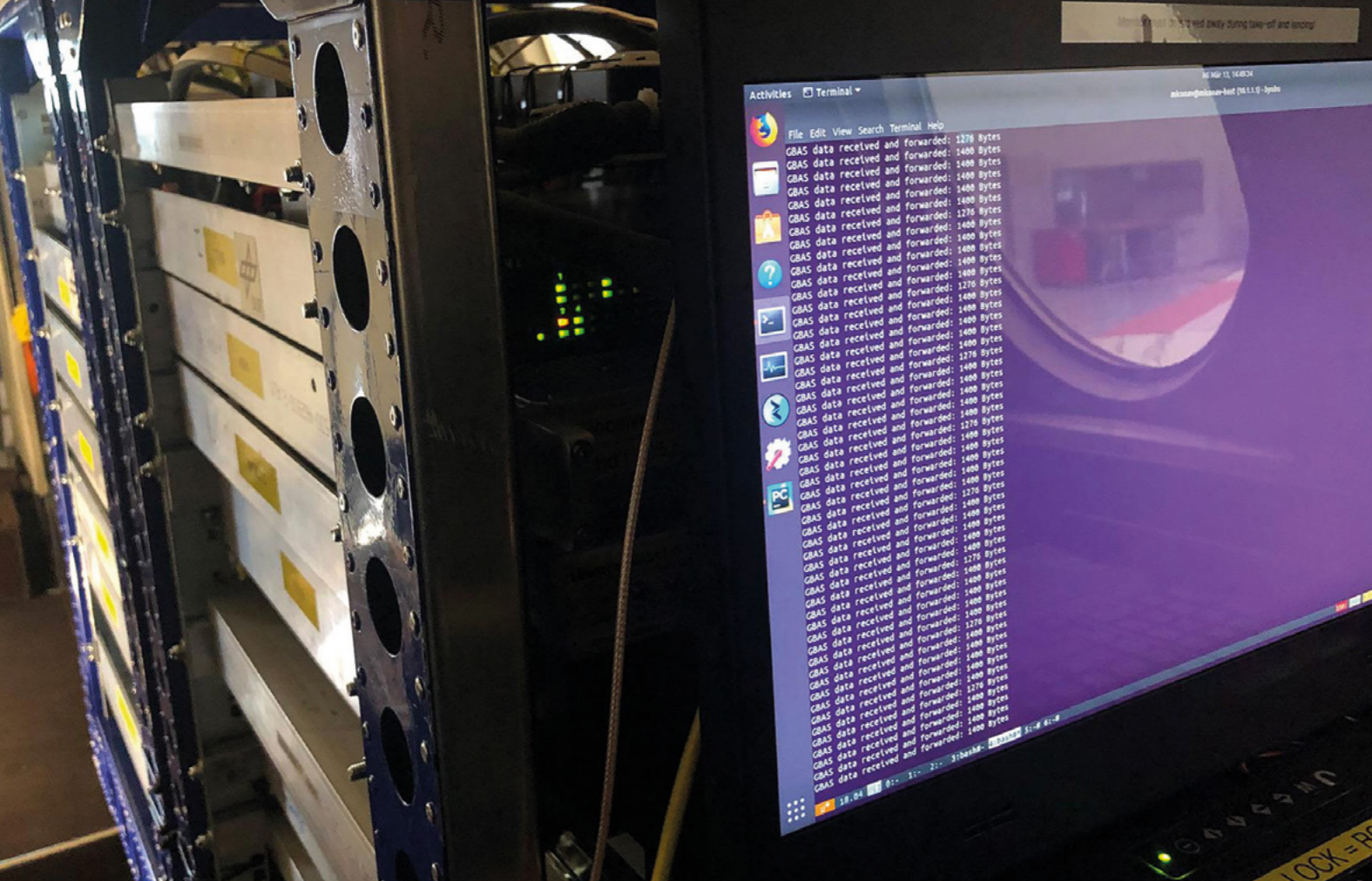
In our increasingly digitally connected society, the security of our IT systems is becoming ever more important.

other affected countries – and then take specific action against them in the form of sanctions.