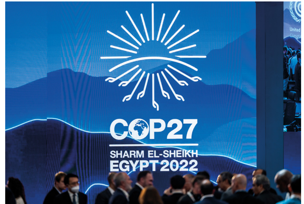
The Federal Government is successfully advocating for funding mechanisms that are designed to help those people who are most severely affected by climate-related damage.

Investment on a massive scale is required globally to fund efforts to accomplish an ecological transformation and to make the necessary adaptations to the climate crisis. International climate funding is therefore essential if this is to succeed. The Federal Government is prepared to keep making substantial contributions in this regard, beyond its current commitments and especially for the period after 2025. At international level, we remain proponents of increased support for the affected countries and continue to press for also raising more private capital for climate finance. When it comes to dealing with loss and damage and to protecting particularly vulnerable developing countries, we are actively striving to rapidly operationalise the respective funding mechanisms. To this end, we are working on ambitious implementation of the Global Shield against Climate Risks, a joint initiative of the G7 and the Vulnerable Twenty (V20) Group.