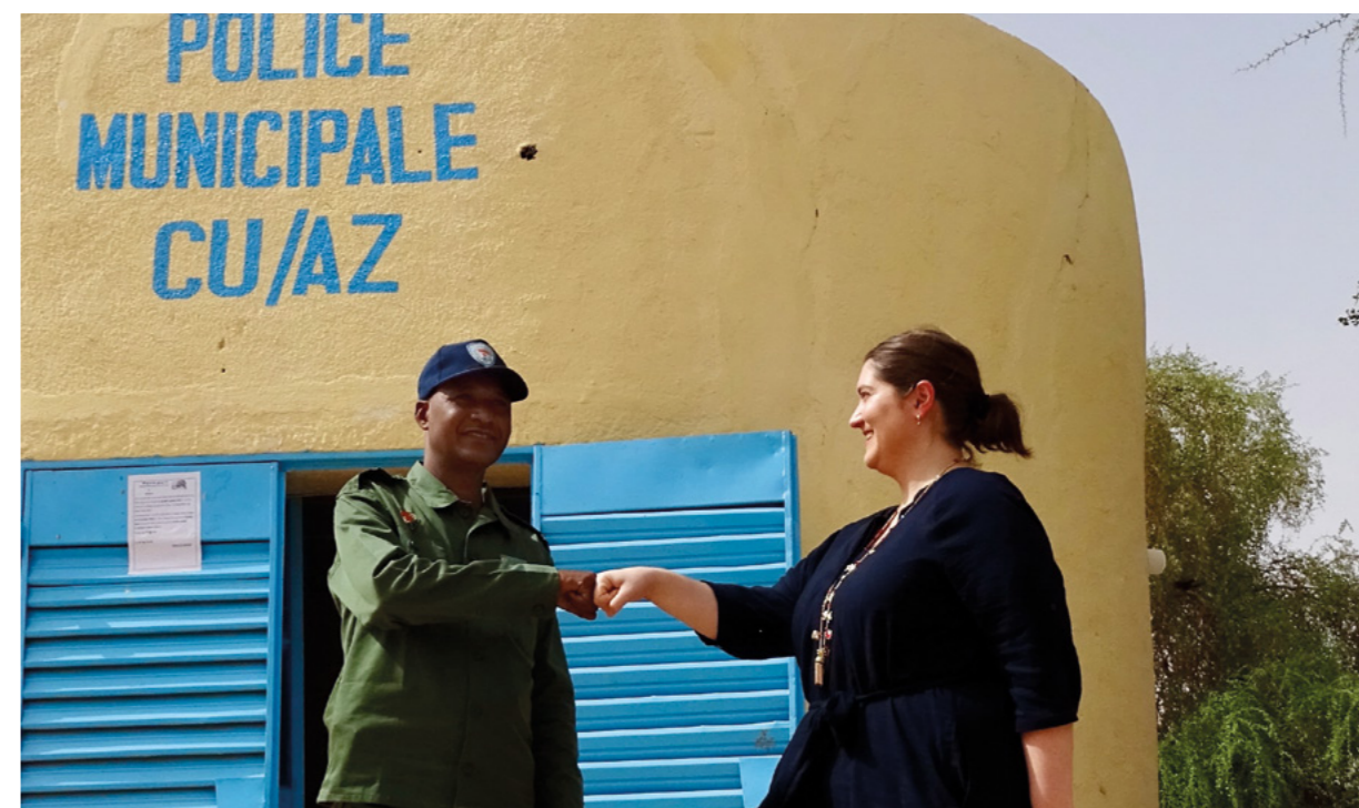
German civilian personnel and police staff are deployed as part of the EUCAP Sahel Niger mission in support of the Niger's security forces that are engaged in the fight against drug, weapon and human trafficking.

The Federal Government is committed to the primacy of preventing crises. We will increasingly pursue our crisis engagement via civilian and military missions and operations under the EU Common Security and Defence Policy. Our instruments for crisis prevention, conflict management and peacebuilding will serve coherent and realistic objectives. They combine civilian, police and military capabilities, with the Bundeswehr continuing to play an important role.