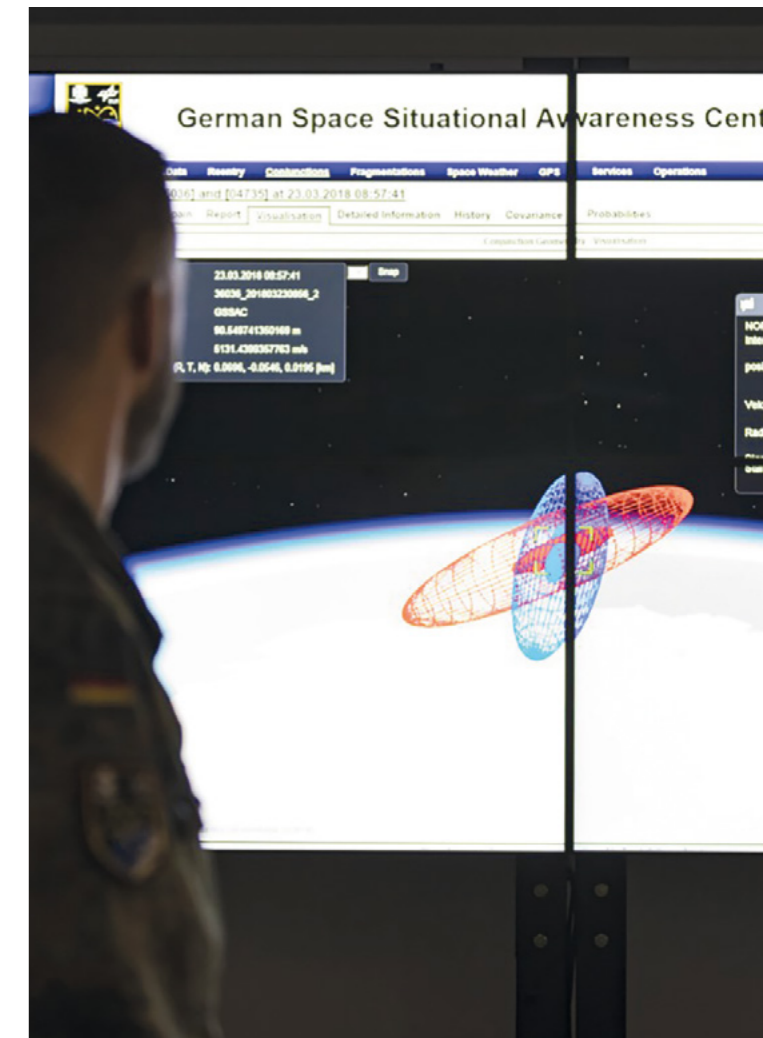
At the German Space Situational Awareness Centre in Uedem, the Bundeswehr and the German Aerospace Center (DLR) jointly protect civilian and military systems in space.