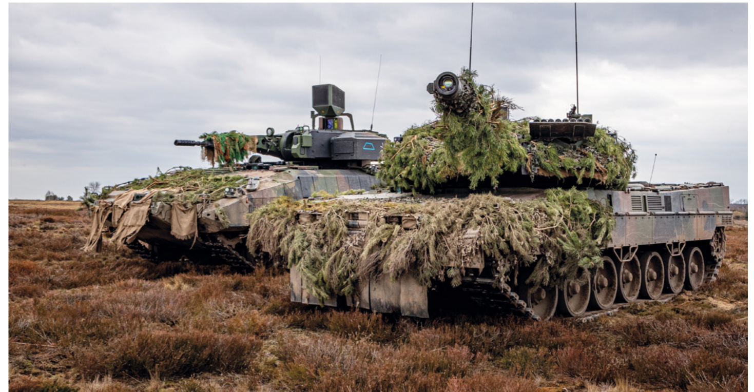
The Bundeswehr's Puma infantry fighting vehicle and Leopard

The paramount task of German security policy is to ensure that we can continue to live in our country at the heart of Europe in peace, freedom and security. Germany's security is indivisible from that of its allies and European partners. Collective and national defence are one and the same. The Federal Government will resolutely resist any military aggression or attempts at intimidation aimed at us or our allies. The Bundeswehr remains the guarantor of Germany's deterrence and defence capability. The Bundeswehr is a parliamentary army.