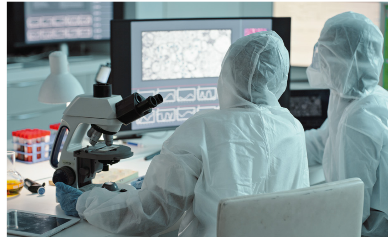
The global prevention of, and swift reaction to, pandemics is also key to guaranteeing human security.