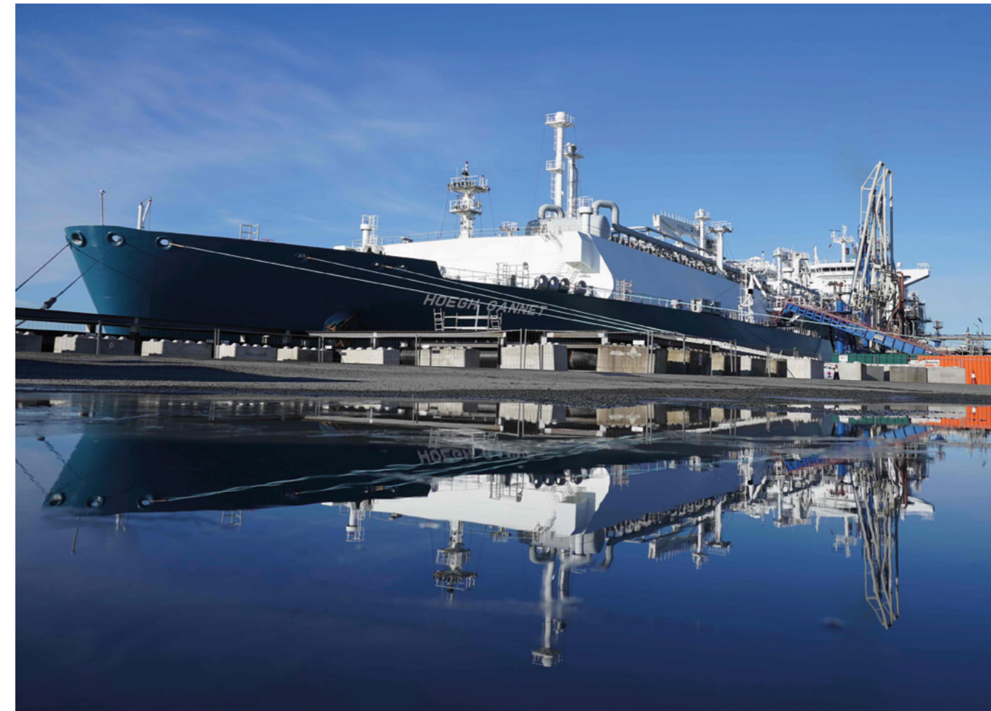
To safeguard its energy security, Germany is also promoting the establishment of LNG terminals off its coast.