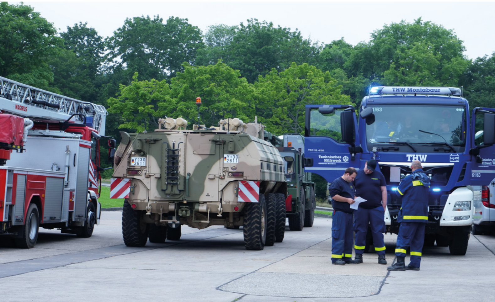
Crises and disasters are successfully tackled through the cooperative efforts of various authorities and institutions.

expand its space capabilities and work to further develop the international order in space.