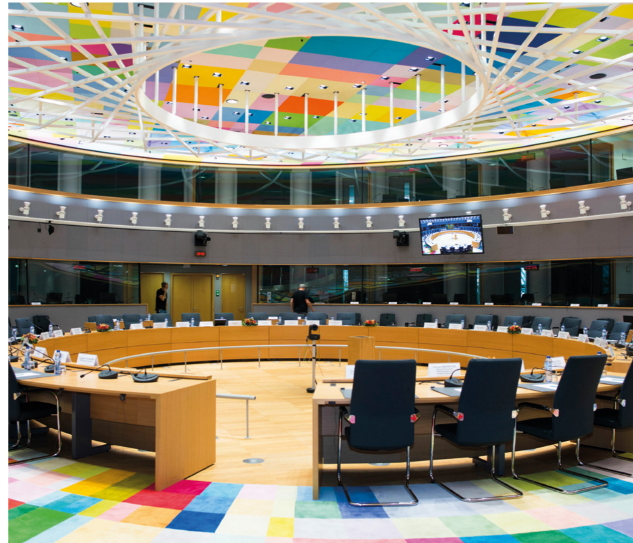
The meeting room of the European Council in Brussels

» At EU level, the Federal Government will seek to further develop the EU Civil Protection Mechanism and the European reserve rescEU. We will endeavour to expand transnational exercises and to develop European standards for the EU-wide exchange of information before, during and after crises and for the training of civilian personnel. In addition, we will take issues involving cross-border links with our European neighbours' critical infrastructure into account to a greater extent.