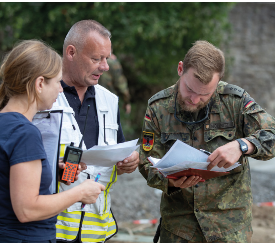
The Bundeswehr supported clean-up efforts after the devastating floods in the Ahr valley.

»The Federal Government will expand its cyber and space capabilities, as well as its space situational awareness capabilities, so that these capabilities can play a major role in collective deterrence and defence in NATO.