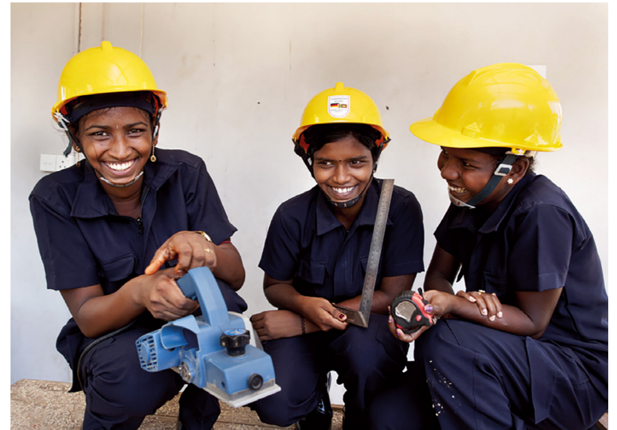
By promoting vocational education and training for women, Germany is strengthening social resilience in partner countries.

»In order to also strengthen even further the important role of the police in international endeavours in civil crisis prevention and civil crisis management, we are expanding our engagement with police officers specially trained for missions abroad. Our aim is to have a higher number of qualified officers at our disposal and to create additional incentives to further increase our participation in international missions.