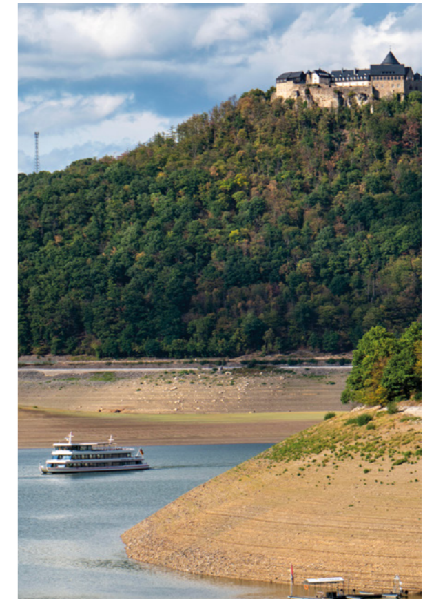
The impact of the climate crisis on people and the planet has become especially clear in recent years all around the globe – including in Germany.