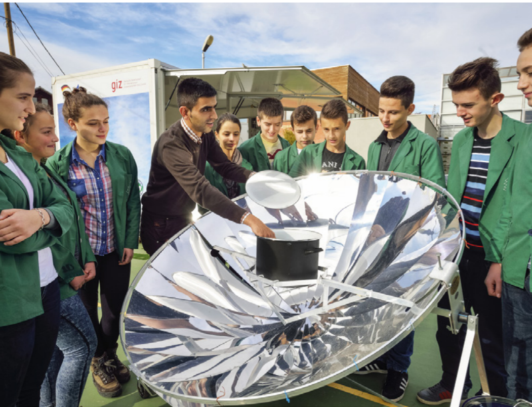
Pupils in Pristina learn how solar technology can be used to address the climate crisis.

Our global resources crisis requires a response on the part of all countries. The Federal Government therefore aims to find global and ambitious solutions. This includes a dialogue with all relevant actors. An openness to all technological possibilities makes it possible to ensure freedom of action, for us and for coming generations.