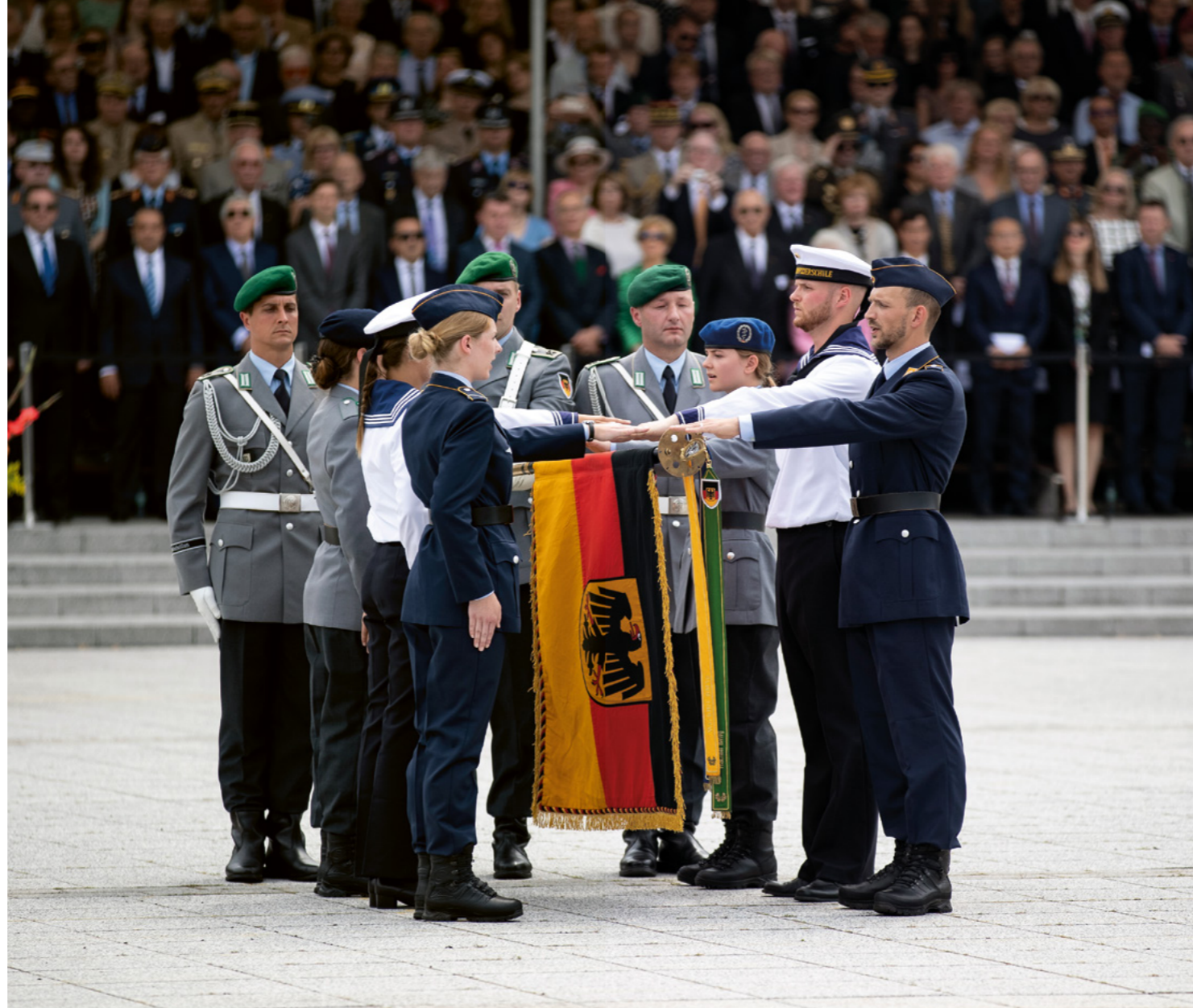
Bundeswehr recruits at their swearing-in ceremony