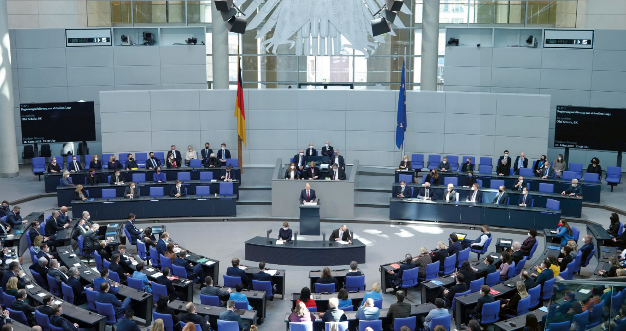
Plenary debate on the Zeitenwende in the German Bundestag on 27 February 2022

rising sea levels, altered precipitation patterns, the loss of biodiversity and the depletion of natural resources all threaten people's livelihoods and the very foundations of our economies. Climate-induced extreme weather events with devastating consequences are happening with greater frequency and intensity, also in Germany. This places critical infrastructure under additional pressure. In many regions of the world, the climate crisis is fuelling conflict, contributing to hunger and other humanitarian emergencies. The climate crisis also exacerbates existing inequalities. It already has security ramifications today. Human security also depends on how we deal with this existential threat to vital resources. We cannot, however, completely eliminate these impacts; the best we can do is limit them. At the