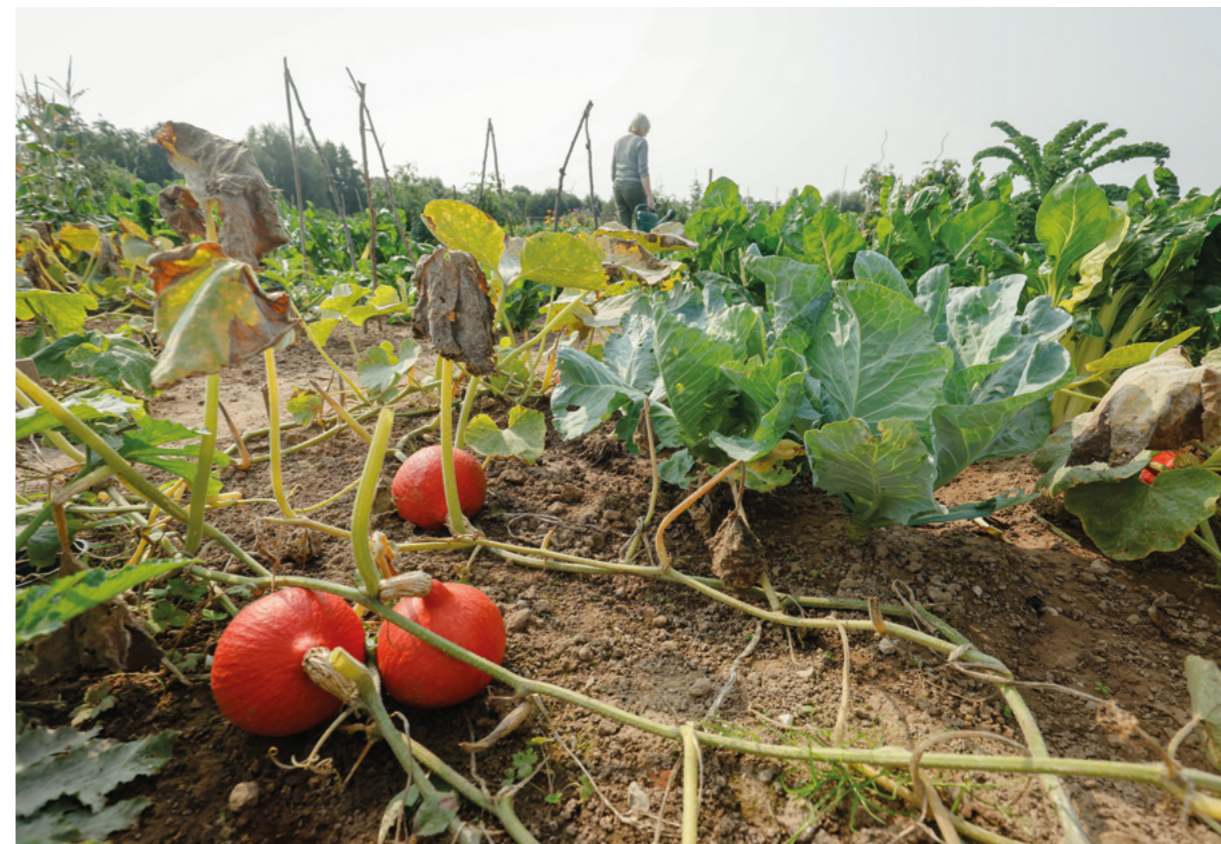
The Federal Government is promoting the transformation to sustainable and resilient agricultural and food systems.

The implementation of the human right to adequate food is a guiding principle for the Federal Government's activities. Food insecurity and inadequate nutrition impair people's health. It also adversely affects development policy, inflicts economic damage and destabilises entire societies – with the effects also being felt in Germany.