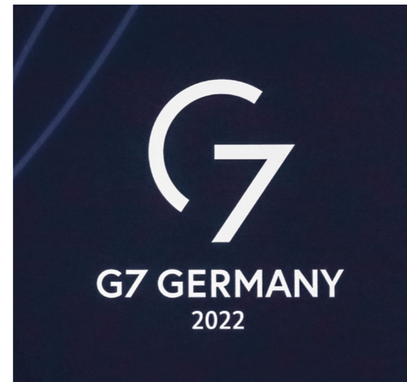
Germany highly values its exchange with G7 partners on current global challenges.

The intensified international competition with regard to technology can give rise to security risks if the free access to certain technologies is no longer guaranteed and one-sided dependencies arise.