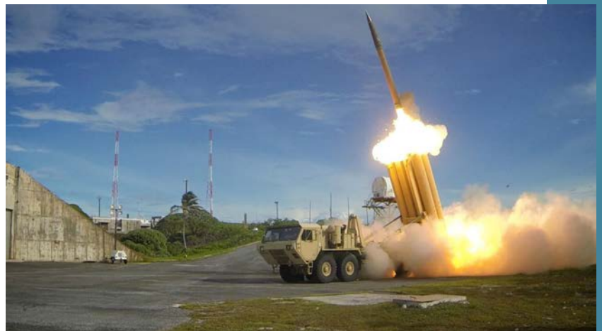
The first of two Terminal High Altitude Area Defense (THAAD) interceptors is launched during a successful intercept test.

The budget also invests $9.1 billion for missile defense in FY 2017, and $47.1 billion over the FYDP. This reflects important decisions we've made to strengthen and improve our missile defense capabilities — particularly to counter the anti-access, area-denial challenge of increasingly precise and increasingly long-range ballistic and cruise missiles being fielded by several nations in multiple regions of the world. Instead of spending more money on a smaller number of more traditional and expensive interceptors, we're funding a wide range of defensive capabilities that can defeat incoming missile raids at much lower cost per round, and thereby impose higher costs on the attacker. The budget invests in improvements that complicate enemy targeting, harden our bases, and leverage gun-based point defense capabilities — from upgrading the Land-Based Phalanx Weapons System, to developing hypervelocity smart projectiles that as I mentioned earlier can be fired not only from the five-inch guns at the front of every Navy destroyer, but also the hundreds of Army M109 Paladin self-propelled howitzers.