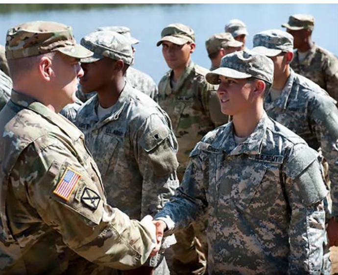
Capt. Kristen M. Griest, is one of the first women to earn the Ranger tab on Fort Benning, Ga.

to those who serve in uniform. In FY 2017, it also includes $79.3 billion to support our civilian workforce of 718,000 Americans — men and women across the country and around the world who do critical jobs like helping repair our ships and airplanes, providing logistics support, developing and acquiring weapon systems, supporting survivors of sexual assault,