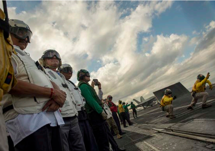
Secretary Carter and India's Minister of Defense Manohar Parrikar observe flight operations as they tour the USS Dwight D. Eisenhower.

strategic advantage in an area that's critically important to America's political, economic, and security interests. Investments in the budget reflect how we're moving more of our forces to the region – such as 60 percent of our Navy and overseas Air Force assets – and also some of our most advanced capabilities in and around the region, from F-22 stealth fighter jets and other advanced tactical strike aircraft, to P-8A Poseidon maritime surveillance aircraft, to our newest