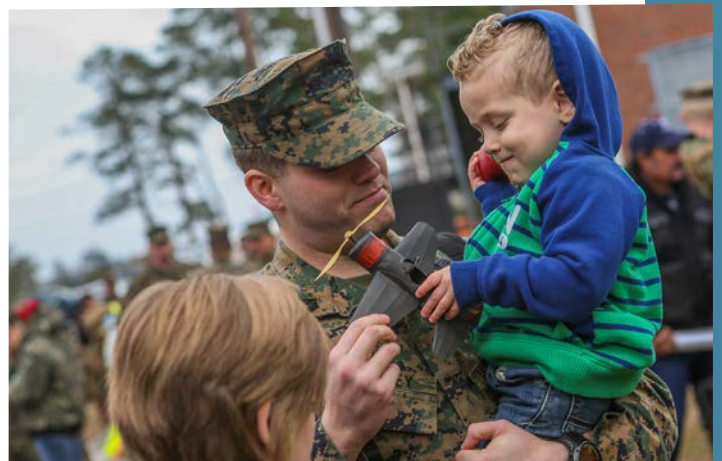
A Marine recently returned from deployment greets his family.