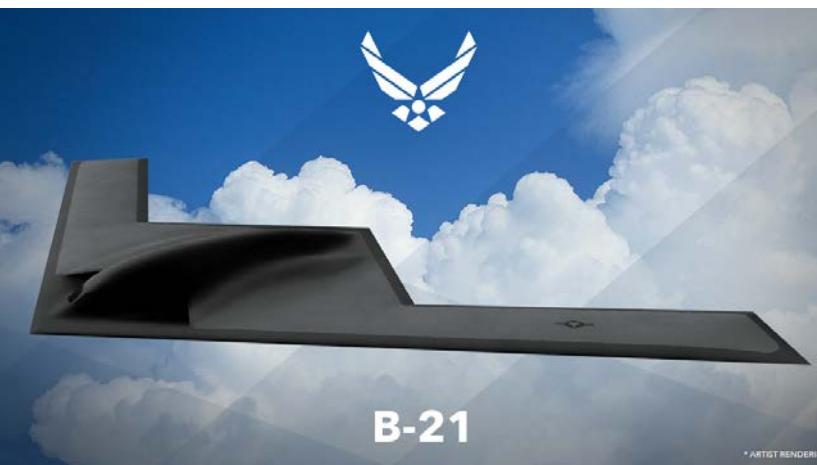
U.S. Air Force Concept

To ensure the U.S. military's continued air superiority and global reach, the budget makes important investments in several areas — and not just platforms, but also payloads. For example, it invests $2.4 billion in FY 2017 and $8 billion over the FYDP in a wide range of versatile munitions — including buying more Small Diameter Bombs, JDAMs, Hellfires, and AIM-120D air-to-air missiles. We are also developing hypersonics that can fly over five times the speed of sound.