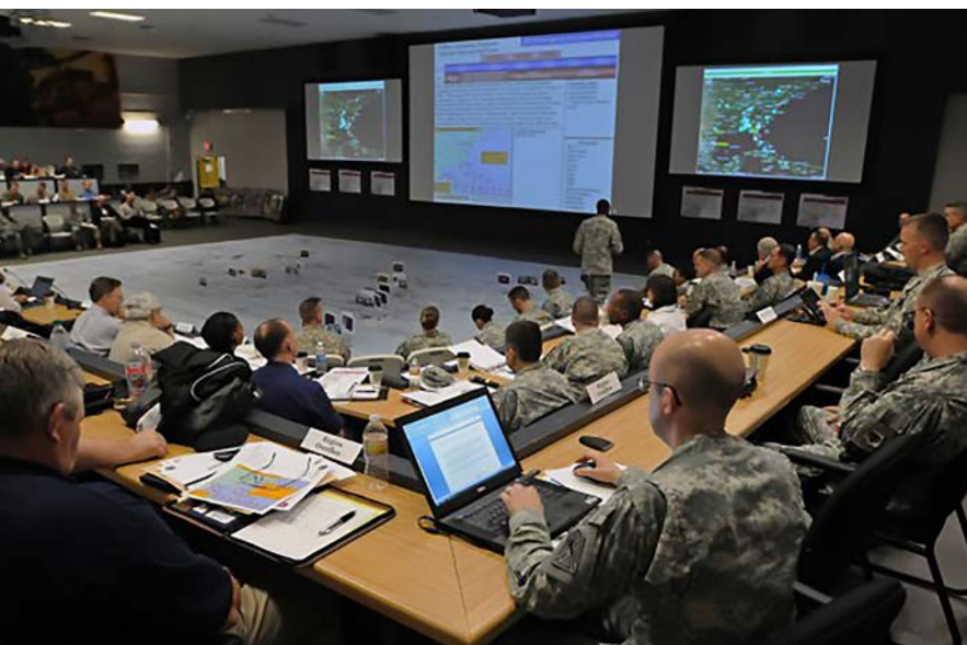
Army North/Joint Force Land Component Command teams up leaders from the Department of Homeland Security, the Department of Health and Human Services, U.S. Northern Command, U.S. Army North, the National Guard Bureau and many others in this simulation.

Because our military has to have the agility and ability to win both the fights we're in, the wars that could happen today, and the wars that could happen in the future, we're always updating our plans and developing new operational approaches to account for any changes in potential adversary threats and capabilities, and to make sure that the plans apply innovation to our operational approaches — including ways to overcome emerging threats to our security, such as cyberattacks, anti-satellite weapons, and anti-access, area denial systems. We're building in modularity that gives our chain of command's most senior decision-makers a greater variety of choices. We're making sure planners think about what happens if they have to