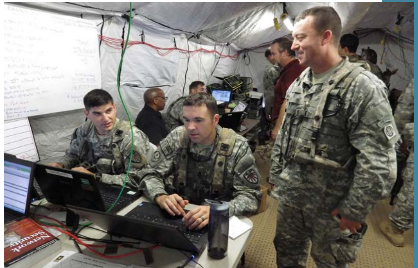
Soldiers from U.S. Army Cyber Protection Brigade discuss the response to a simulated cyber attack on the 1st Brigade Combat Team, 82nd Airborne Division.

Reflecting our renewed commitment to deterring even the most advanced adversaries, the budget also invests in cyber deterrence capabilities, including building potential military response options. This effort is focused on our most active cyber aggressors, and is based around core principles of resiliency, denial, and response.