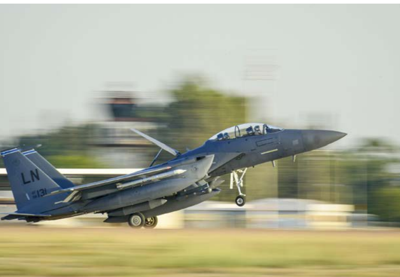
An F-15E Strike Eagle from the 48th Fighter Wing lands at Incirlik Air Base, Turkey, deployed in support of Operation Inherent Resolve and counter-Islamic State of Iraq and the Levant missions in Iraq and Syria.

The terrorist threat is continually evolving, changing focus and shifting location, requiring us to be flexible, nimble, and far-reaching in our response. Accordingly, the Defense Department is leveraging the existing security infrastructure we've already established in Afghanistan, the Middle East, East Africa, and Southern Europe, so that we can counter transnational and transregional terrorist threats like ISIL and others in a sustainable, durable way going forward. From the troops I visited in Morón, Spain last October, to those I visited in Jalalabad, Afghanistan last December, these locations and associated forces in various regions help keep us postured to respond to a range of crises, terrorist and other kinds. In a practical sense, they enable our crisis response operations, counter-terror operations, and strikes on high-value targets, and they help us act decisively to prevent terrorist group affiliates from becoming as great