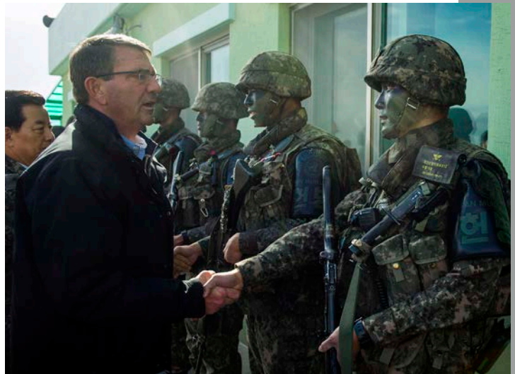
Secretary Carter shakes hands with Republic of Korea Army Soldiers during a visit to The Korean Demilitarized Zone.

North Korea’s nuclear test on January 6th and its ballistic missile launch on February 7th were highly provocative acts that undermine peace and stability on the Korean Peninsula and in the region. The