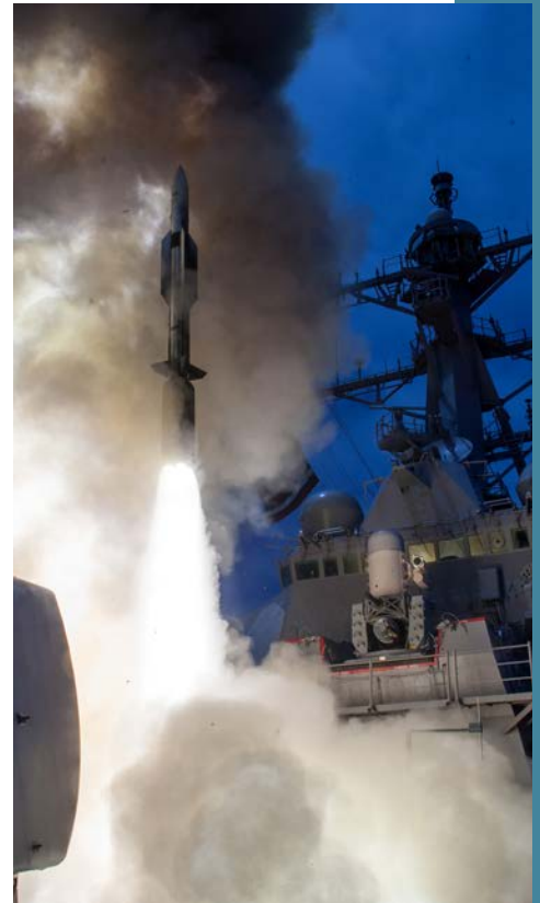
USS John Paul Jones (DDG 53) launches a Standard Missile-6 (SM-6) during a live-fire test of the ship's aegis.

Importantly, technological innovation must be done in concert with operational innovation. It's not enough to have or create new technologies or weapon systems; how they are used is key. The budget reflects work DoD has been undertaking in this area through multiple lines of effort. First, there's our Long-Range Research and Development Planning Program — an effort named after the mid-1970s project that brought together a cross-section of military, academic, and private-sector experts who paved the way to a future of GPS-guided smart bombs, battle networks, and stealth — and also our Advanced Capability and Deterrence Panel. Both focus on identifying and charting longer-term, leap-ahead investments for strategies and capabilities that will give us an advantage several decades from now, and together they make up nearly 60 percent of our science and technology investments in this budget submission.