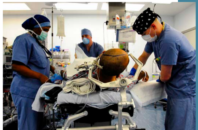
Medical staff with the 455th Expeditionary Medical Operations Squadron prepare a patient for brain surgery.

DoD greatly appreciates that Congressional leaders have said 2016 will be the year to reform our military healthcare system, TRICARE, after having passed retirement modernization reform in 2015. As Congress knows, DoD has proposed various ways to reform TRICARE for several years, so we look forward to working very closely with Congress in the year ahead. The reforms reflected in the budget give beneficiaries more simplicity and choice in how they manage their healthcare, while also incentivizing the much more affordable use of military treatment facilities. This will not only save money, but also maximize the workload and readiness of our military's medical force, giving our doctors, nurses, medics, and corpsmen the experience they need to be effective at their mission. Together this should generate about $548 million in FY 2017 and almost $7 billion over the FYDP that can be better spent in other ways without sacrificing the care of our people. It's time to get this done.