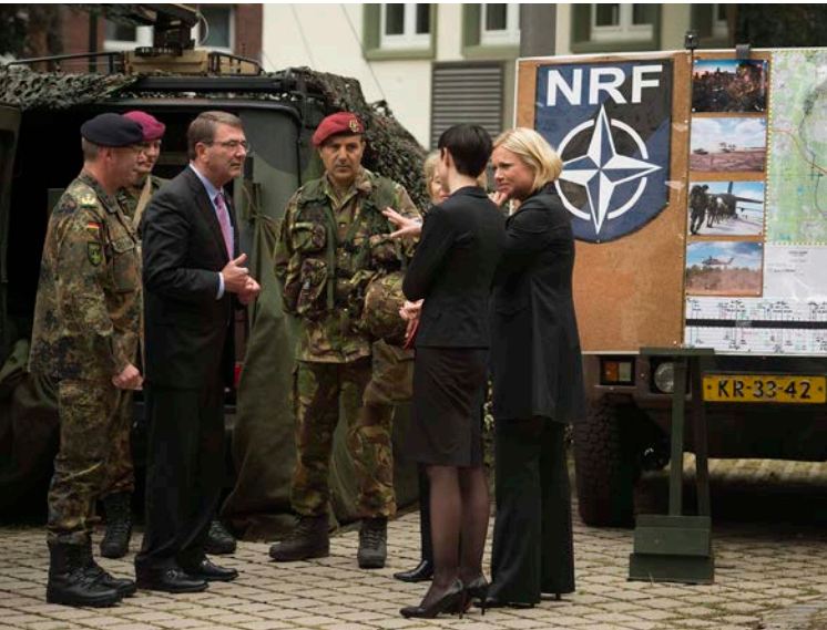
Secretary Carter and Ministers of Defense from Germany, the Netherlands and Norway speak with soldiers from the NATO rapid response force at the 1 German Netherlands Corps in Muenster, Germany.

In addition, the budget reflects how we're doing more, and in more ways, with specific NATO allies. Given increased Russian submarine activity in the North Atlantic, this includes building toward a continuous arc of highly-capable maritime patrol aircraft operating over the Greenland-Iceland-United Kingdom gap up to Norway's North Cape. It also includes the delivery of Europe's first stealthy F-35