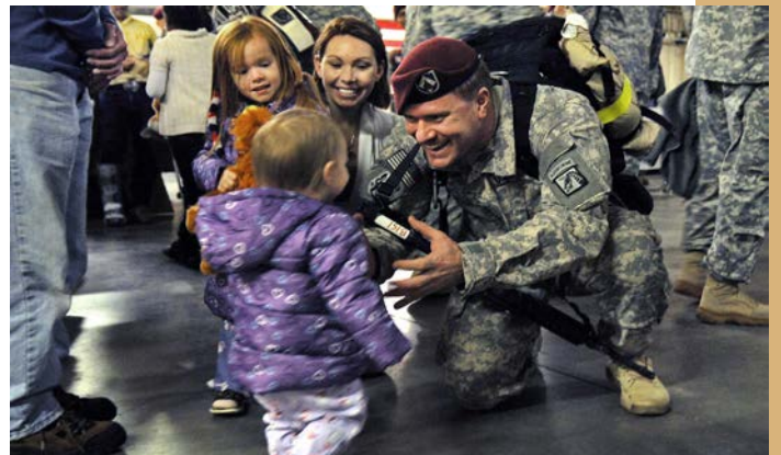
A soldier recently returned from deployment greets his daughter.