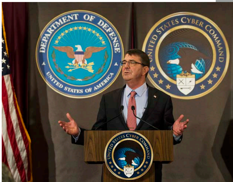
Secretary Carter briefs troops and members of the press at National Security Agency headquarters on Fort Meade, Md.

Meanwhile, with critical investments in other areas, the budget enables DoD to continue to advance our preparations, posture, partnerships, and planning to preserve the President’s options for any contingency. It strengthens the regional security architecture in a way that blunts Iran’s ability to coerce its neighbors. And it helps us stay ahead of the risks posed by Iran’s ballistic missiles, naval forces, cyber capabilities, and support for terrorists and others in the region.