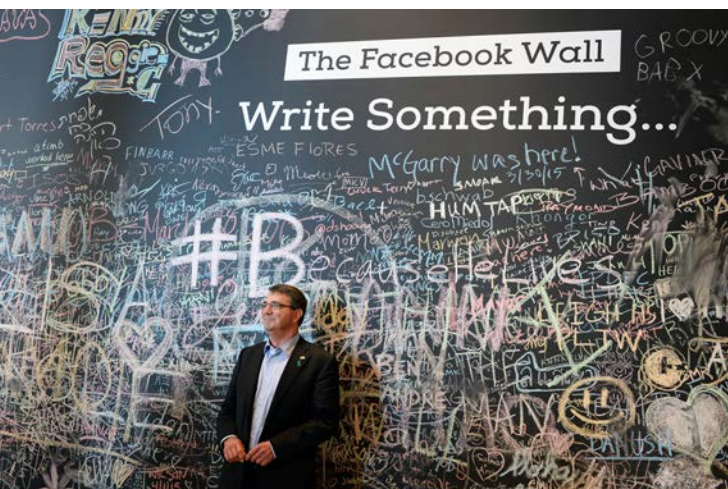
Secretary Carter stands in front of the Facebook wall during his trip to their headquarters.

I outlined the first link we're building to the force of the future at George Washington University last November, announcing over a dozen new initiatives in several categories that are intended to make our future Defense Department better connected to 21st century talent.