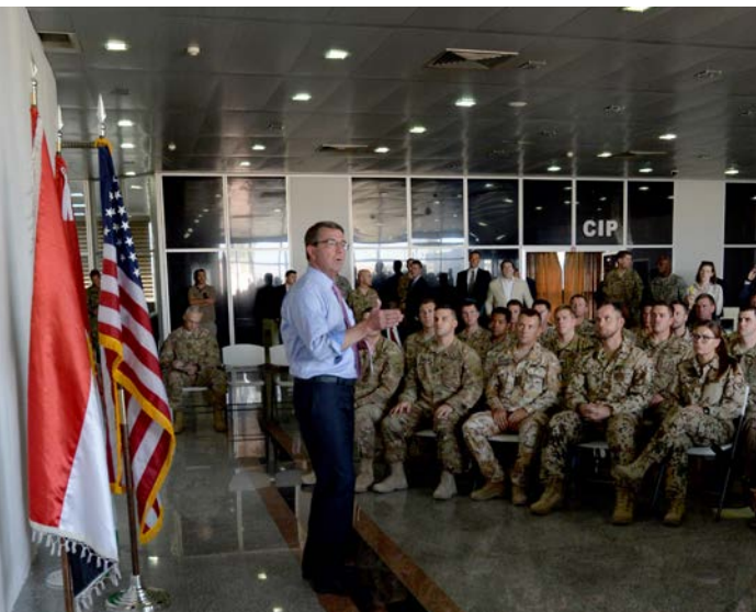
Secretary Carter speaks to soldiers from a number of nations providing training to Iraqi forces in Northern Iraq.

To eliminate the parent tumor in Iraq and Syria, DoD is enabling local, motivated forces with critical support from a global coalition wielding a suite of capabilities-ranging from airstrikes, special forces, cyber tools, intelligence, equipment, mobility and logistics, training, advice and assistance. It must be local forces who deliver ISIL a lasting