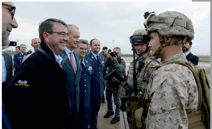
Secretary Carter and Spanish Defense Minister Pedro Morenes speak with Marines after observing an airfield seizure bilateral capabilities exercise on Morón Air Base, Spain.

That said, because many of the remaining detainees currently cannot be safely transferred to another country, we need an alternative to this detention facility. Therefore, I support the President's plan to establish and bring those detainees to an appropriate, secure, alternative location in the United States. I appreciate that Congress has indicated a willingness to consider such a proposal, and, in accordance with the 2016 National Defense Authorization Act, DoD delivered that plan to Congress earlier this week. We look forward to working with Congress to identify the most appropriate design, legislative foundation, and geographic location for future detention and to lift the restrictions preventing the responsible closure of the facility at Guantanamo.