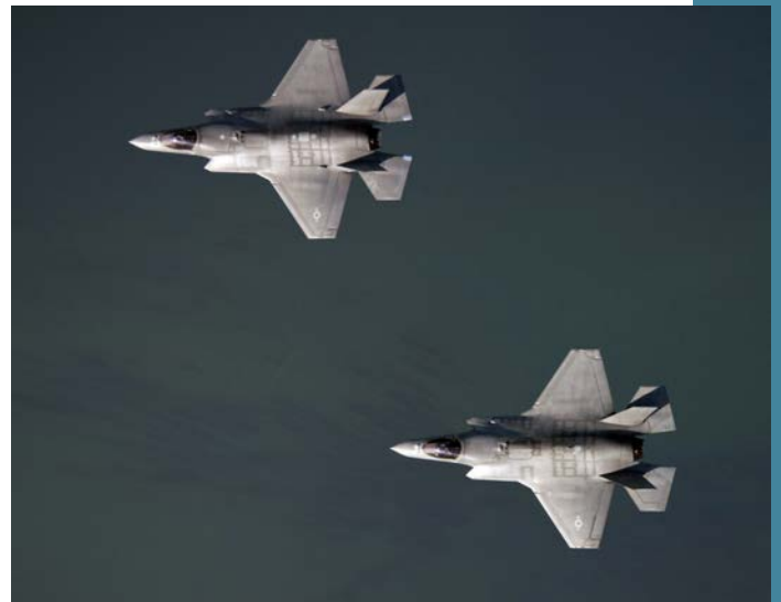
Two F-35s fly during a recent training exercise.

Recognizing the immense value that wargaming has historically had in strengthening our force in times of strategic, operational, and technological transition — such as during the interwar years between World War I and World War II, when air, land, and naval wargamers developed innovative approaches in areas like tank warfare and carrier aviation — this budget makes significant new investments to reinvigorate and expand wargaming efforts across the Defense Department. With a total of $55 million in FY 2017 as part of $526 million over the FYDP, this will allow us to try out nascent operational concepts and test new capabilities that may create operational dilemmas and impose unexpected costs on potential adversaries. The results of future wargames will be integrated into DoD's new wargaming repository, which was recently established to help our planners and leaders better understand and shape how we use wargames while also allowing us to share the insights we gain across the defense enterprise.