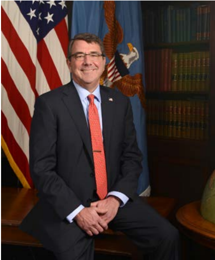
Ash Carter 25th Secretary of Defense

A year ago, I was sworn in as the 25th Secretary of Defense for the United States of America. At that time I made three commitments — the first, to our people, to make sure we take care of them and their families; the second, to the President, to provide him with the best military advice; and the third, to the future — to prepare this country’s Department of Defense (DoD) for the extraordinary changes that are happening in our world and be ready for advances our adversaries are making. We’ve gotten a lot done over the last year, and I’m deeply proud of our work to strengthen the United States military.