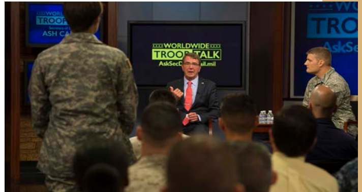
A servicemember poses a question to Secretary Carter during the first Worldwide Troop Talk.

And we're fostering greater diversity of our force, because our strength depends on being open to the widest possible pool of talent that can meet our standards—young Americans today are more diverse, open, and tolerant than past generations, and if we're going to attract the best among them to contribute to our mission, we ourselves have to be more diverse, and open, and tolerant, too. It's the only way to compete in the 21st century.