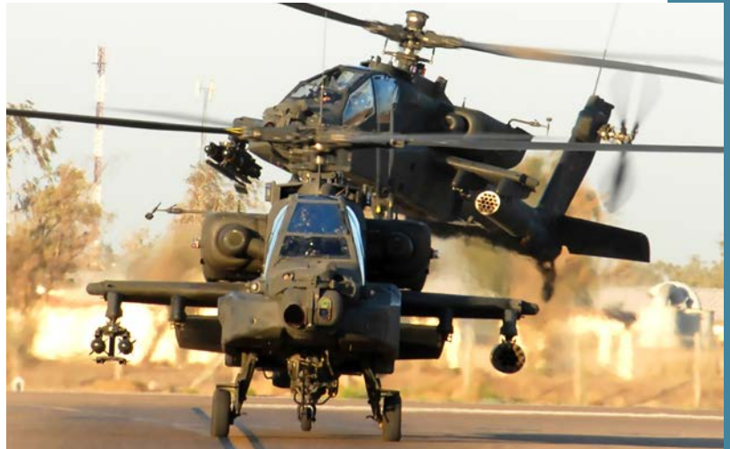
Two AH-64D Apache attack helicopters from 1st "Attack" Battalion, 227th Aviation Regiment, 1st Air Cavalry Brigade, 1st Cavalry Division.

By improving the readiness of the Army's Apache attack helicopters, and better leveraging the diverse capabilities Black Hawk helicopters bring to the table for National Guard missions both here at home and around the world when called upon as an operational reserve, the Army's planned Aviation Restructure Initiative is in the best interests of both the Army as well as the taxpayers who support it.