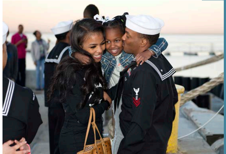
A sailor says goodbye to his family pier side prior to the departure of amphibious assault ship USS Boxer (LHD 4).

To build the force of the future, tackling these problems is imperative, especially when the generation coming of age today places a higher priority on work-life balance. These Americans will make up 75 percent of the American workforce