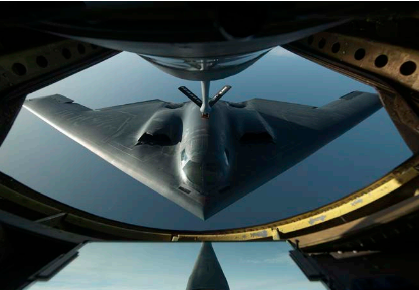
A B-2 Spirit flies into position during a refueling mission.

United States condemns these violations of U.N. Security Council resolutions and again calls on North Korea to abide by its international obligations and commitments. We are monitoring and continuing to assess the situation in close coordination with our regional partners.