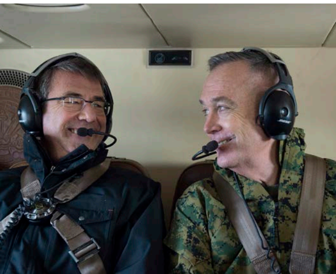
Secretary Carter and chairman of the Joint Chiefs of Staff Gen. Joseph Dunford.

As I've said consistently from the moment I became Secretary of Defense, I cannot ask for more taxpayer dollars for defense without being candid about the fact that not every defense dollar is spent as wisely or responsibly as it could be, and also being determined to change that and make our department more accountable. That's why reforming the DoD enterprise is so important — from improving how we're organized so we can best respond to the challenges and opportunities of the future security environment, to continuing to improve our acquisition and enterprise-wide business and audit practices, to reducing excess infrastructure and overhead, to modernizing the military healthcare system.