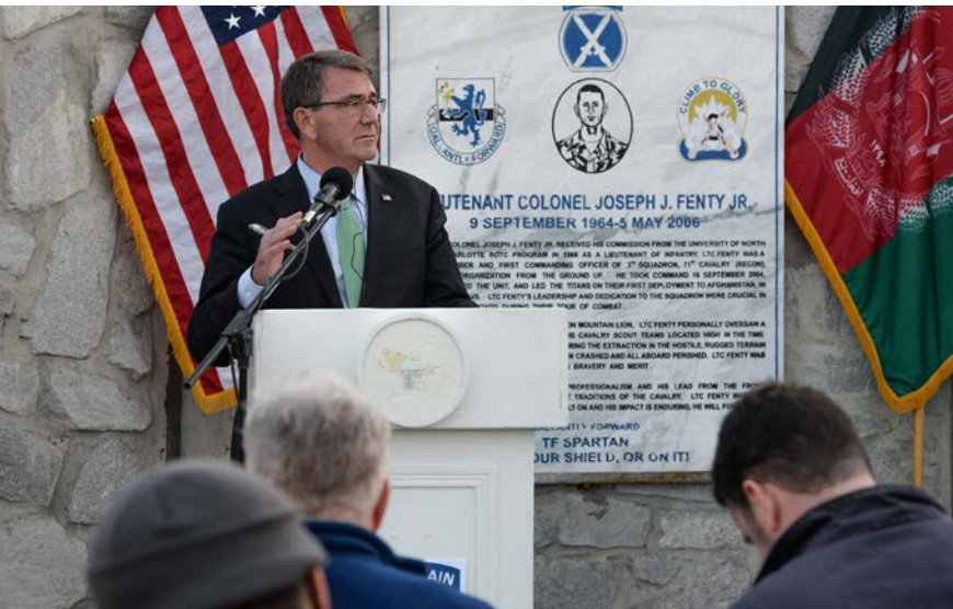
Secretary Carter holds a joint press conference with Defense Minister of Afghanistan Mohammed Masoom Stanekzai at Forward Operating Base Fenty, Jalalabad, Afghanistan.

Our continued presence in Afghanistan is not only a sensible investment to counter threats that exist and stay ahead of those that could emerge in this volatile region; it also supports the willing partner we have in the government