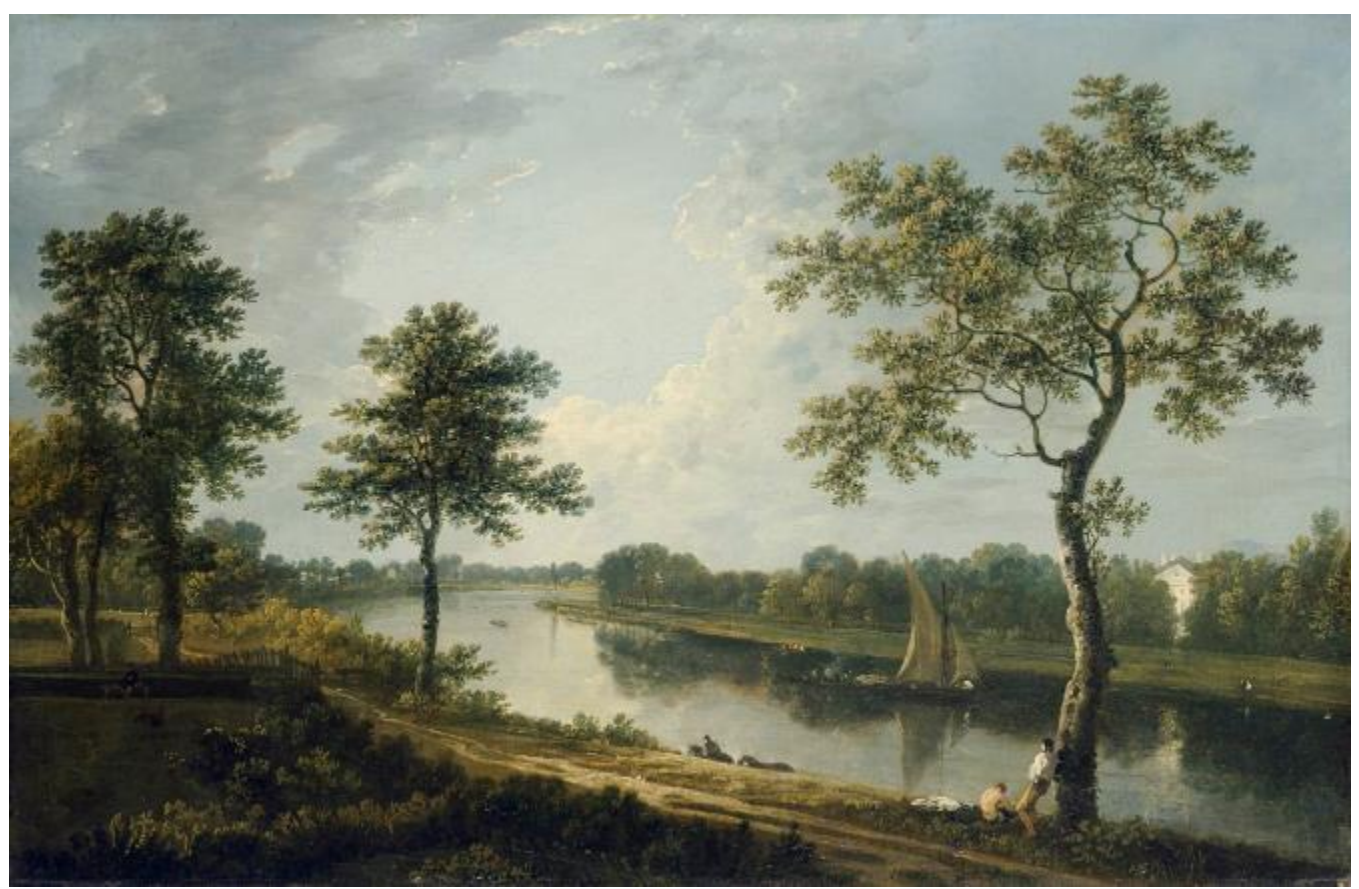
Figure 2 - Marble Hill is one of a number of interlinking historic designed landscapes along the River Thames between Hampton Court and Kew. The Arcadian setting was important to the design of these classical houses. English Heritage is a partner in the Thames Landscape Strategy to conserve and enhance this stretch of the river.

The context of a garden or designed landscape may also be seen in terms of the surrounding estate, or as part of the system of open spaces in which it is just one element. It could be one manifestation of a wider landscape trend, or of the corpus of work of a particular designer, or of a distinctive design form. The role of a garden or designed landscape in the context of an area's green infrastructure is likely to become increasingly important in a changing climate.