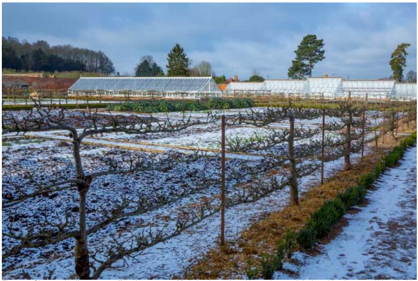
Figure 5: Changes in climate may affect the amount of fruit that is produced in gardens and designed landscapes. Although this does not impact the significance of the tree in its design context, it may have consequences in relation to interpretation to visitors and the perceived continued value of orchards and fruit trees in the landscape, including in the Kitchen Garden at Audley End