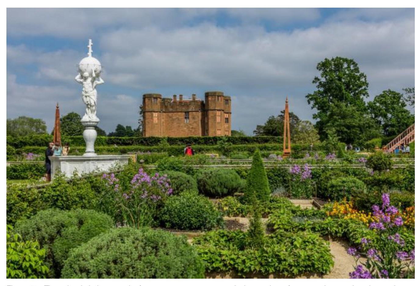
Figure 12 - Through scholarly research of a contemporary account and other garden references, plus corroborating garden archaeology evidence, the Elizabethan garden at Kenilworth was reconstructed to better understand the garden that was there in 1575 and offer a new experience for visitors.

The planting of borders and beds is often significant to gardens and gardening traditions, much as the decorative arts and furnishings add to the importance, aesthetics, and enjoyment of architectural heritage. Research into such contemporary details often exists or could be commissioned. However, it is also important to remember that planting schemes are usually reversible, so where evidence about the historic planting design is lacking the approach can be more flexible.