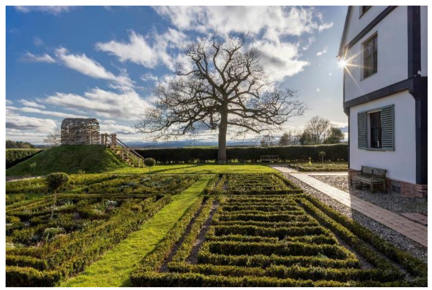
Figure 8 - The 19th century parterre at Boscobel House (Shropshire) is of historic interest as an example of the Victorian enthusiasm for "restoring" historic gardens.

A common thread is that a premium is placed on the fabric of a garden or designed landscape as being a direct link to its creation. If and when intervention becomes necessary following decay, the historic design should be re-created on a like-for-like basis.