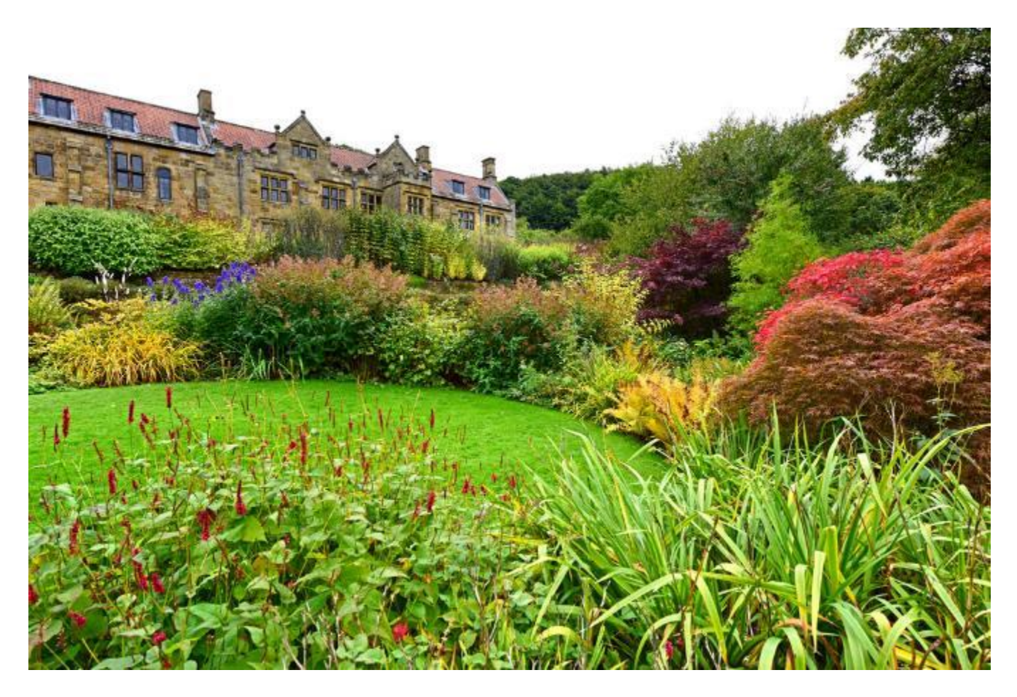
Figure 13 - At Mount Grace a modern designer, Chris Beardshaw, was commissioned to provide a new planting design to overlay the historic garden. This approach was taken only after detailed research was completed to understand the history and significance of the garden. This concluded that although the historic hard layout remained, there were no surviving historic plans for the planting.