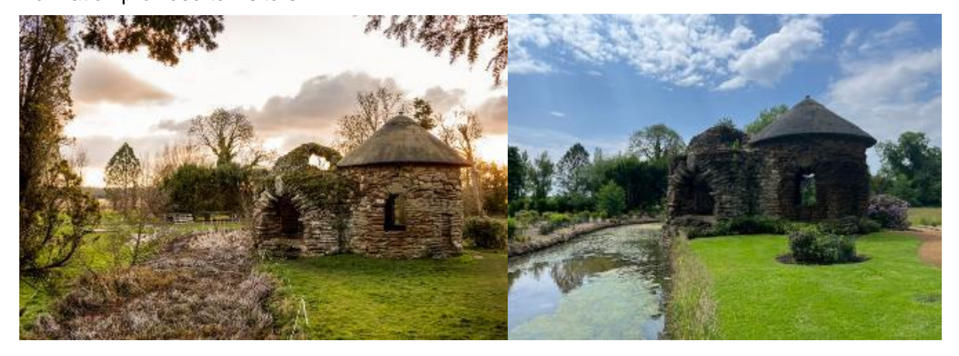
Figure 6 (before) and Figure 7 (after) - Key to the restoring the garden throughout Wrest Park was an understanding of the site's hydrology. Waterlogging had undermined the establishment of new planting in previous attempts to rejuvenate the 18th century gardens. Here we see the Bath House Water, before and after dredging and re-presentation.

Conjectural detailing involves reconstruction of an element of design using appropriate contemporary precedents, in the absence of reliable historic records showing its original form. It will often be possible and may be desirable in order to maintain the aesthetic coherence of the whole, provided its conjectural status is made clear in the Conservation Management Plan and in information provided to visitors.