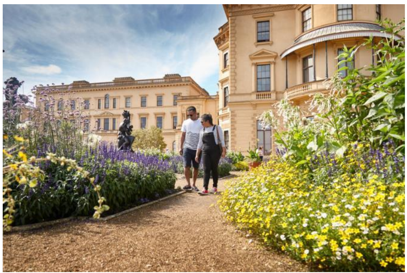
Figure 9 - The bedding schemes in the Victorian gardens at Osborne are renewed each spring and summer, as they would have been in Queen Victoria's time.

Any break of continuity in upkeep or like-for-like periodic renewal will cause premature failure of the fabric, including plantings. Upkeep and periodic renewal, undertaken regularly, will provide the best chance for the original vegetative and built fabric to survive, and thereby for the design intentions to be perpetuated. Any other form of treatment carries the possibility that the design intentions are not accurately reflected in new fabric. For this reason, upkeep and renewal is always the preferred treatment until such time as the fabric fails through normal decay, damage or use.