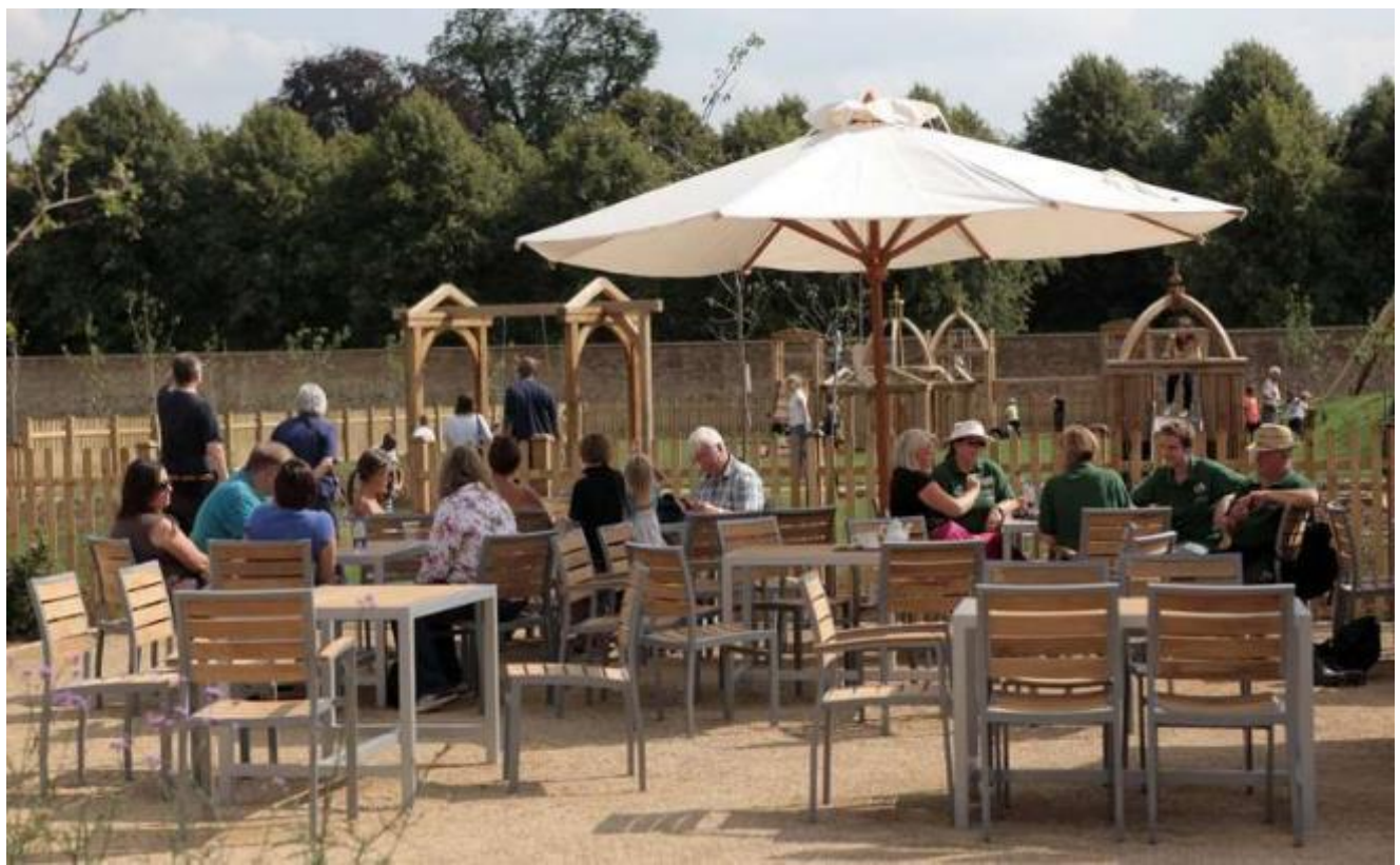
Figure 14 – At Wrest Park, new visitor facilities including a café and play area were added to the Walled Garden. This development is a contemporary design, but the proportions and style echoes garden sheds and it is tucked under the height of the existing garden walls. These decisions were the result of an evaluation and understanding of the history, significance and the survival of historic fabric.

negatively impact on the historic significance or detract from the very appeal and qualities of the landscape that make it a visitor attraction.