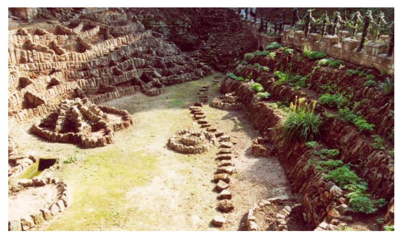
Figure 11: At Brodsworth Hall, the conservation project in the garden involved elements of repair, restoration and reconstruction. After an extended period of minimal maintenance the garden had become overgrown and the original design intention lost. Restoration included revealing and re-instating elements of the garden that had been eroded, obscured or partially removed.

The caution advised with other treatments with regard to removal of historic fabric applies with restoration too, but restoration should normally be acceptable if: