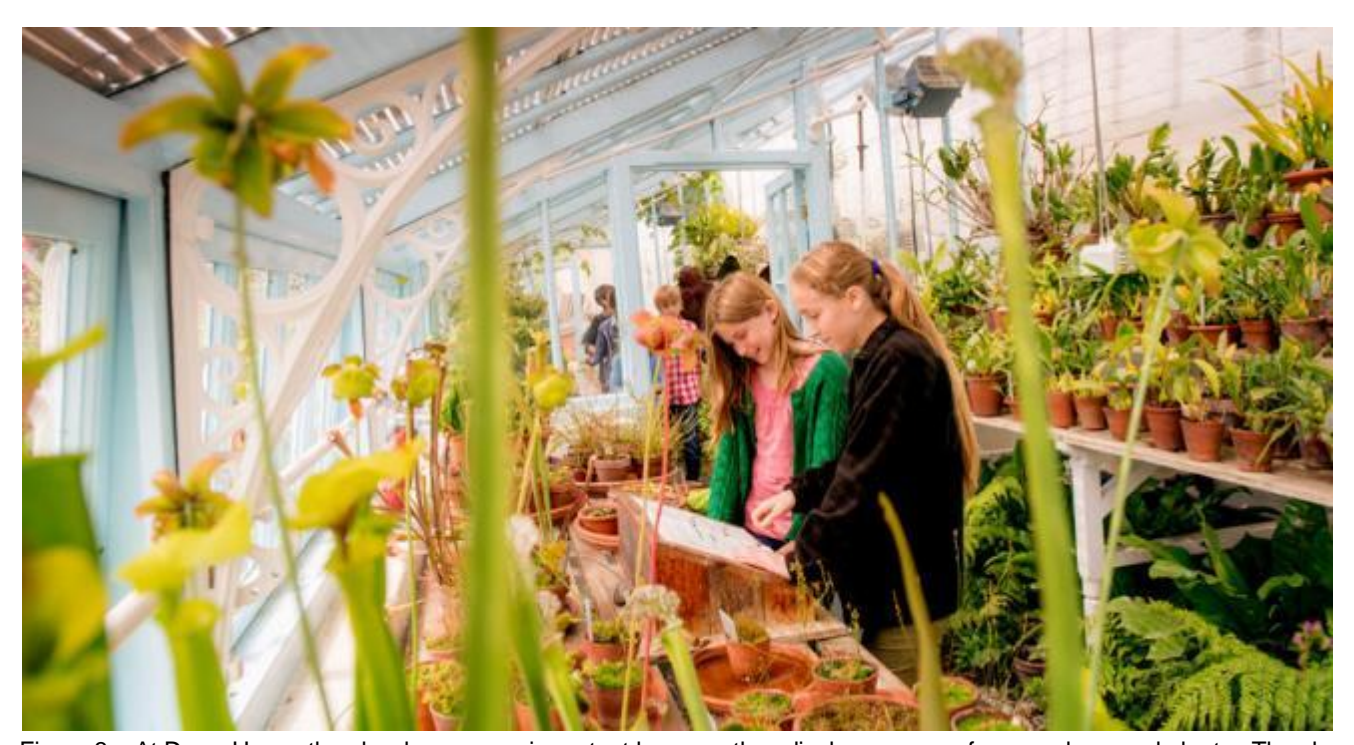
Figure 3 – At Down House the glasshouses are important because they display a range of rare and unusual plants. They have increased significance because this was the home of Charles Darwin, who used the plants at Down House as part of his experiments when researching and writing 'On The Origin Of Species'.

It is therefore important to recognise other qualities and to strive for an integrated and balanced approach to their future. It is important that dialogue starts at an early stage. Competing interests can usually be reconciled if all those involved in decision-making remain open-minded.