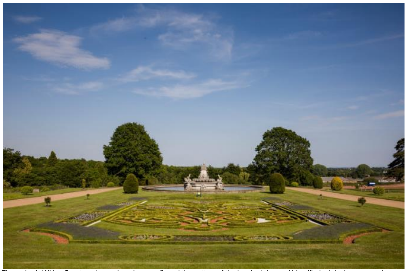
Figure 1 - At Witley Court garden archaeology confirmed the pattern of the box hedging and identified original ornamental aggregates enabling the garden team to reconstruct the flowing scroll designs of Nesfield's east parterre.

It is worth noting that the collection of information for a garden or designed landscape may differ in emphasis from other types of historic survey. Unlike the survey of an historic building, for example, greater attention might be given to the dynamics at work, the range of qualities represented and practical landscape management. A study of recent land use and management will also assist in understanding current processes and the likely trajectory of future change.