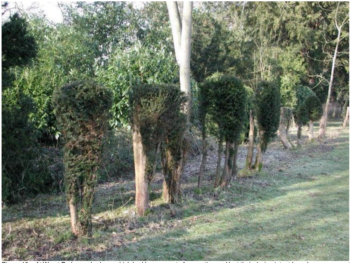
Figure 10 – At Wrest Park, yew hedges, which had become out of proportion and lost their design intent have been regenerated and will be managed to return them to their historic form without the introduction of new fabric. This is a good example of repair in historic gardens and landscapes.

Repairs that are so extensive that none, or only a small part, of a landscape component is left fall into the category of restoration or reconstruction.