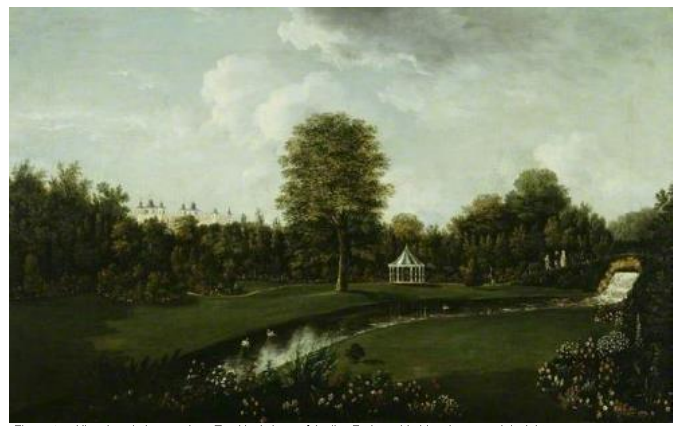
Figure 15 - Historic paintings such as Tomkins' views of Audley End provide historic research insights.

Initial surveys will be immediately useful in establishing historical and ecological interest. In the longer term, they will provide a baseline for monitoring the landscape to assess change or decay and evaluate the success or failure of the actions chosen. Ideally surveys will include key indicators of condition and suggest periodic monitoring activities and actions to be taken in response.