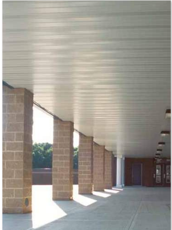
E-375 3/8" Soffit Panel

Englert Series E-375 Soffit Panels will provide a net free ventilation area (NFVA) of 6.528 square inches per square foot.