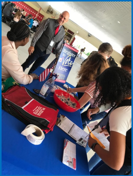
Voter Drive to recruit student election workers