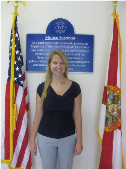
Student Intern/Election Worker