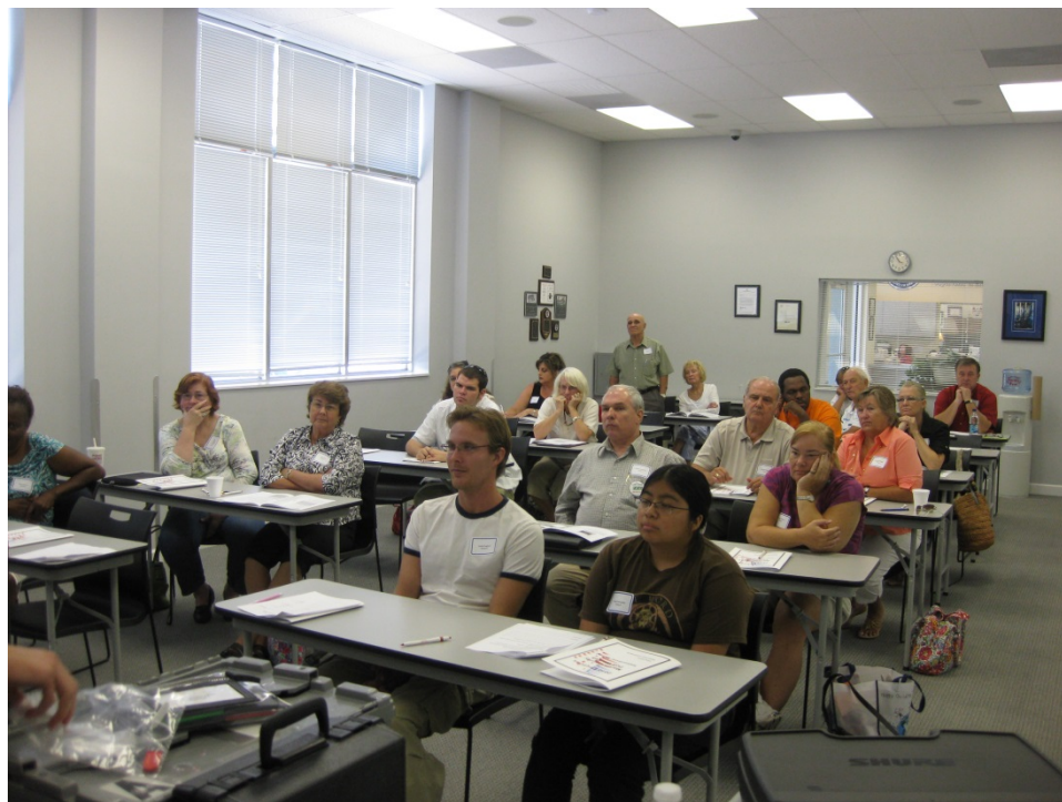
Election Worker Training-High School Students, College Students and Senior Workers