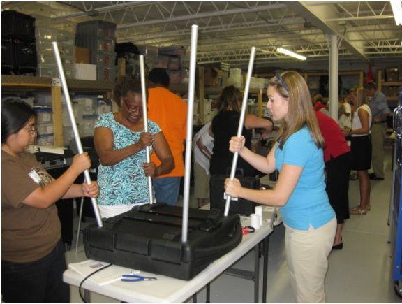
Students attending tech training