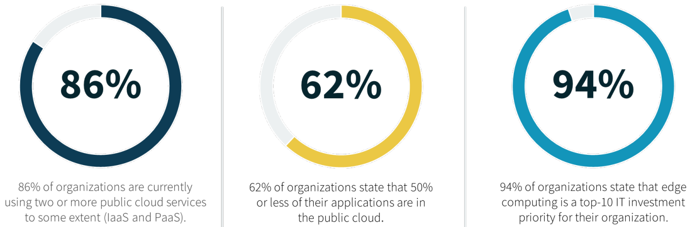
Figure 1. Distributed IT Environments