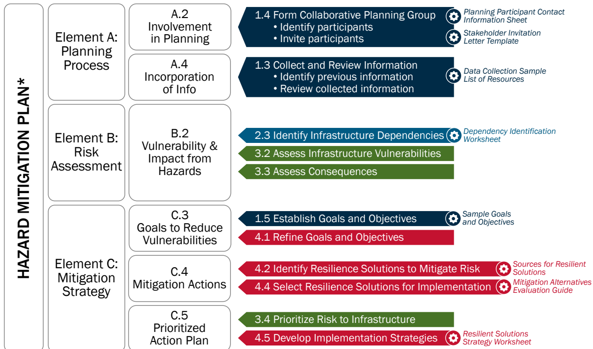
Figure B1. Incorporating the Outcomes of IRPF Actions into a Comprehensive Economic Development Strategy