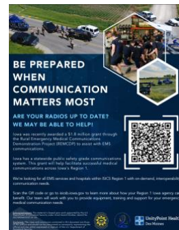
Figure 2: Iowa DPS Flyer

Iowa’s Department of Public Safety (DPS) aims to continually harden its communication network and maintain uninterrupted interoperability in rural emergency medical communications. Iowa is the nation’s 12 th most rural state, with 36% of its 3.2 million residents living in rural communities. Following a 2023 CISA ORAP assessment, Iowa identified variable current radio usage protocol applications, inconsistent Iowa Statewide Interoperable Communications System (ISICS) radio platform adoption, a lack of department-level standard operating procedures (SOPs), end-user reliance on both dispatch to ensure interoperability and cellular telephone networks for critical communications, and an outdated statewide EMS communications plan were gaps in emergency medical communications infrastructure.