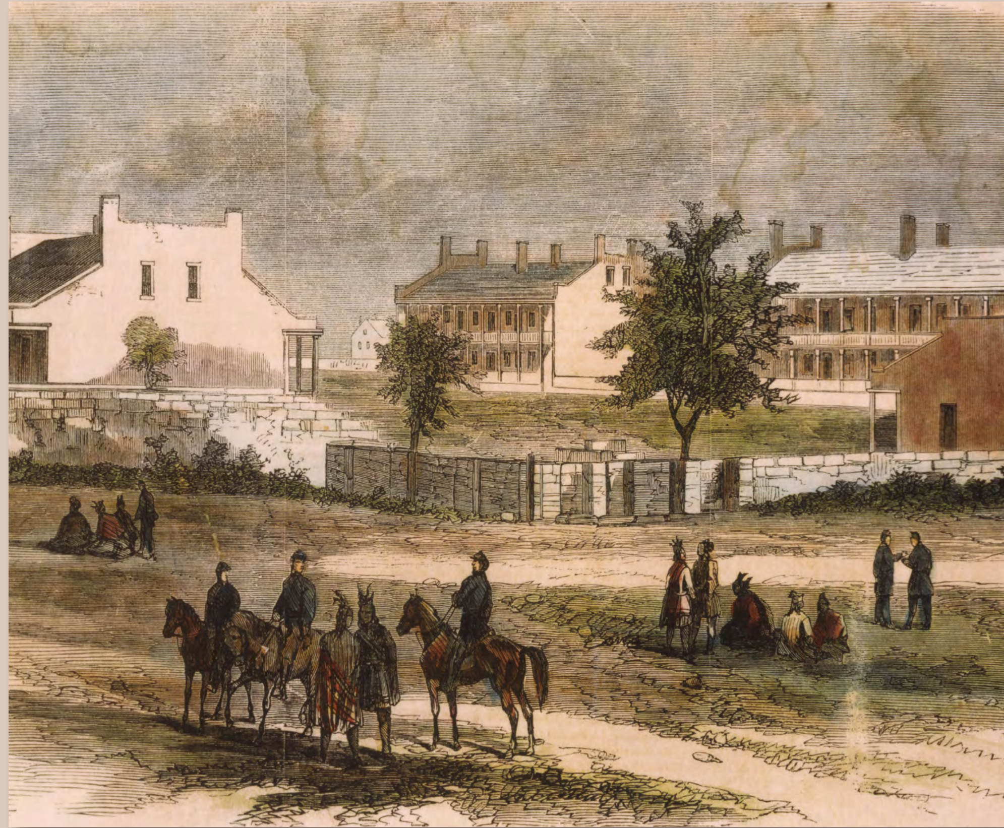
Fort Smith, 1865.