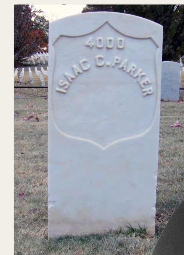
Isaac C. Parker, c. 1875.

Isaac Charles Parker was born on October 15, 1838, in Ohio. In 1859, he became a lawyer and moved to St. Joseph, Missouri. Parker resigned from his position as city attorney in 1861 to join the Union Army. After the Civil War, he was elected county prosecutor and later served two terms in the U.S. Congress. On March 18, 1875, President Ulysses S. Grant appointed him judge of the Western District of Arkansas, based in Fort Smith.