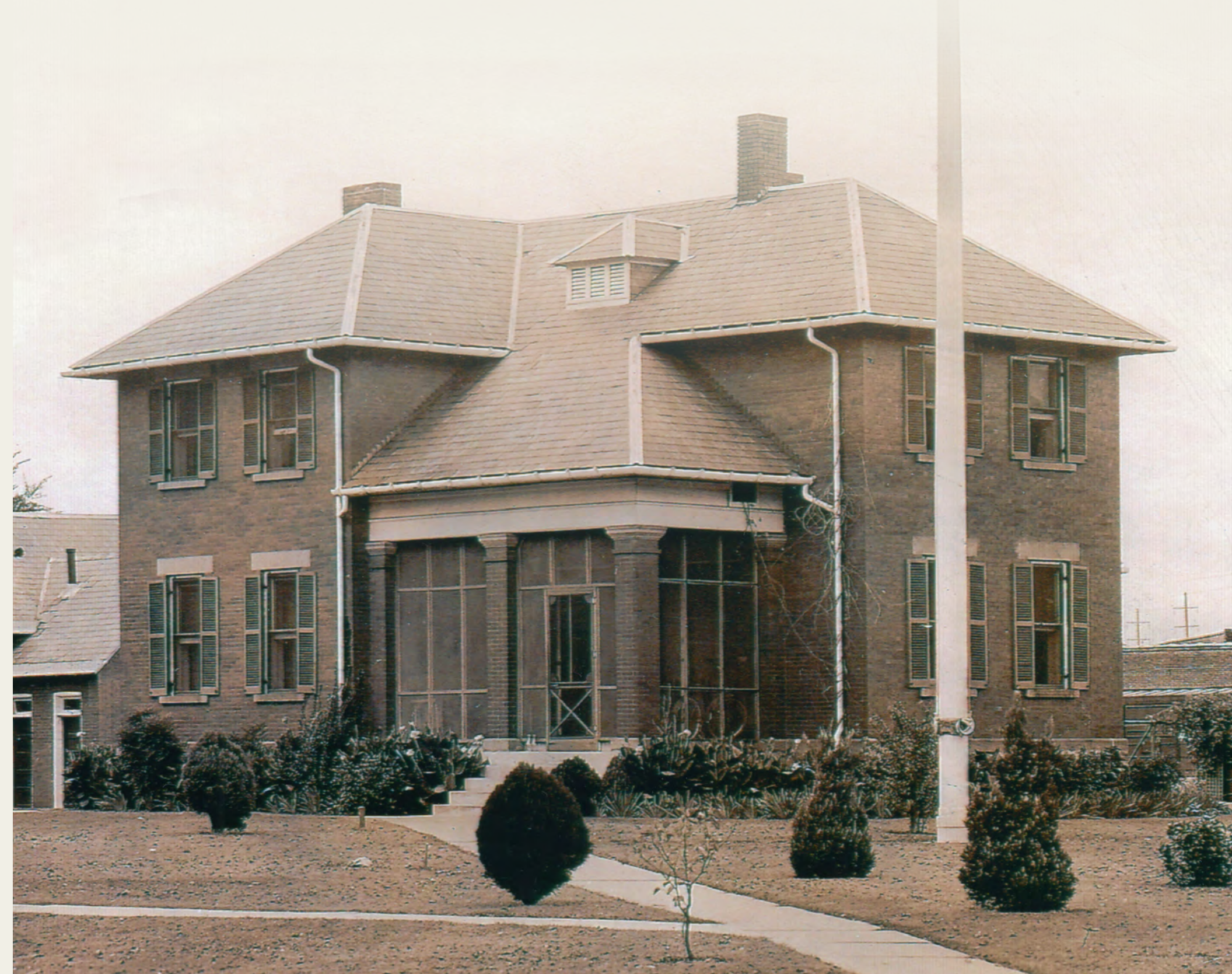
The lodge in 1941.

In the 1870s, the U.S. Army Quartermaster General's Office constructed a brick lodge and wall, and placed permanent marble headstones on the graves. In 1898, a tornado swept through Fort Smith and caused extensive damage. The wall was rebuilt in stone, and the lodge was replaced with the current two-story building in 1904. When a new entrance was erected in 1942, the old iron gates were moved into the cemetery. Over the years, the cemetery has expanded to more than 32 acres.