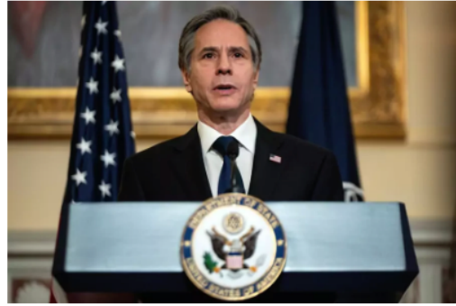
U.S. Secretary of State Antony Blinken speaks in the White House on March 3, 2021.