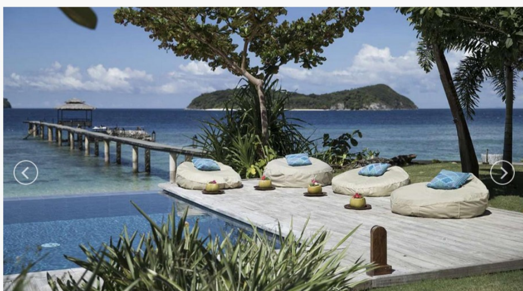
Lounge by the infinity pool on Ariara Island