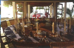
CLOCKWISE FROM LEFT Ariara's deck and infinity pool, dinner with a view, the island in all its verdant glory