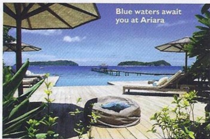
Blue waters await you at Ariara

Ariara, a stunning private island in a hard-to-reach corner of the Philippines, has finessed into a pinnacle of rustic luxury. Edged with pristine, arresting beaches and surrounded by azure waters, it is the ideal low-key hideaway for the discerning traveller, playing host to vast, beachfront suites and villas that boast uninterrupted views of the ocean. Privacy is paramount here. It accommodates up to 17 guests on an exclusive basis and offers cutting-edge dining that can be personalised from moonlit barbecue banquets to beach-party feasts. Choose between Beach Cottages with secluded pocket gardens, Jungle Villas perched on stilts, The Lodge Suite with an enormous platform bed and the North Beach Villa that overlooks the north end of the beach. Guests are granted exclusive use of the island and are given the luxury of being able to set their own agenda. For some fast-paced action, forage the waters of Palawan archipelago in a kayak, soak in the wind on a speedboat or enjoy the raw adrenalin of high-powered jet skis. Whether you enjoy relaxing on its tranquil shoreline or exploring its waterscapes, Ariara brings your high-octane world to a standstill and embodies utter indulgence to a tee. Visit www.ariara.com