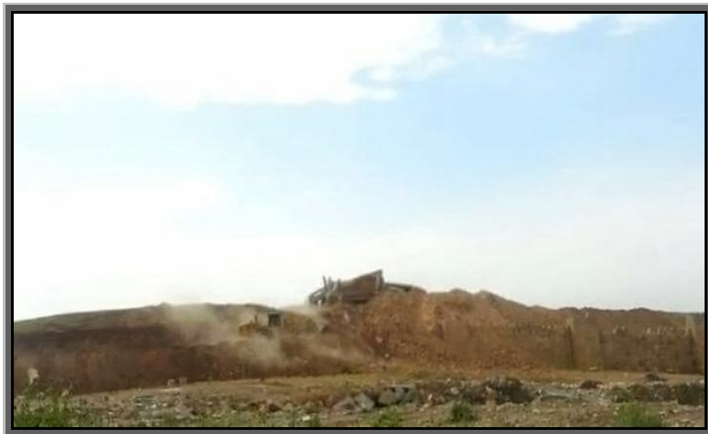
Fig.9 The destruction of Nergal Gate,( Source; National Geographic,2016)

The state board of antiquities and heritage (SBAH) preparing the tentative list for the site for inclusion on the World Heritage list since 2000.