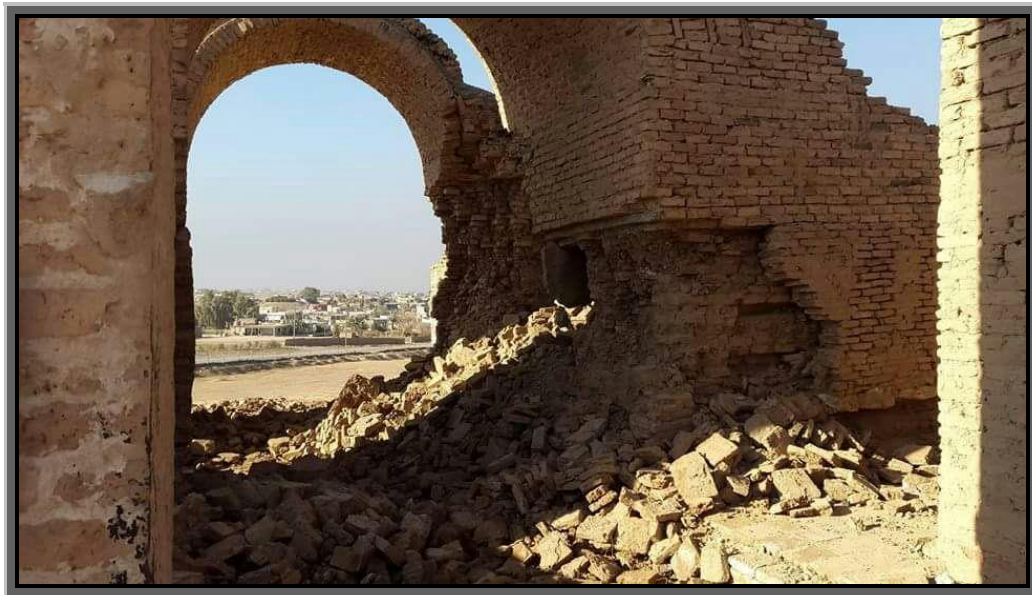
Fig.2 Tabira Gate, seriously affected2017

The military campaign by Iraqi forces began in 2016 fall to liberate Nineveh province from Islamic state terrorist forces as site of Ashur completely liberated and a first fast assessment of damage for site prepared by officials working in the site .