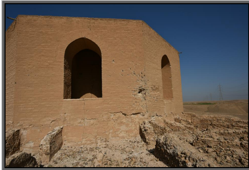
Fig.5 An affected area of Qubbat al Salybyya

- Damage happened on the site by exchanging fire with the enemy as it happened at Qubbat al Salybyya ,as warring parties occupied this significant monument in the city ,see figure ( 5 )