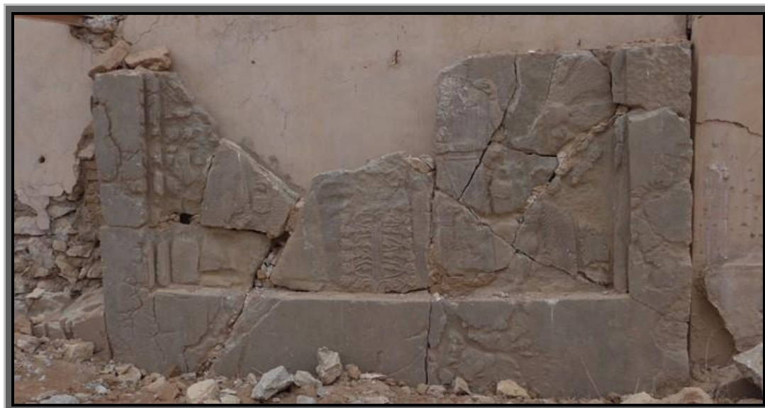
Fig. 8 Stone carvings destroyed in the city of Nimrod

As relevant with the matter and many variables in the field and entire liberation of the site the World Heritage Department/in (SBAH) recognized the affected areas based on the preliminary surveying ,carried out by teams working there , through a map prepared for that purpose.