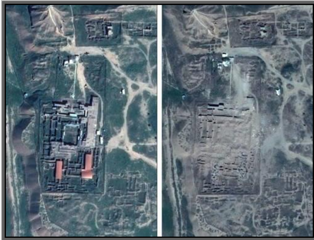
Fig. 7 An aerial image of Nimrod site observed damaged areas in red .

Through aerial photos analyzed by the United Nations Institute for training and research on 7/3/2015 showed that the most affected areas the Palace of Ashur Nasser II.