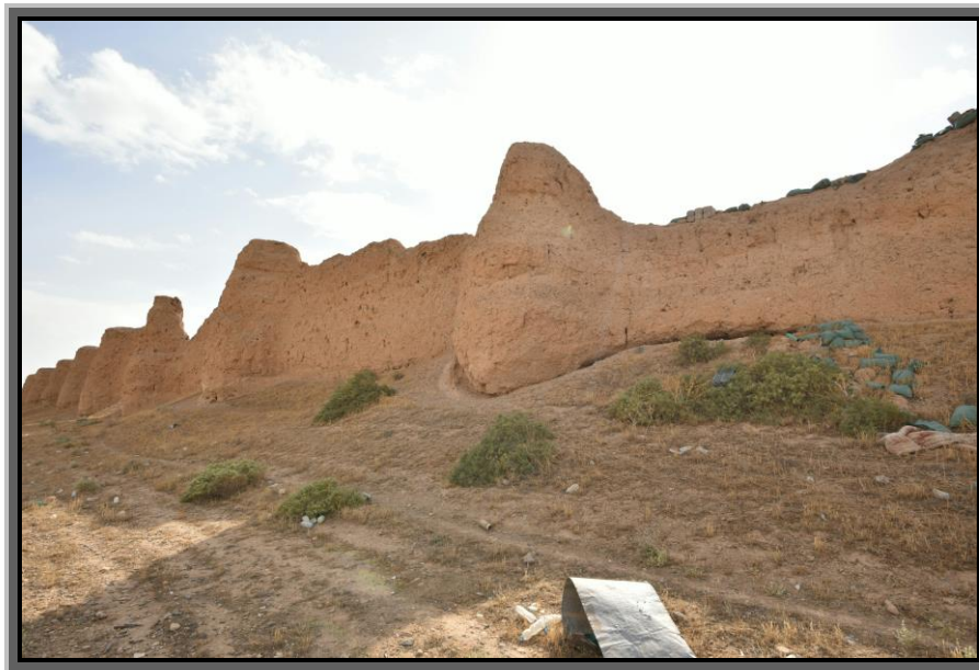
Fig. 4 Sur Ishnas , fortification on it.

Due to the large space of the site and the difficulty of doing a central assessment however ,department of antiquities of Samarra ,documented the affected monuments as Samarra, became the first line of defense to Iraqi forces confronted the terrorist forces of the Islamic State (ISIS) when occupied Salahuddin province , however the damages diagnosed as follow;