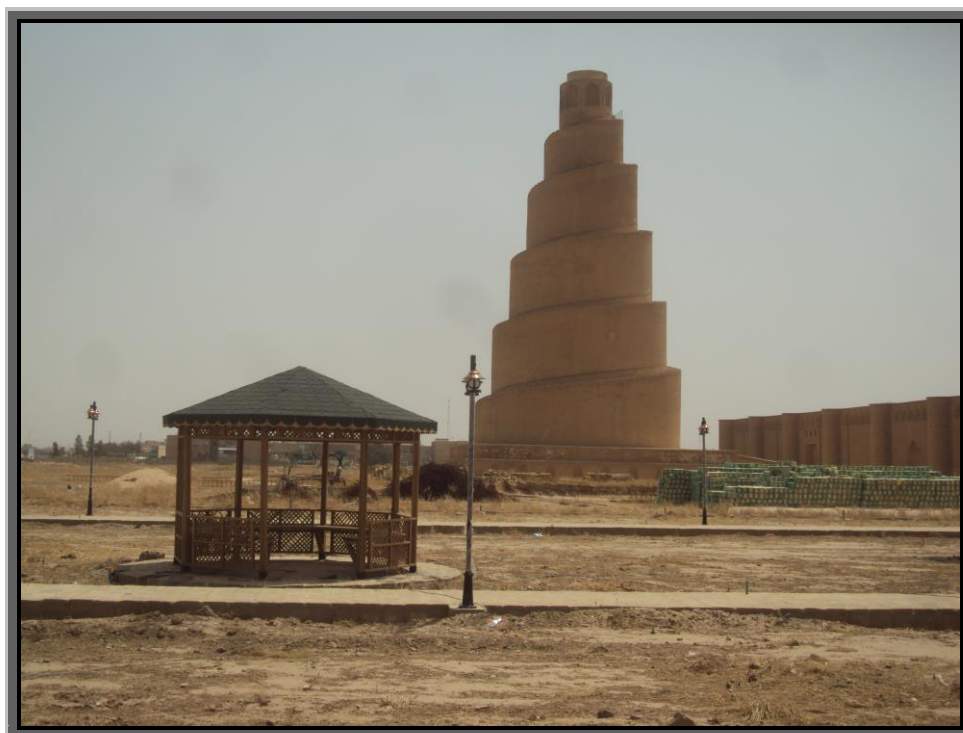
Fig.6 Great Mosque ,side of green areas ,completely removed.

committee has recommended the establishment of the infrastructure for archaeological city of Samarra and some corrective procedures in the field of protection and management , so the choice and start working in the great mosque in 2013 but the military operations and clashes with terrorist forces of Islamic state (ISIS) have removed everything that has been done on site.