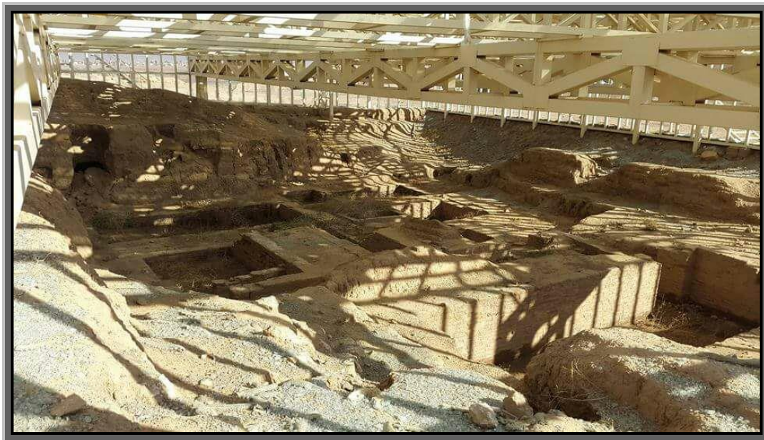
Fig. 3 Royal Cemetery of Ashur, after two year of occupation by Islamic State Troop.

And with all these and in spite of the fragile security situation in the newly liberated areas, the state board of antiquities and heritage (SBAH) had sent some teams to the provinces of Anbar, Salah Uddin and Nineveh to assess the damage and begin preventive preservation to stop factors of collapse.