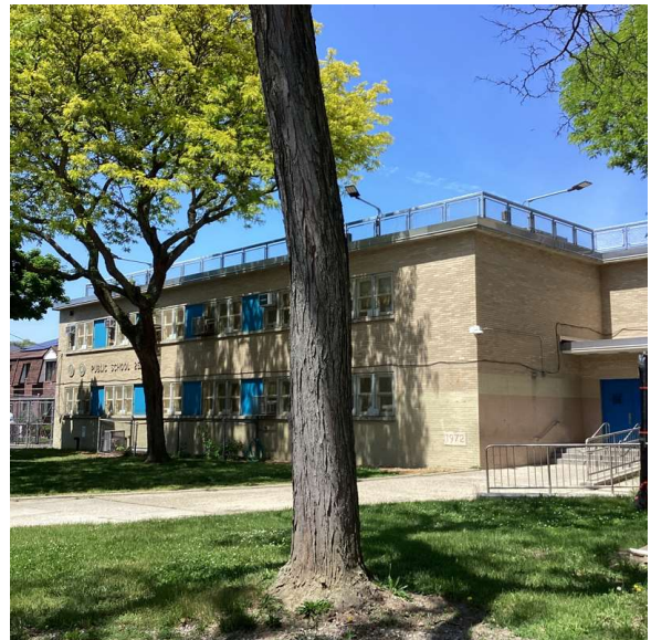
Arthur Street - North view