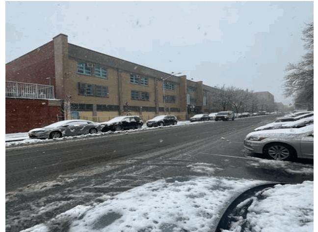
West 112th Street - West View