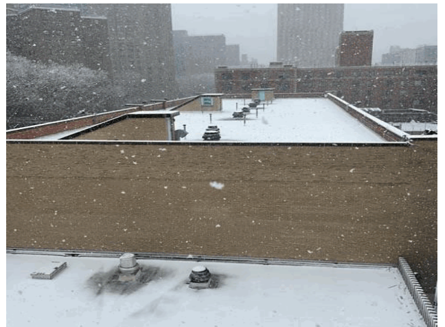
Roof 3 - East View

Do Stormwater Management/Green Infrastructure systems exist?