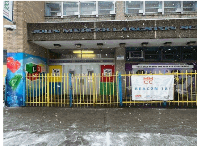
Facade C - West 112th Street