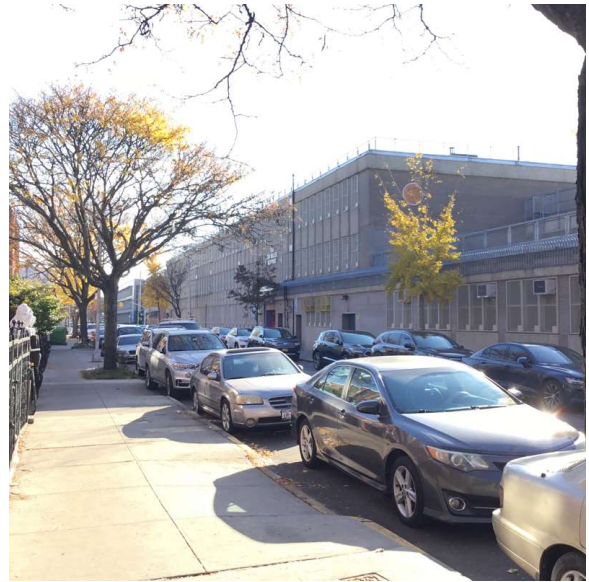
Chester Street - Southwest View