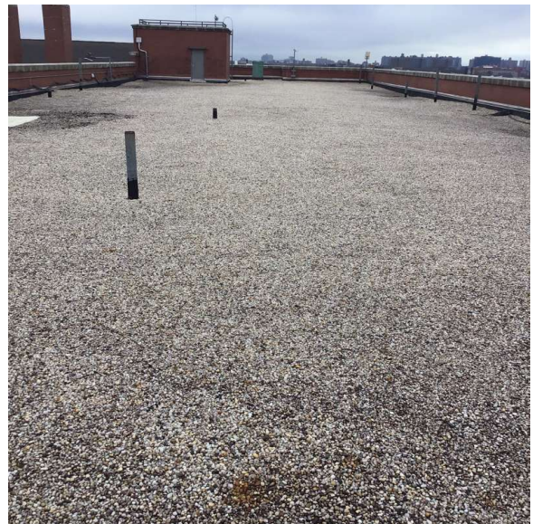
Roof 6 - Southeast View

Have any Systems/Major Building Components been upgraded?