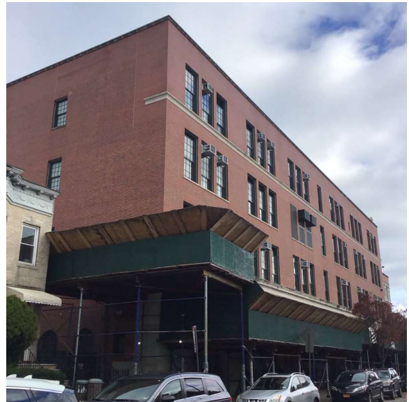
84th Street - East View

Custodian Robert Kralick Fireman Raul Cedeno Facade Photo