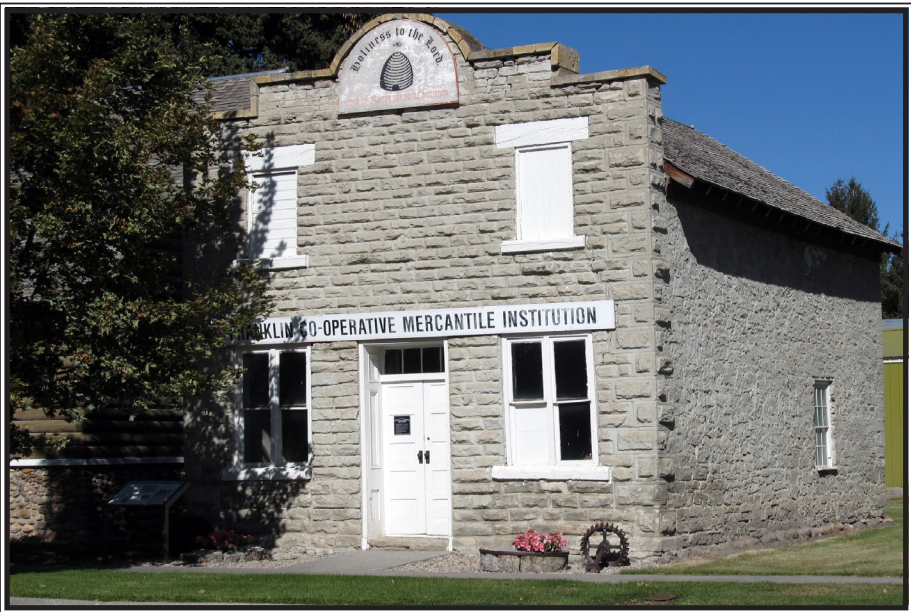
Franklin Cooperative Mercantile Institution