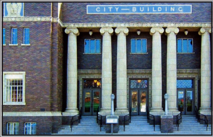
Idaho Falls City Building