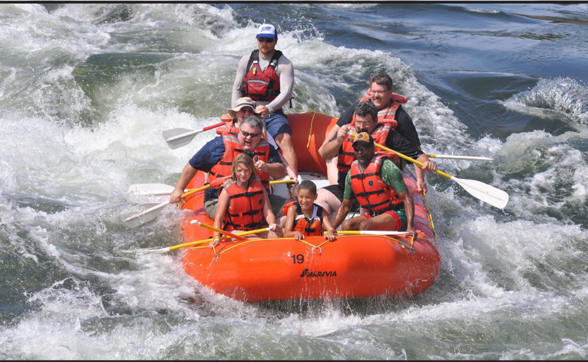
Rafting on the Payette