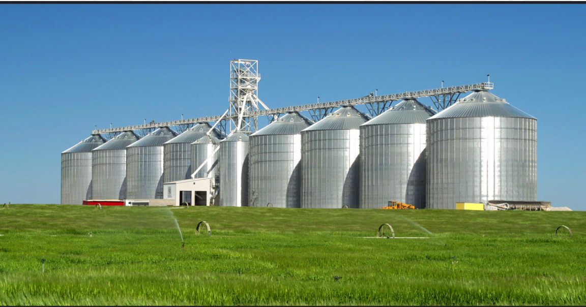
Agriculture near Hazelton