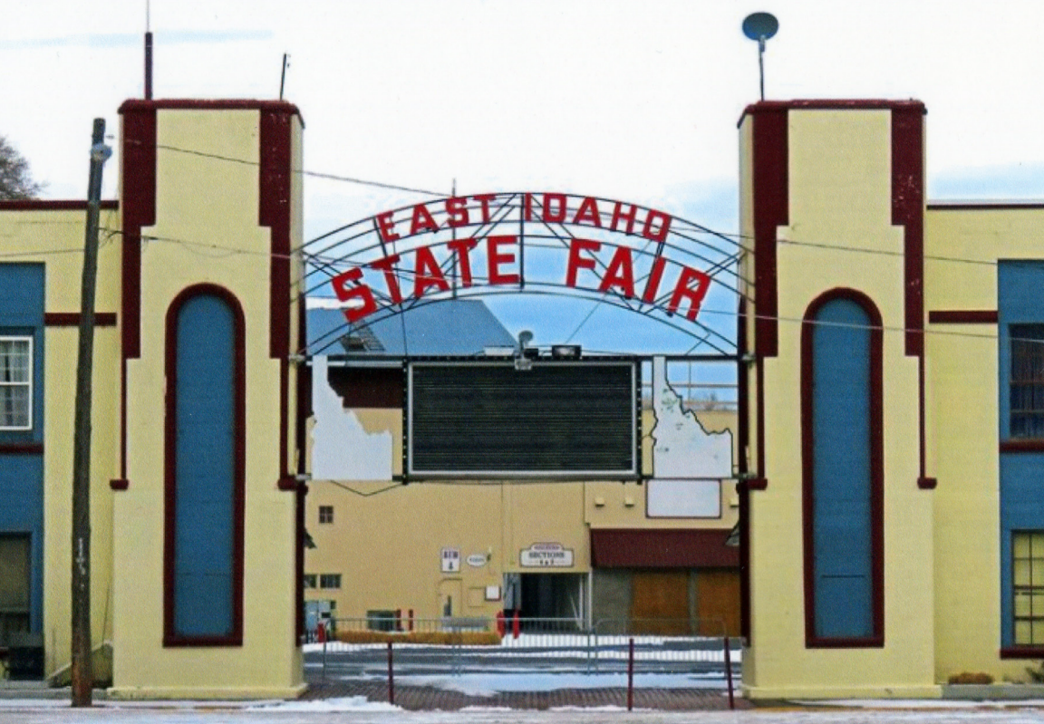
Eastern Idaho Fairgrounds