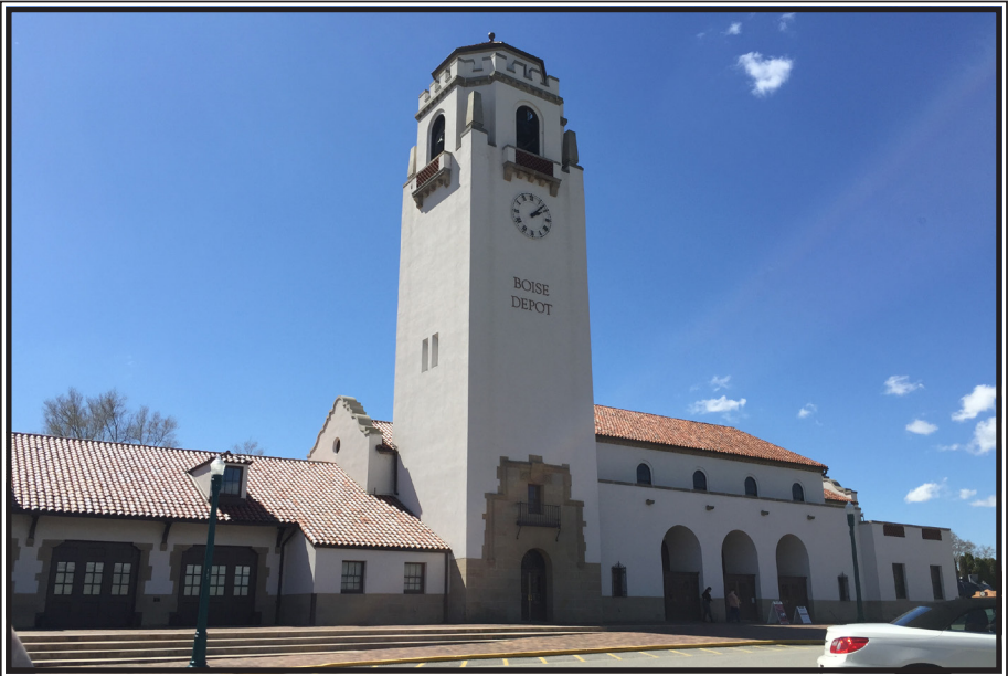
Union Pacific Mainline Depot