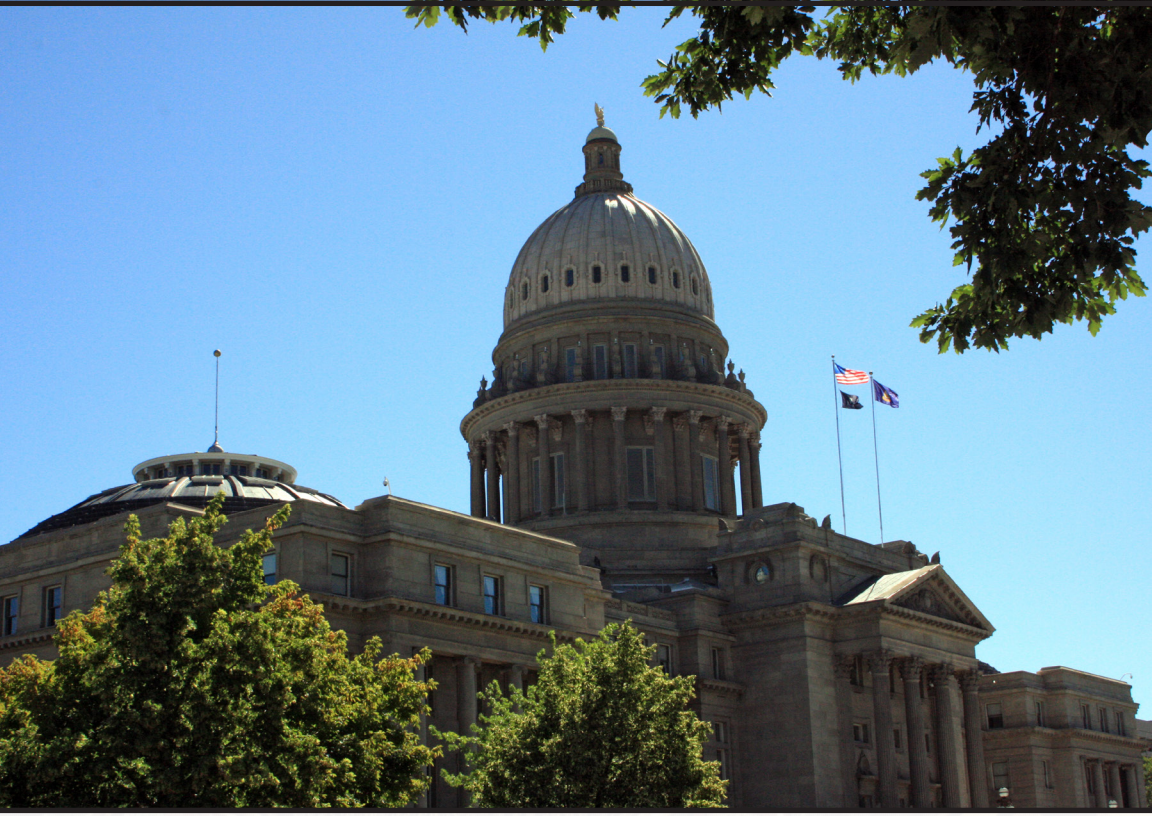
Idaho Capitol Building