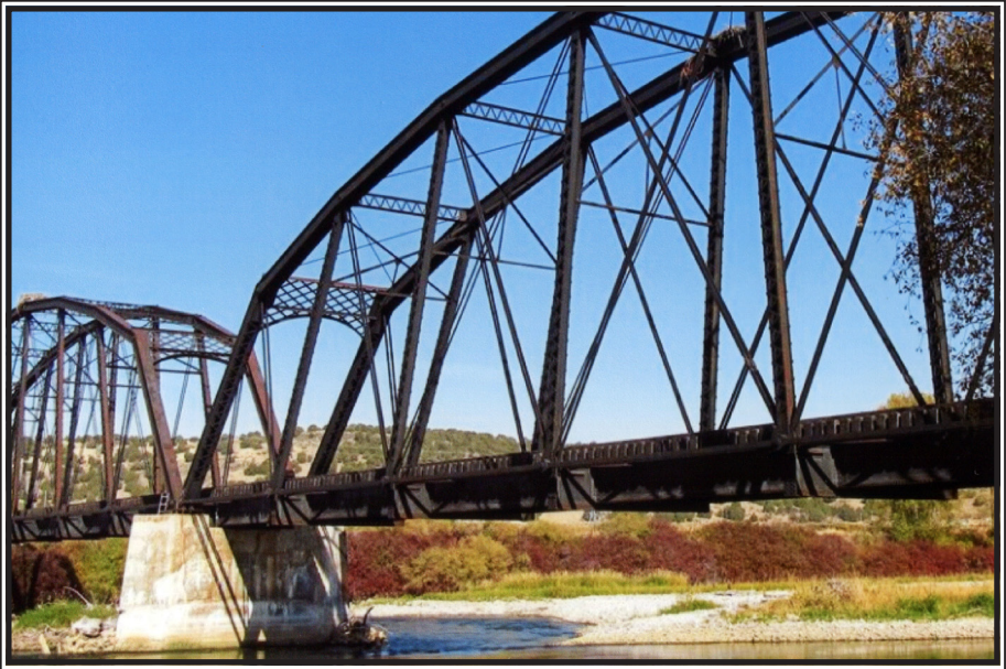
Ririe Pegram Truss Railroad Bridge