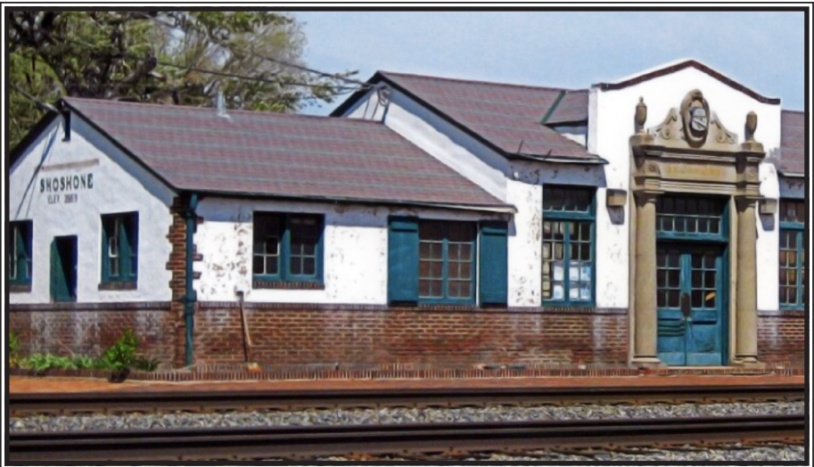
Shoshone Union Pacific Depot