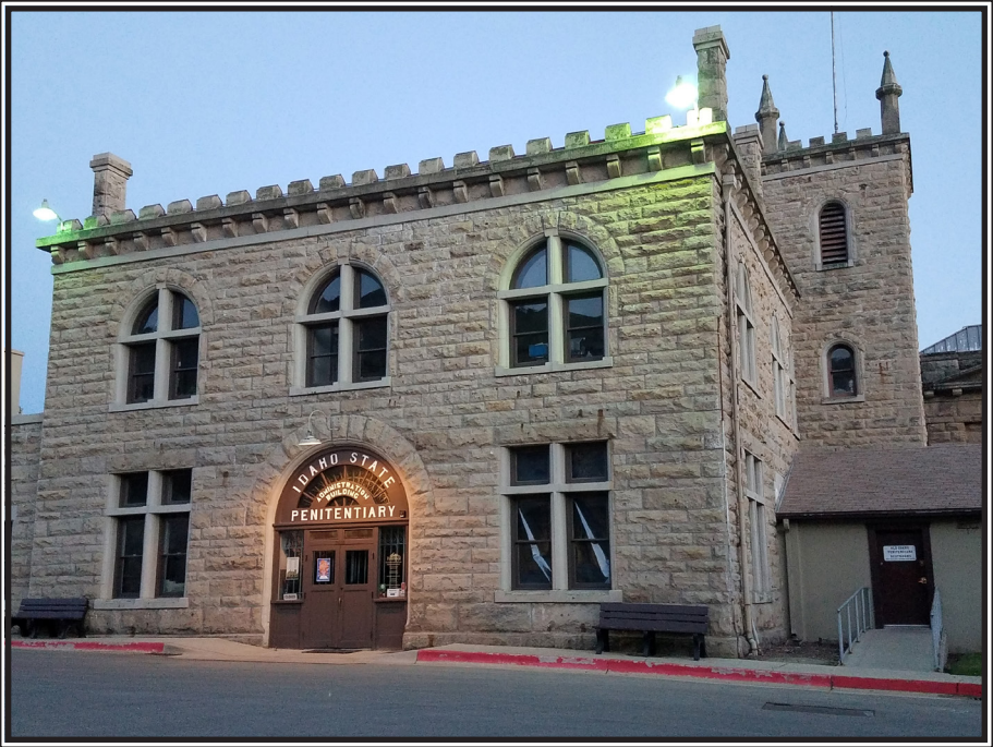
Old Idaho State Penitentiary