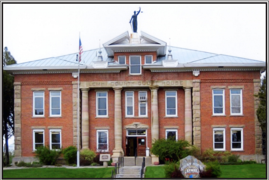
Lemhi County Courthouse