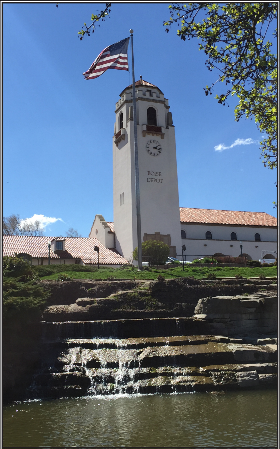
Union Pacific Mainline Depot