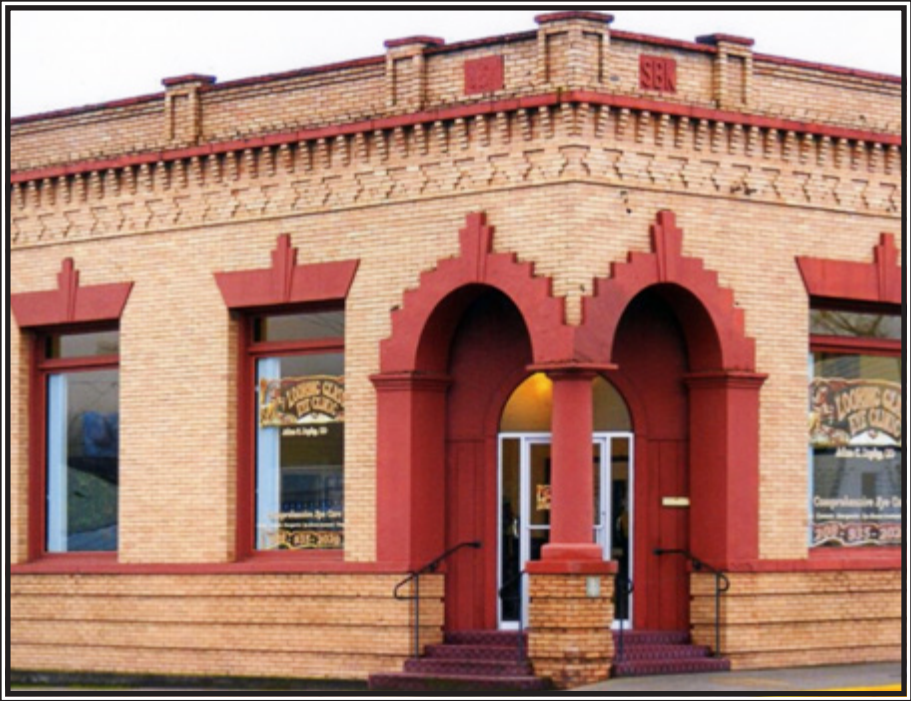
State Bank of Kamiah