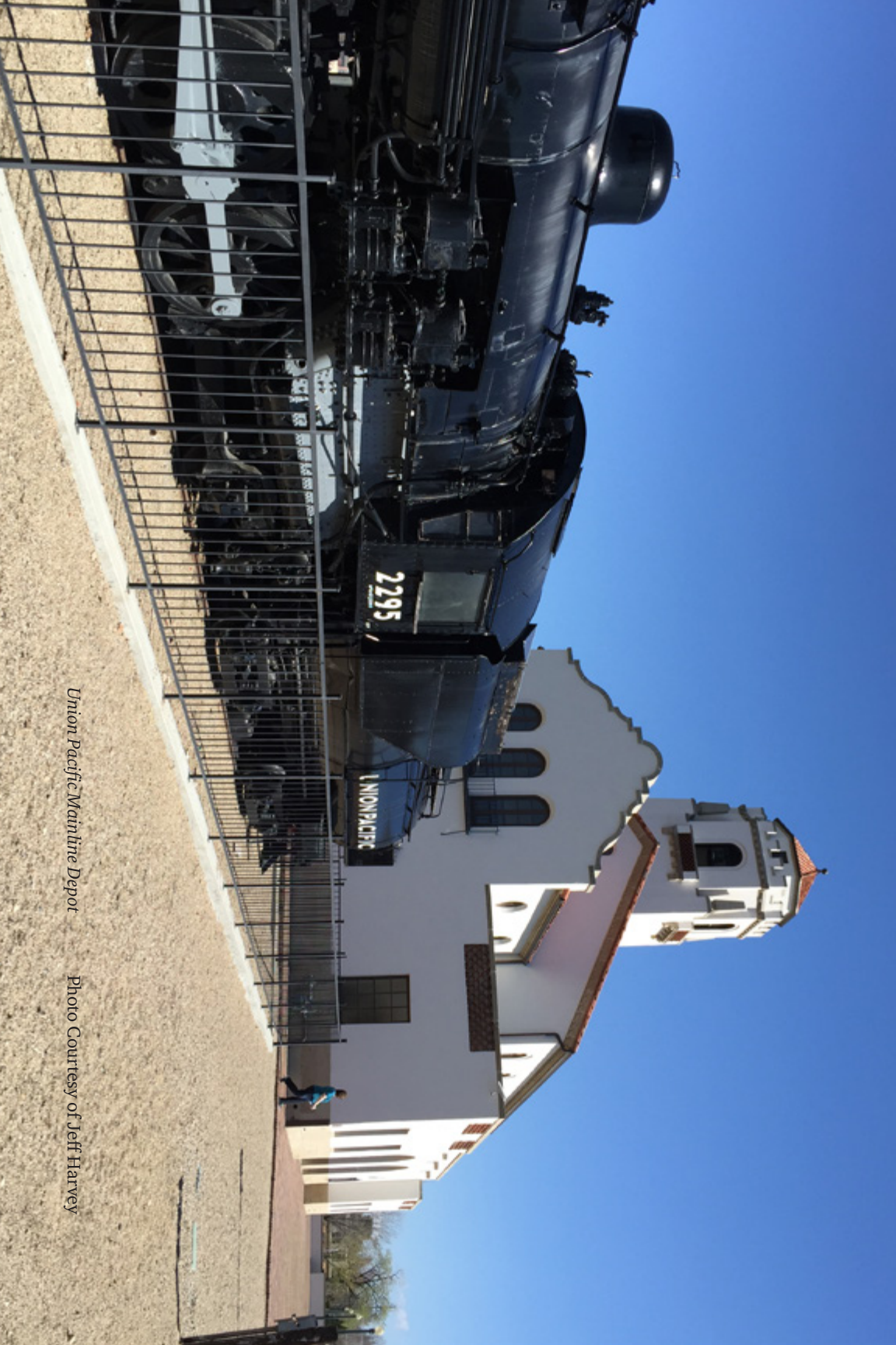
Union Pacific Maritime Depot