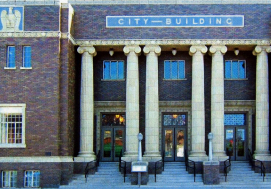
Idaho Falls City Building