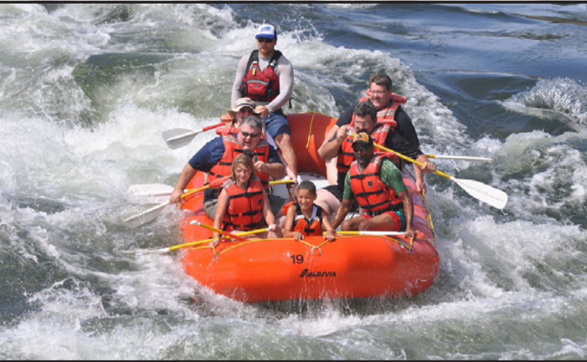
Rafting on the Payette