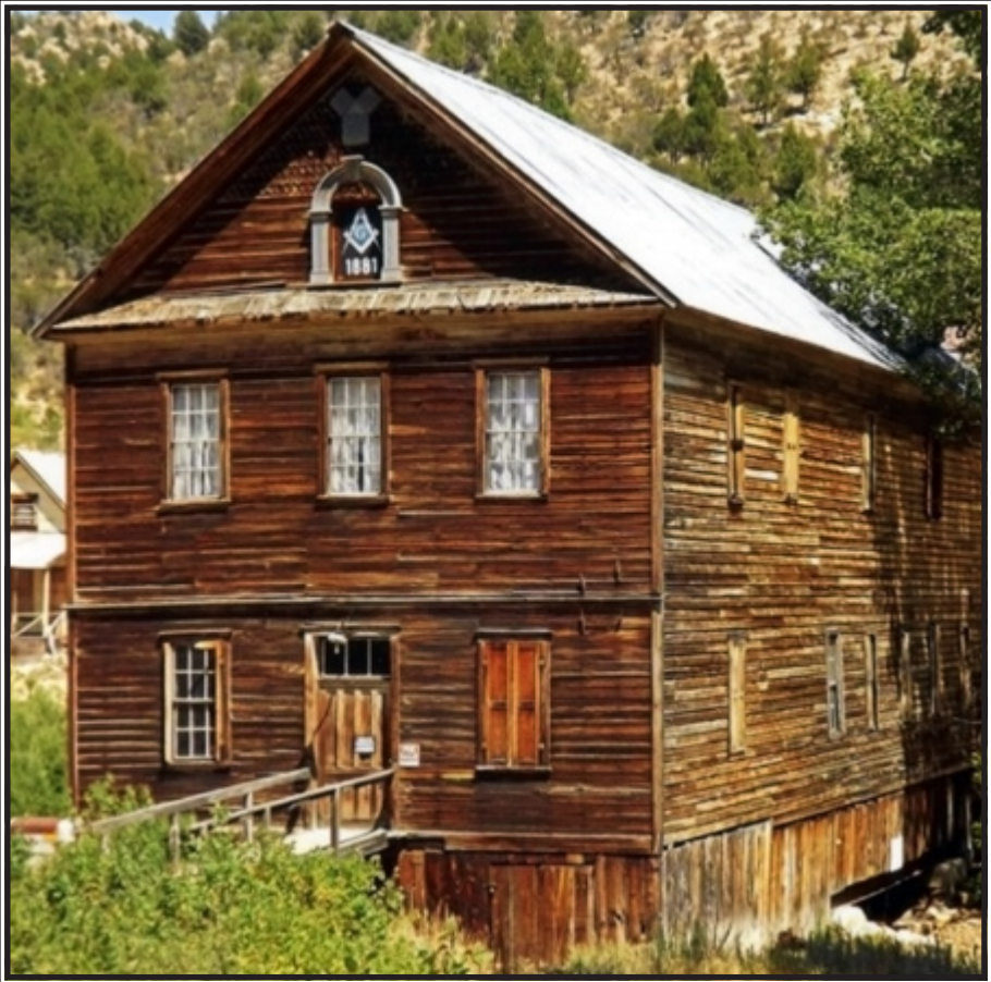
Silver City Masonic Temple