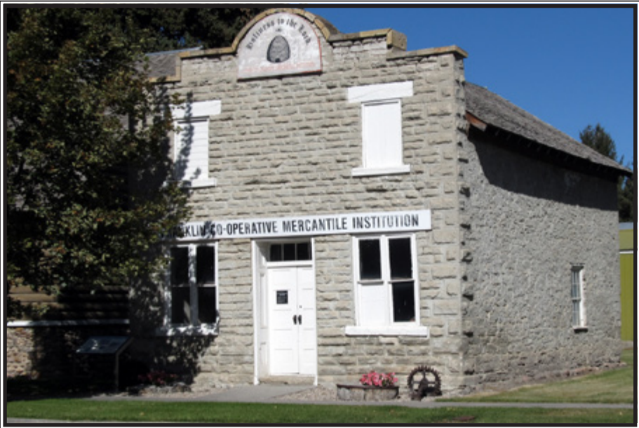
Franklin Cooperative Mercantile Institution