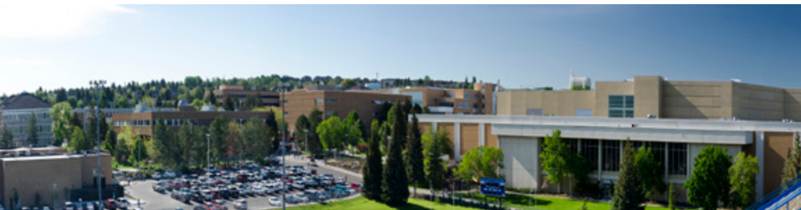
Brigham Young University – Idaho

In June 2000 leaders of The Church of Jesus Christ of Latter-day Saints announced Ricks College would transition from a two-year college to a four-year university. Academic programs were evaluated and restructured, and the school officially became Brigham Young University-Idaho in August 2001. The university is accredited by the Northwest Commission on Colleges and Universities.