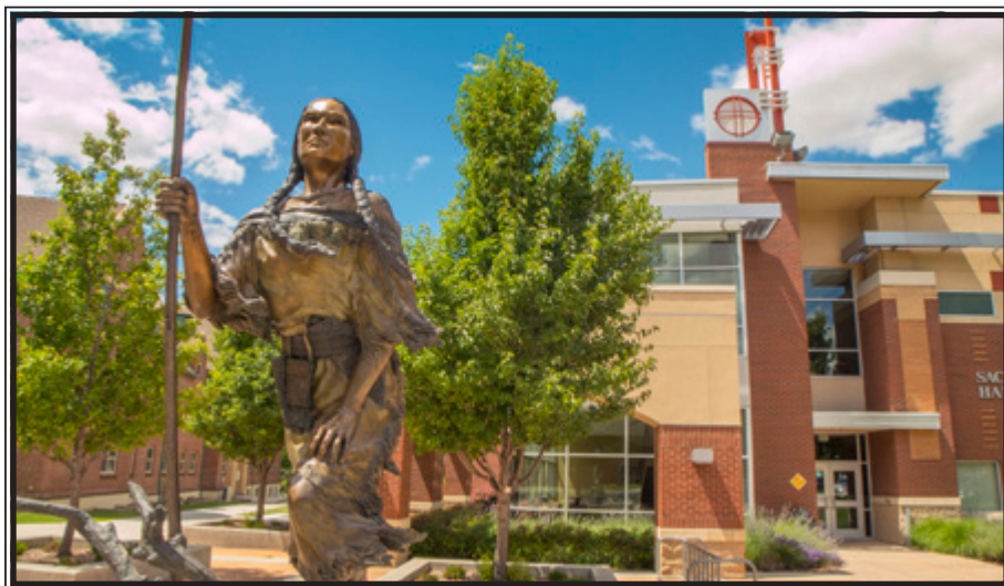
Lewis-Clark State College

Degrees: Baccalaureate, Associate, Certificate of Completion