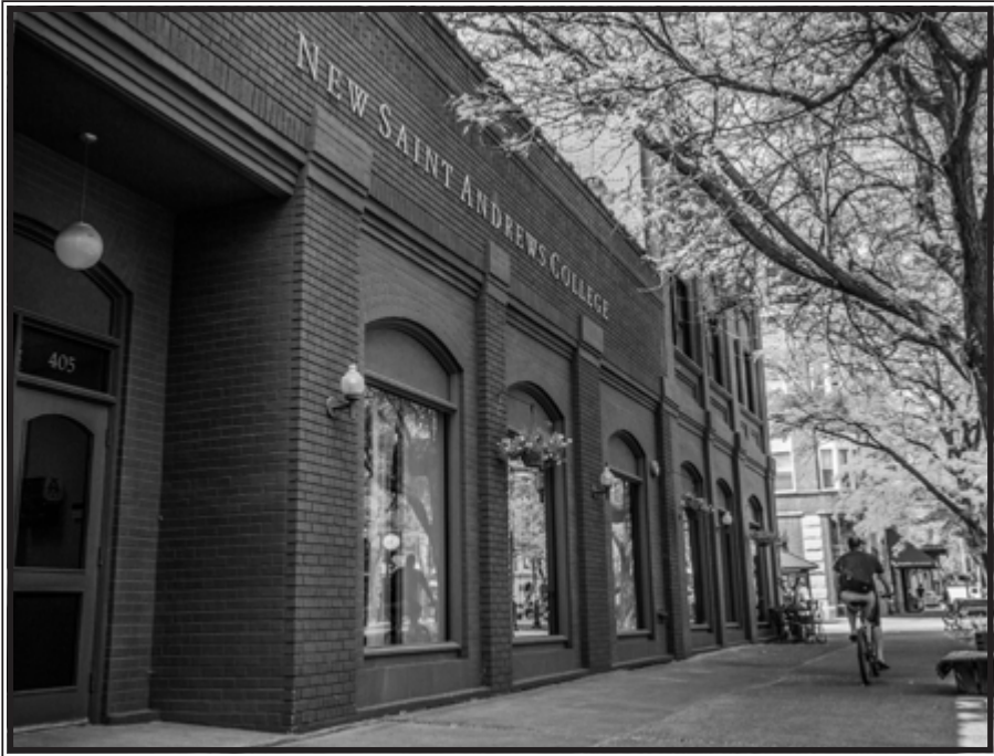
New Saint Andrews College