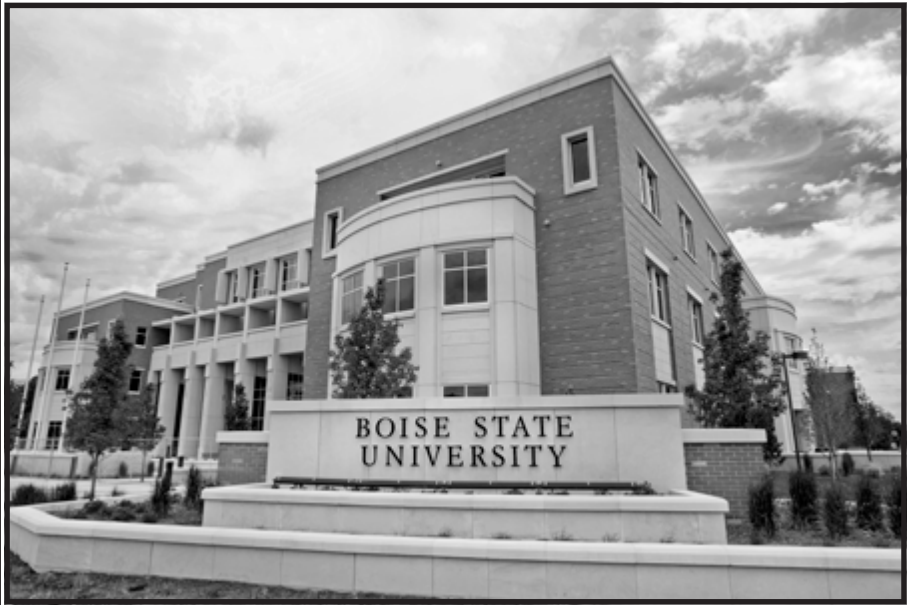
Boise State University

Degrees: 11 doctorate, 66 master's, 91 undergraduate, 29 graduate certificate