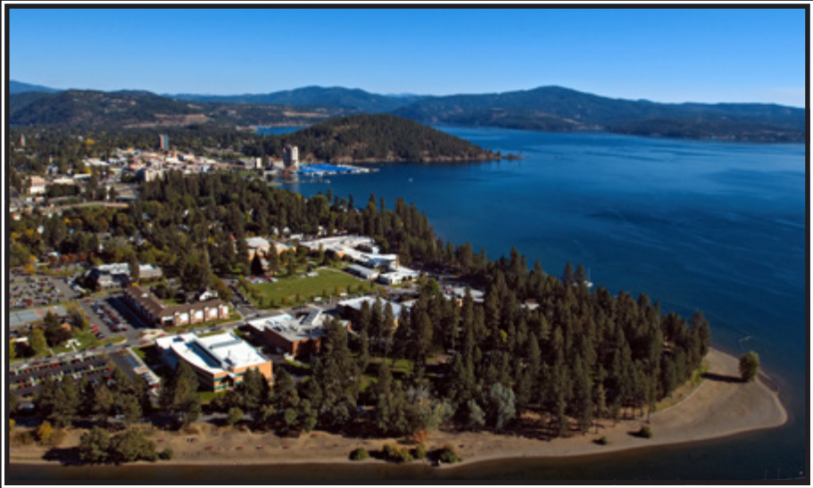
North Idaho College

Degrees: Associate's degrees; associate of applied science degrees, certificates