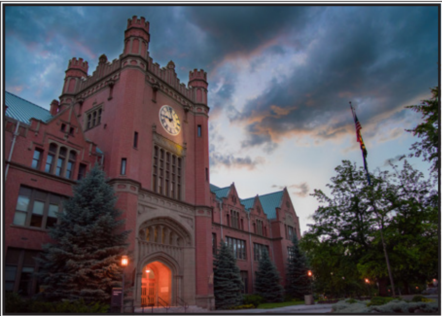
University of Idaho

Degrees: Bachelor's, master's, doctoral, law and specialist