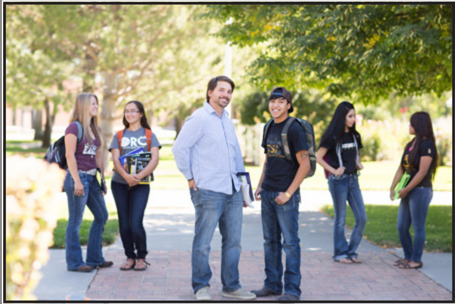
College of Southern Idaho