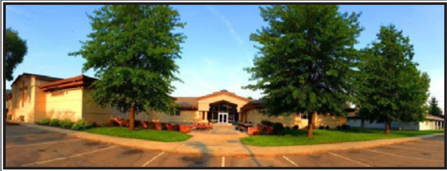
Boise Bible College

Degrees: Bachelor of Arts, Bachelor of Science, Associate of Science