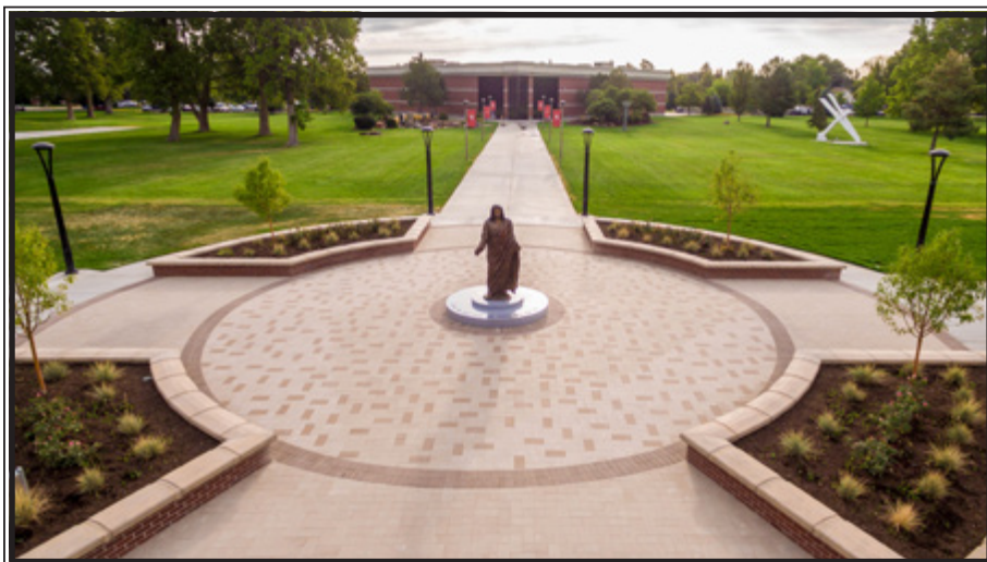
Northwest Nazarene University

Degrees: Associate of Arts, Bachelor of Arts, Bachelor of Science, Education Specialist, Master's programs in business, counseling, education, nursing, religion and social work, and Doctoral programs in education