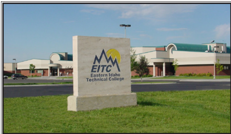
East Idaho Technical College

Idaho Falls, ID 83404 (208) 524-3000 www.eitc.edu