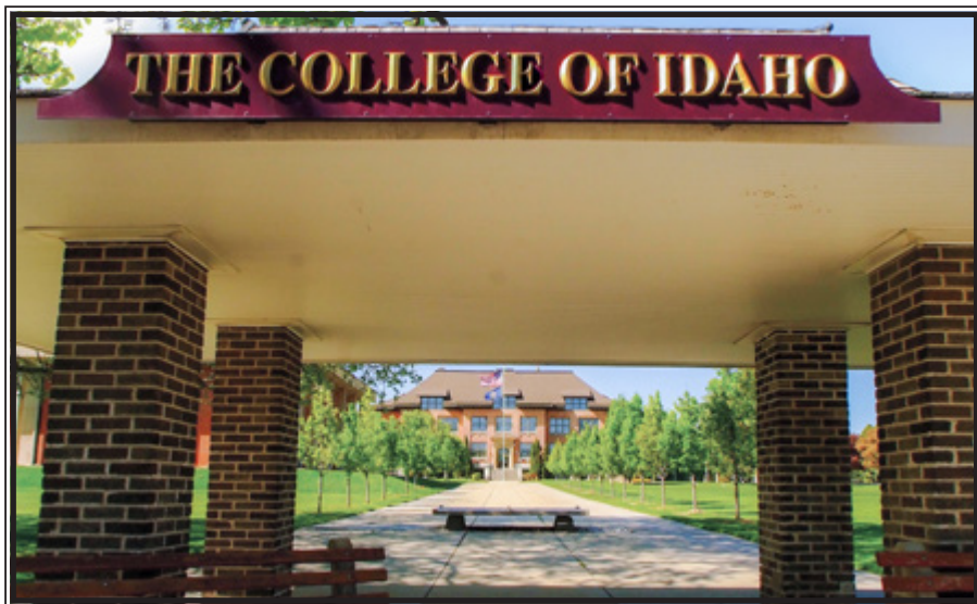
The College of Idaho

Degrees: Bachelor of Arts, Bachelor of Science, Master of Education