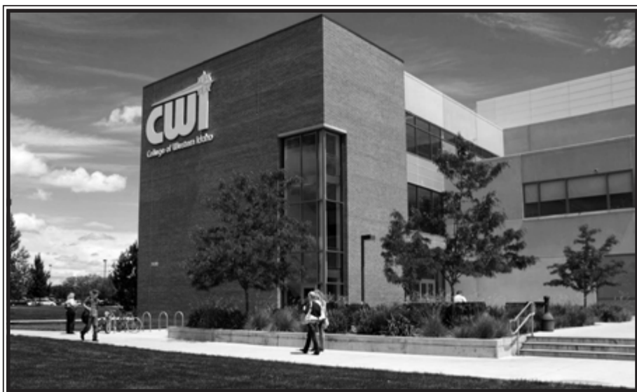
College of Western Idaho