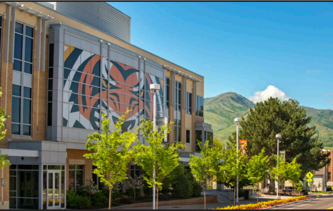
Idaho State University