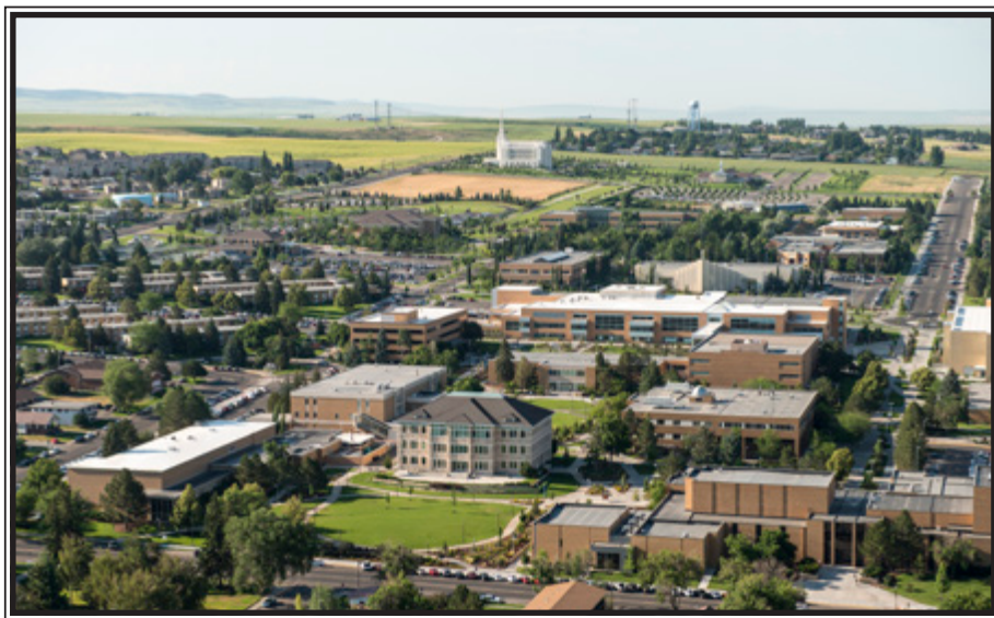
Brigham Young University – Idaho

Degrees: Associate of Arts, Associate of Science, Associate of Applied Science, Bachelor of Arts, Bachelor of Fine Arts, Bachelor of Science