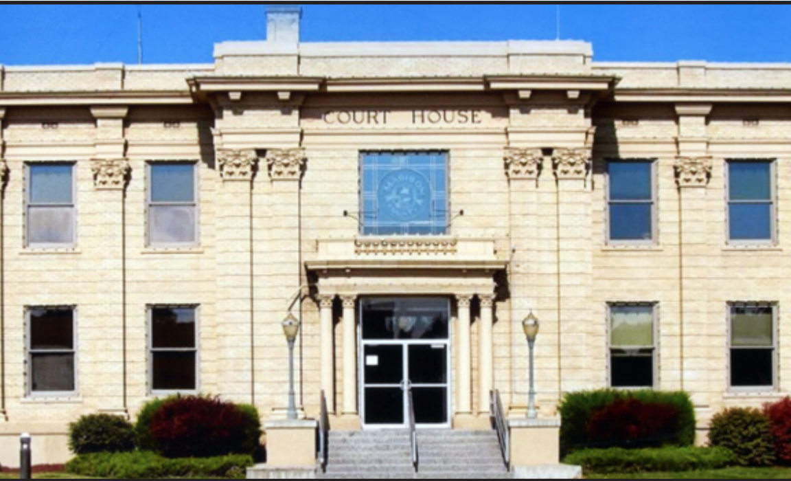
Madison County Courthouse