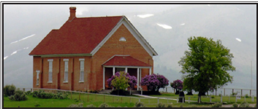
Chesterfield Meeting House