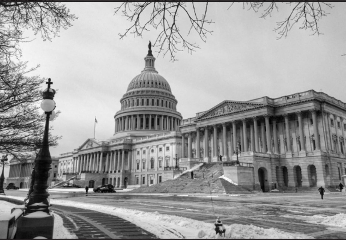
US Capitol Building