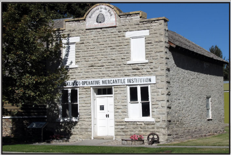
Franklin Cooperative Mercantile Institution