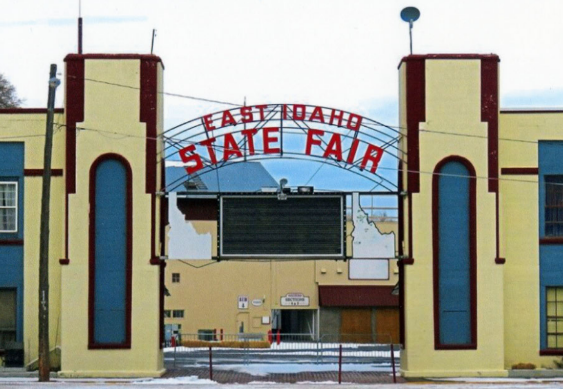
Eastern Idaho Fairgrounds