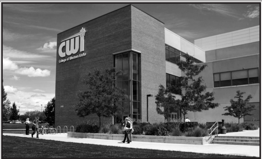
College of Western Idaho