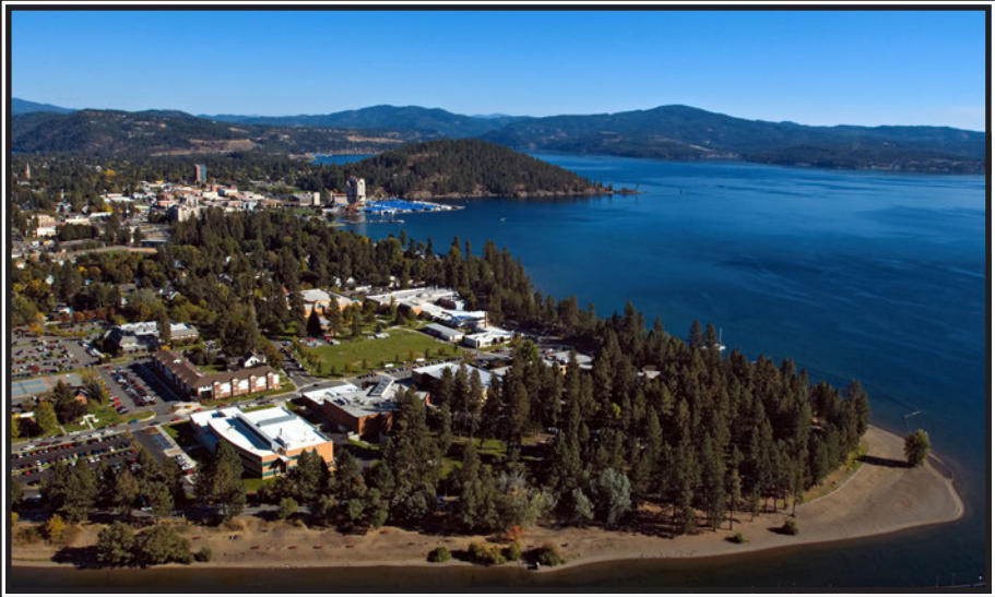
North Idaho College

Degrees: Associate's degrees; associate of applied science degrees, certificates