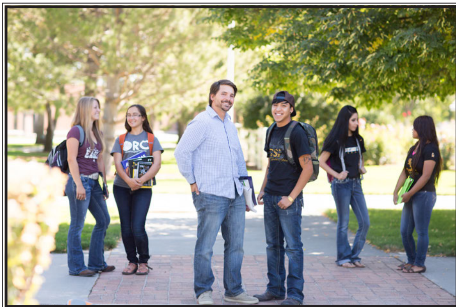
College of Southern Idaho