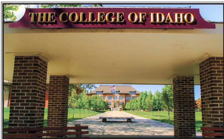
The College of Idaho

Degrees: Bachelor of Arts, Bachelor of Science, Master of Education