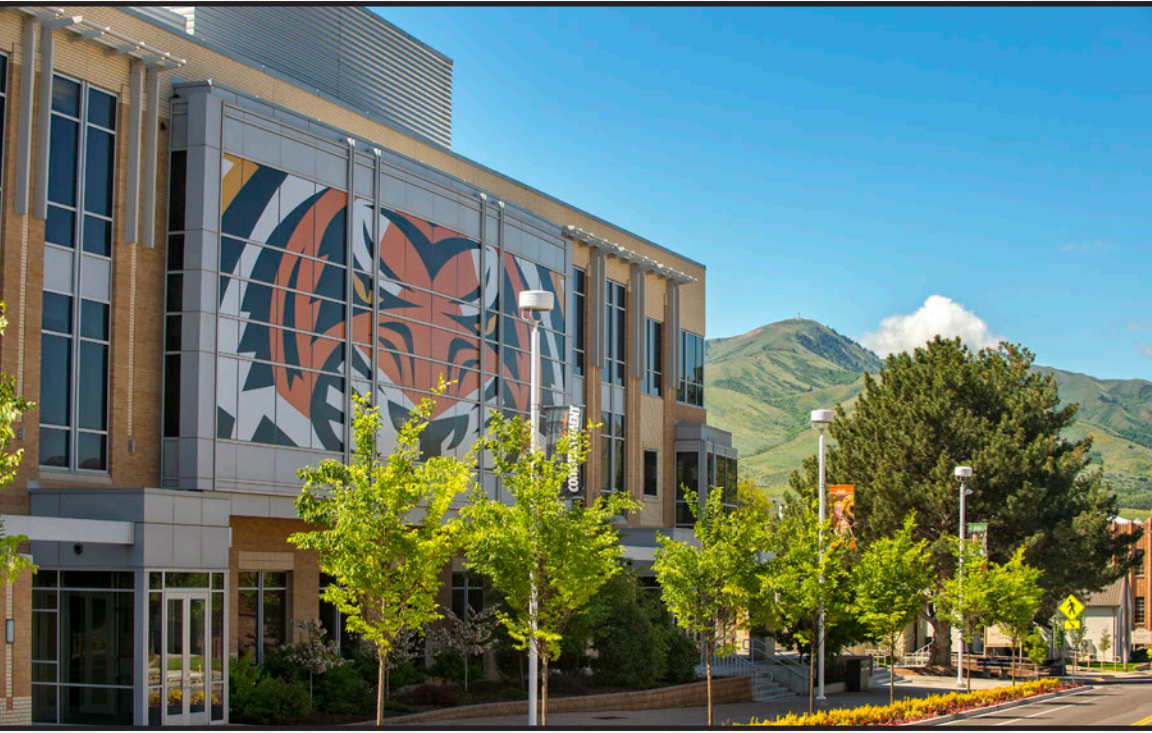
Idaho State University