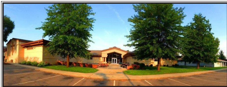
Boise Bible College

Degrees: Bachelor of Arts, Bachelor of Science, Associate of Science