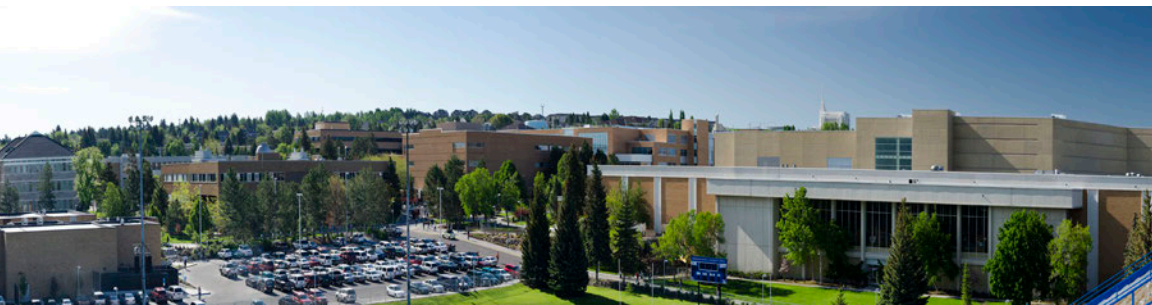
Brigham Young University – Idaho

In June 2000 leaders of The Church of Jesus Christ of Latter-day Saints announced Ricks College would transition from a two-year college to a four-year university. Academic programs were evaluated and restructured, and the school officially became Brigham Young University-Idaho in August 2001. The university is accredited by the Northwest Commission on Colleges and Universities.