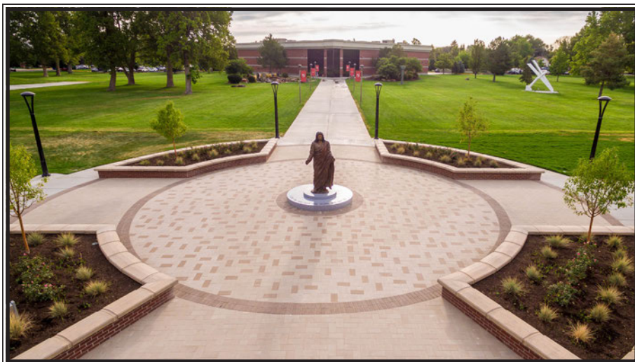
Northwest Nazarene University

Degrees: Associate of Arts, Bachelor of Arts, Bachelor of Science, Education Specialist, Master's programs in business, counseling, education, nursing, religion and social work, and Doctoral programs in education