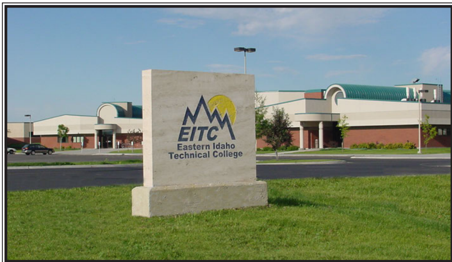
East Idaho Technical College

Idaho Falls, ID 83404 (208) 524-3000 www.eitc.edu