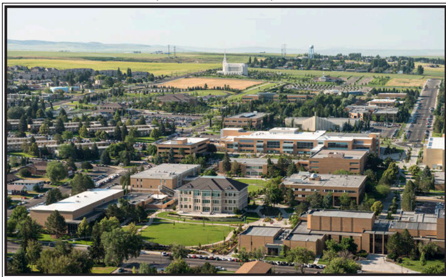
Brigham Young University – Idaho

Degrees: Associate of Arts, Associate of Science, Associate of Applied Science, Bachelor of Arts, Bachelor of Fine Arts, Bachelor of Science