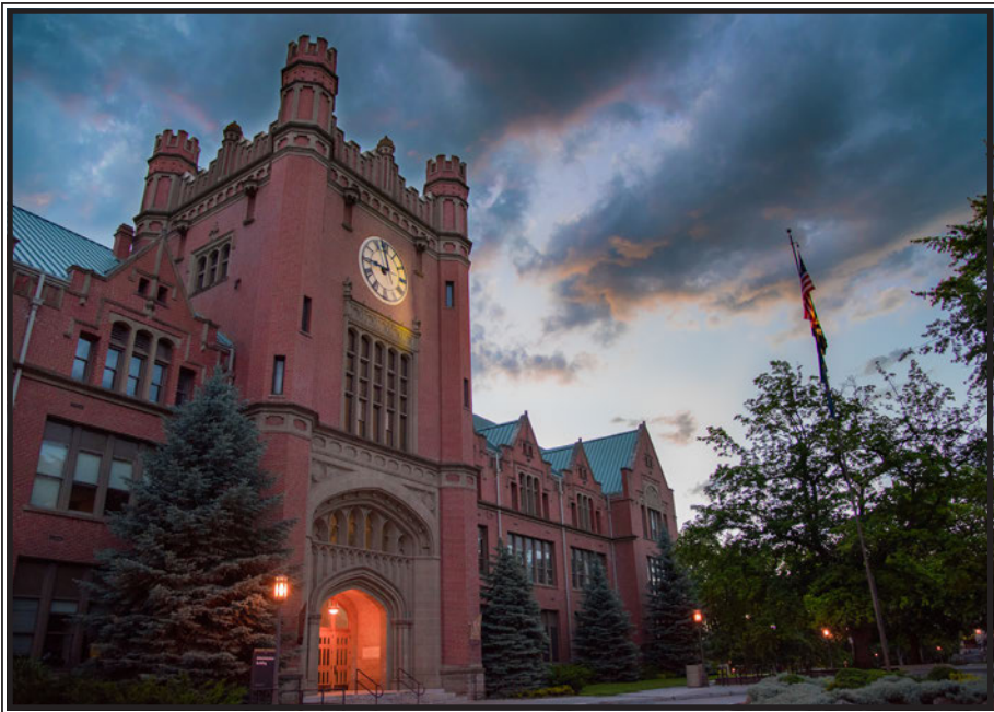
University of Idaho

Degrees: Bachelor's, master's, doctoral, law and specialist