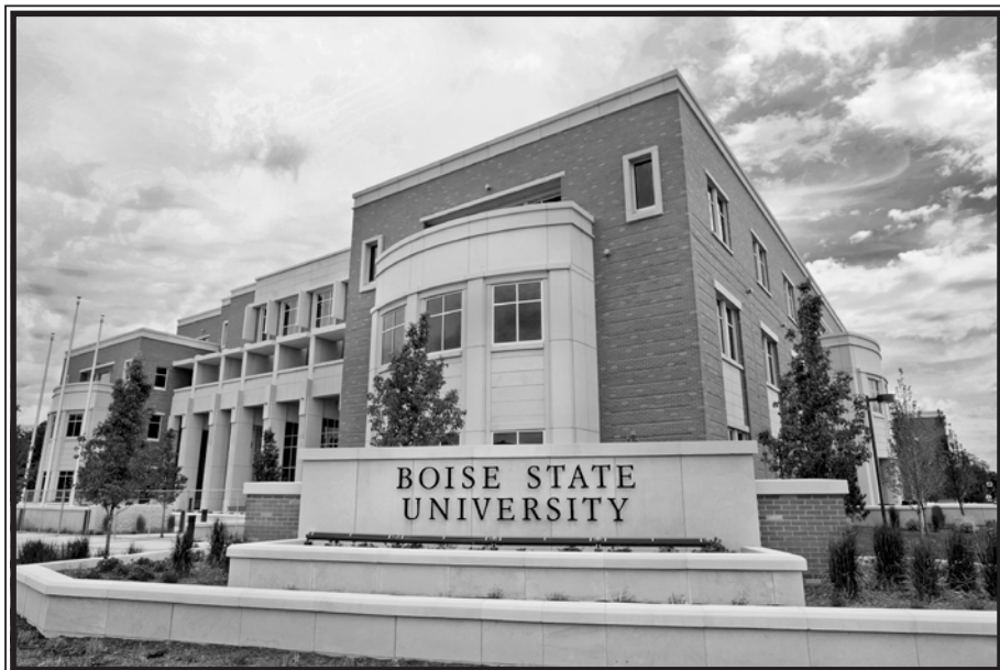
Boise State University

Degrees: 12 doctorate, 64 master's, 84 undergraduate, 21 graduate certificate