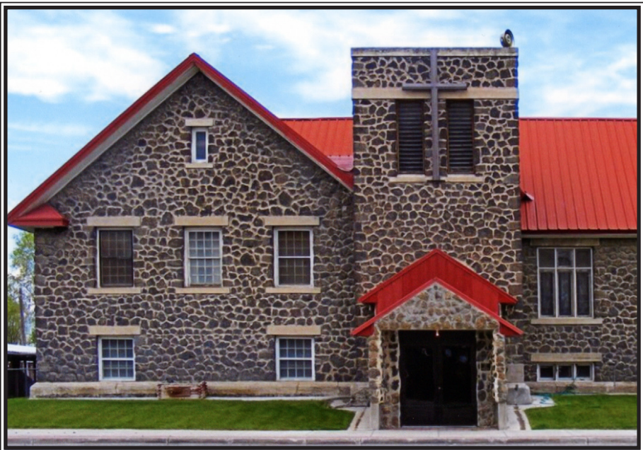
Arco Baptist Community Church