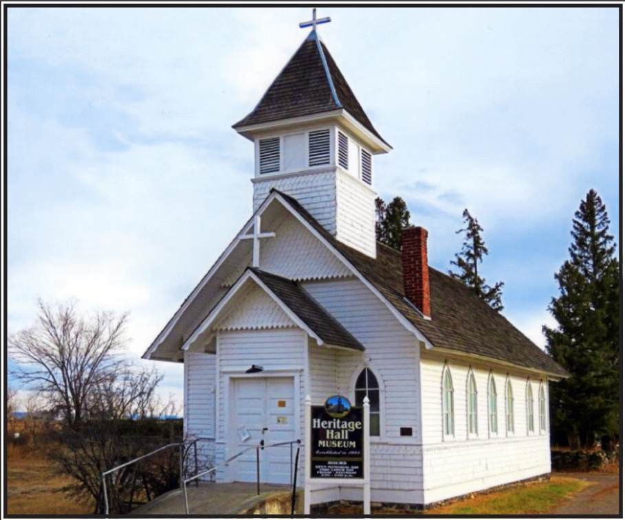
St. James Church