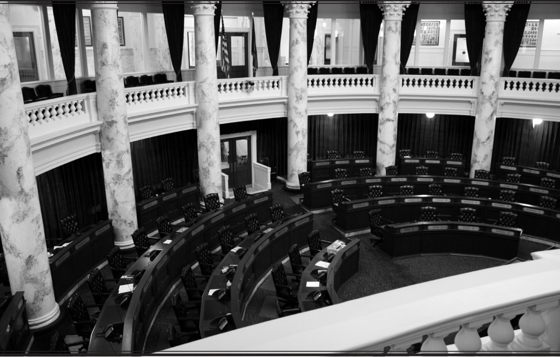
Chamber and 4th Floor Gallery