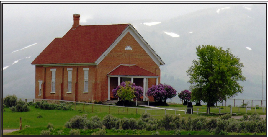
Chesterfield Meeting House