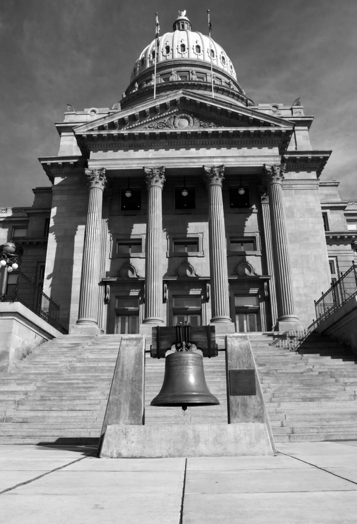
Idaho State Capitol