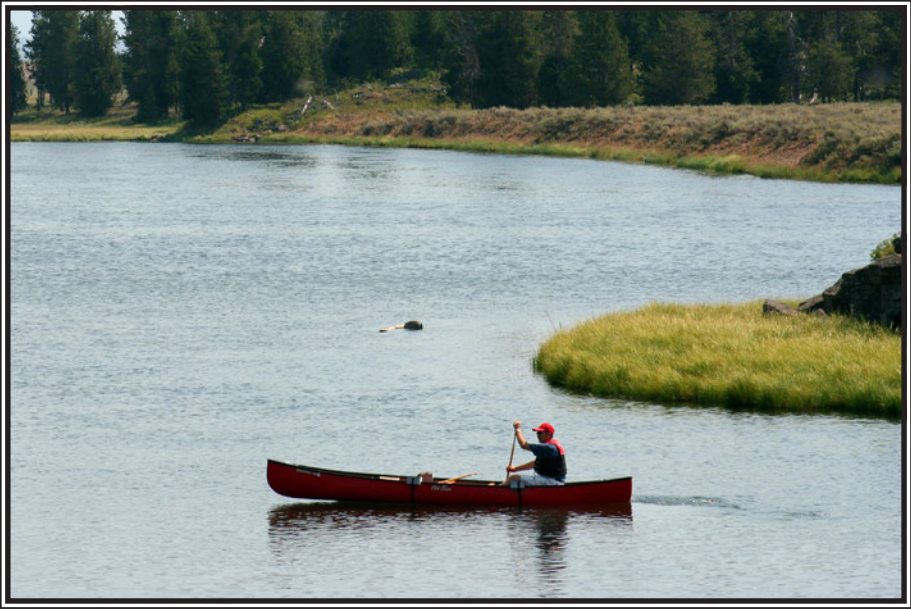
Harriman State Park