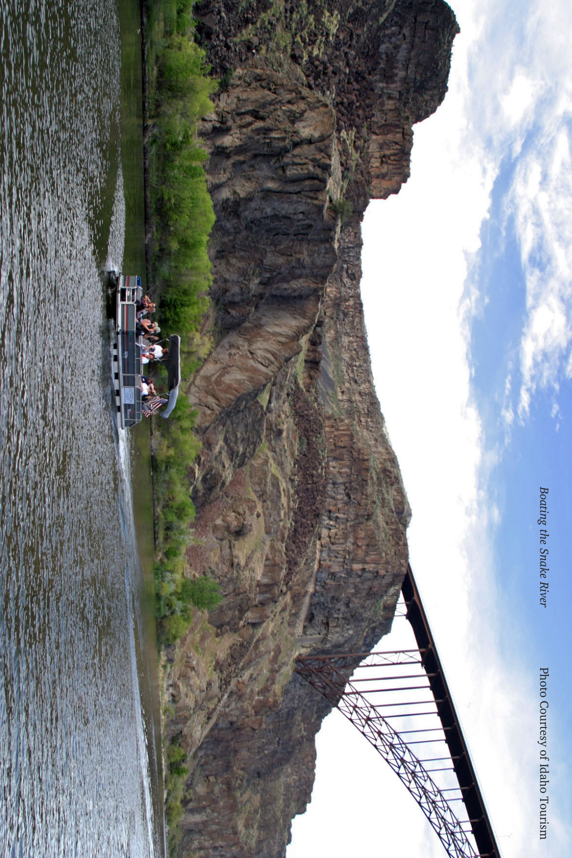
Boating the Snake River