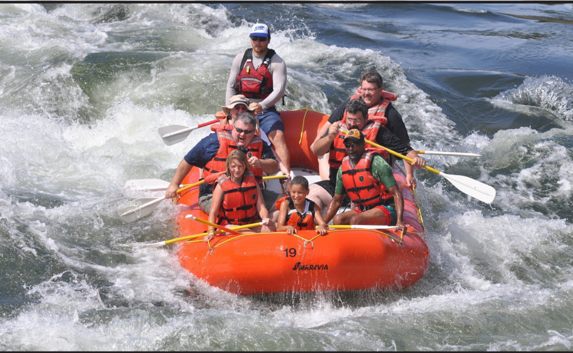
Rafting on the Payette