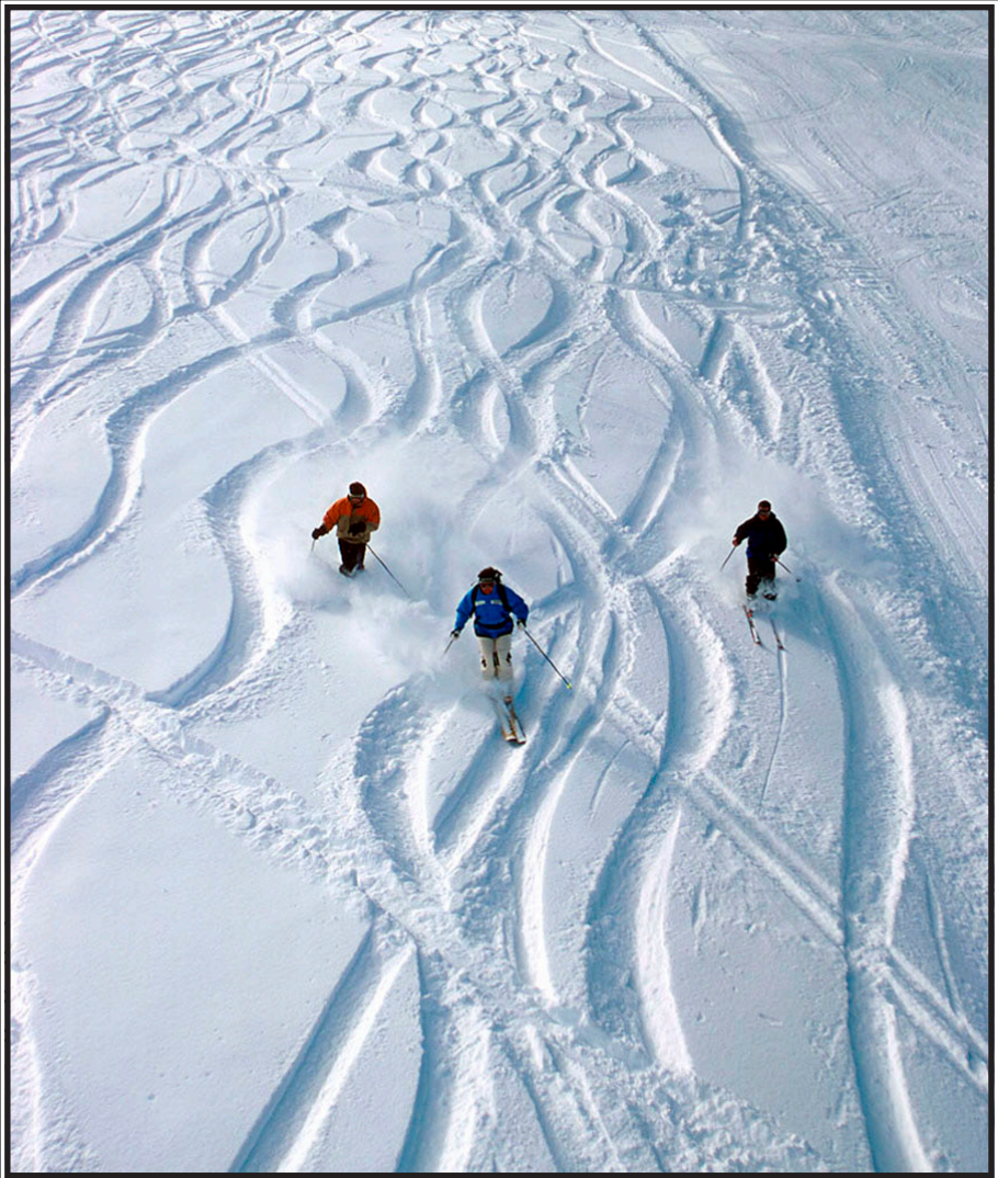
Lookout Pass Ski Area