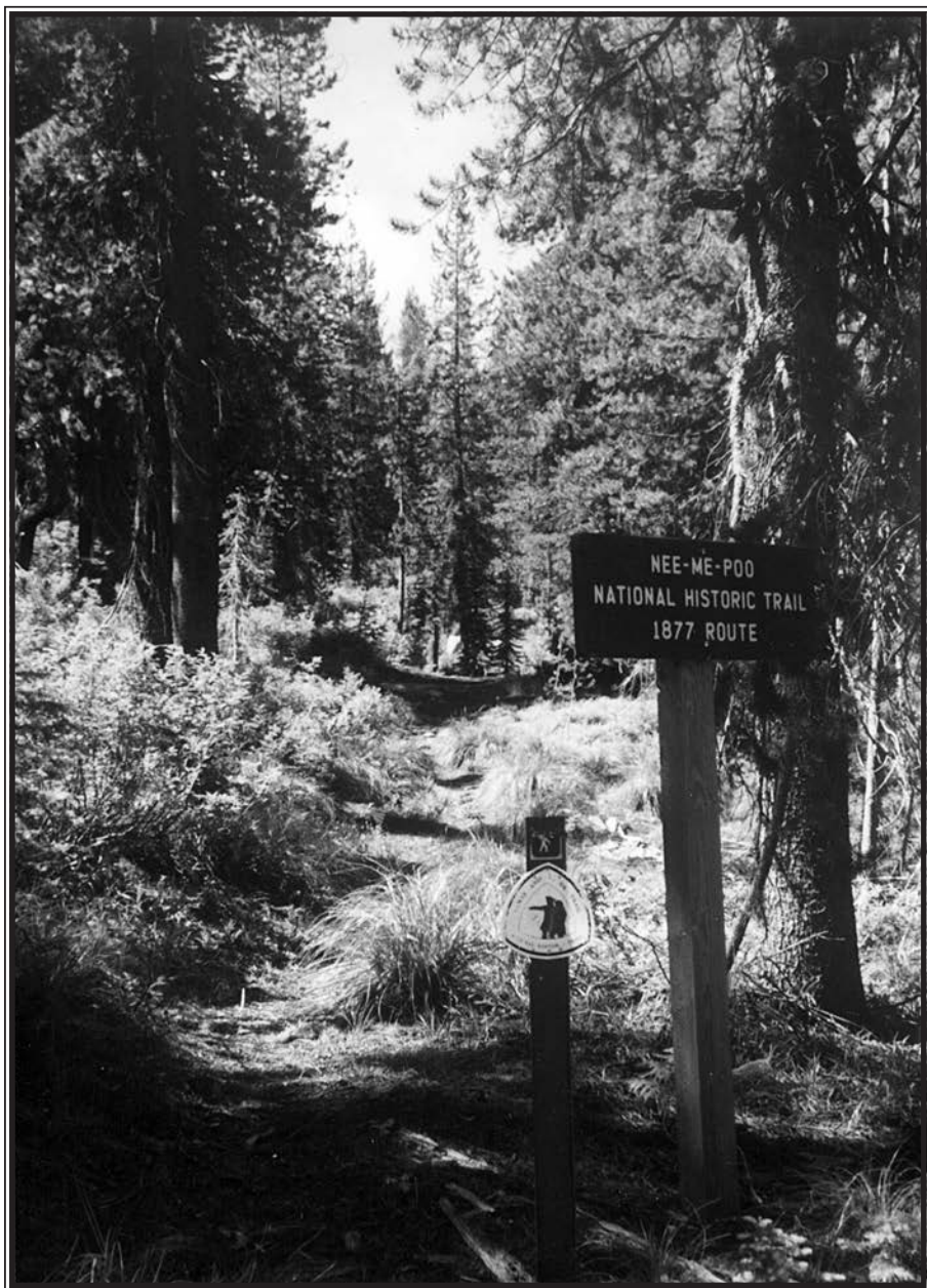
Nee-Mee-Po National Historic Trail in North Central Idaho

The Nez Perce (Nimípuu or Nee-Me-Poo) National Historic Trail stretches from Wallowa Lake, Oregon, to the Bear Paw Battlefield near Chinook, Montana. It was added to the National Trails System by Congress in 1986.