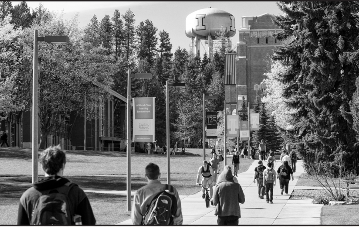
University of Idaho