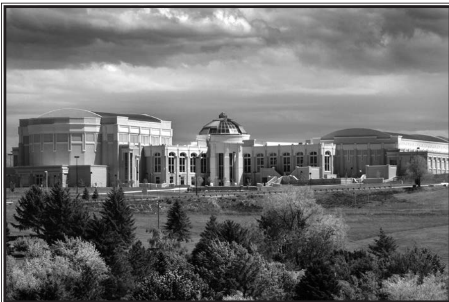
Idaho State University

Degrees: Vocational Certificates, Associate, Baccalaureate, Master's Educational Specialist Certificate, Doctoral