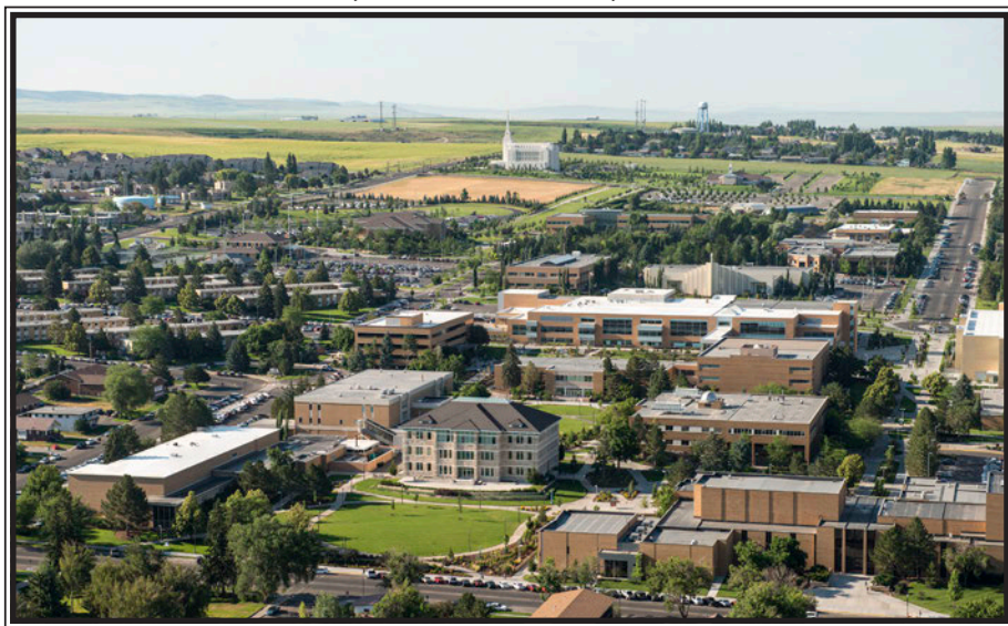
Brigham Young University – Idaho

Degrees: Associate of Arts, Associate of Science, Associate of Applied Science, Bachelor of Arts, Bachelor of Fine Arts, Bachelor of Science