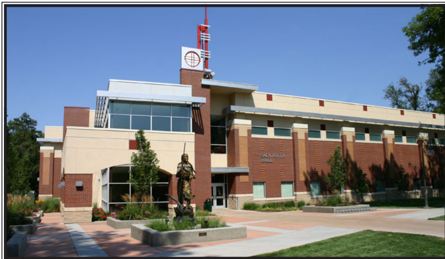
Lewis-Clark State College

Degrees: Baccalaureate, Associate, Certificate of Completion