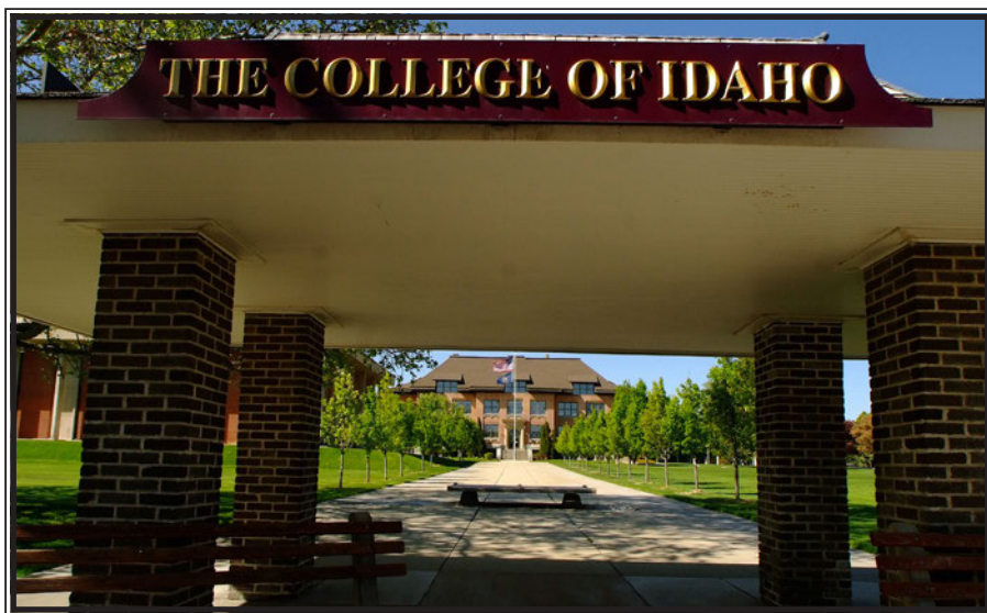
The College of Idaho

Degrees: Bachelor of Arts, Bachelor of Science, Master of Education