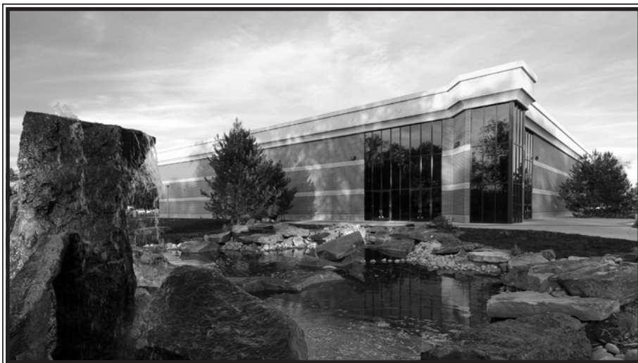
Northwest Nazarene University

Degrees: Bachelor of Arts, Bachelor of Science, Education Specialist, and graduate programs in business, counseling, education, nursing, religion and social work.