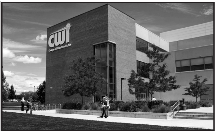
College of Western Idaho