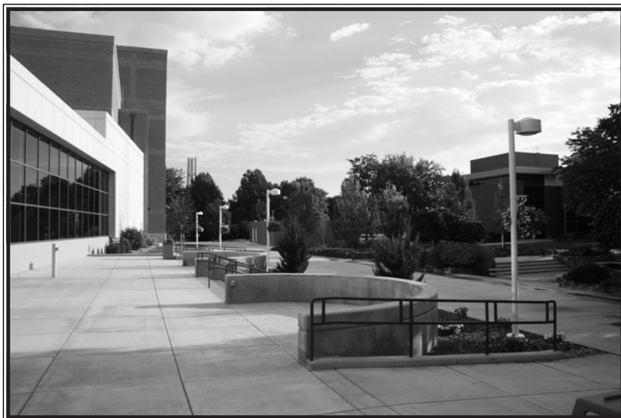
College of Southern Idaho