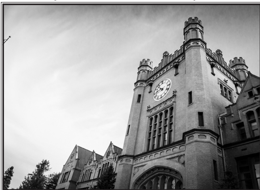
University of Idaho

Degrees: Bachelor's, master's, doctoral, law and specialist