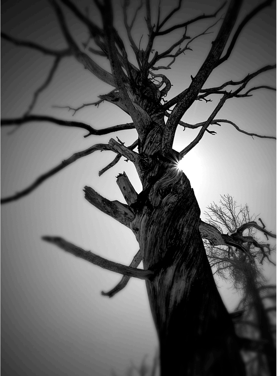
Big Lost Lake

limited taxing powers but are required to certify their requirements to the county commissioners who must include these needs in the collections made by county tax collectors.