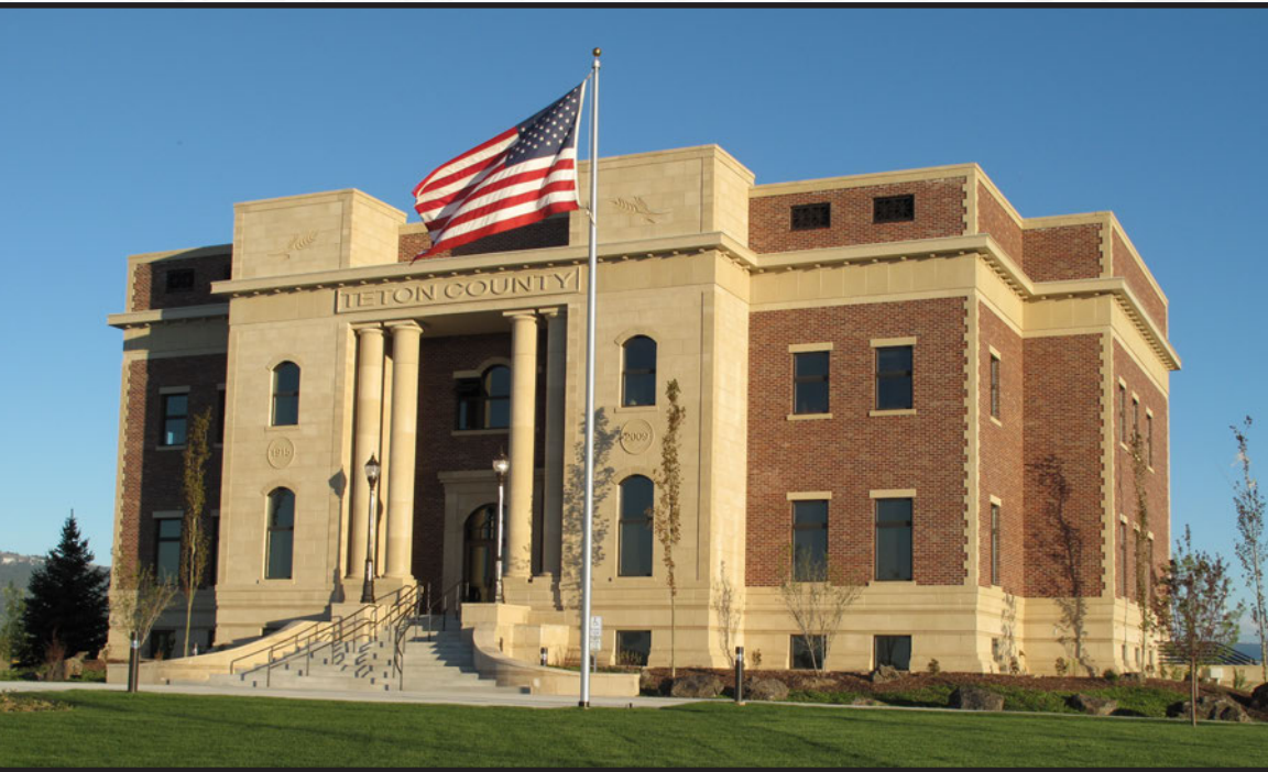
Teton County Courthouse