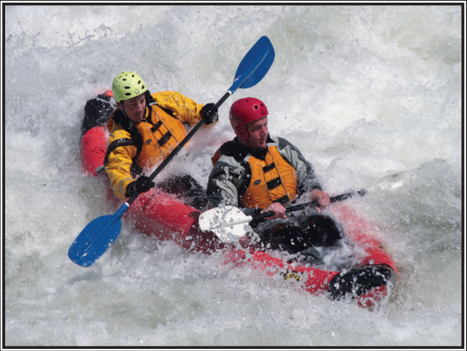
Kayaking the Lochsa River