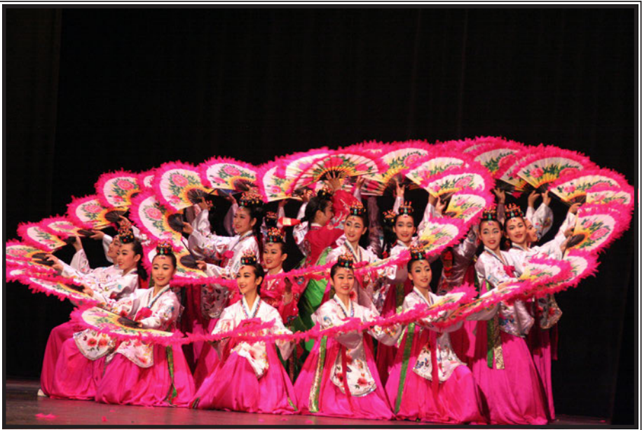
Idaho International Dance Festival