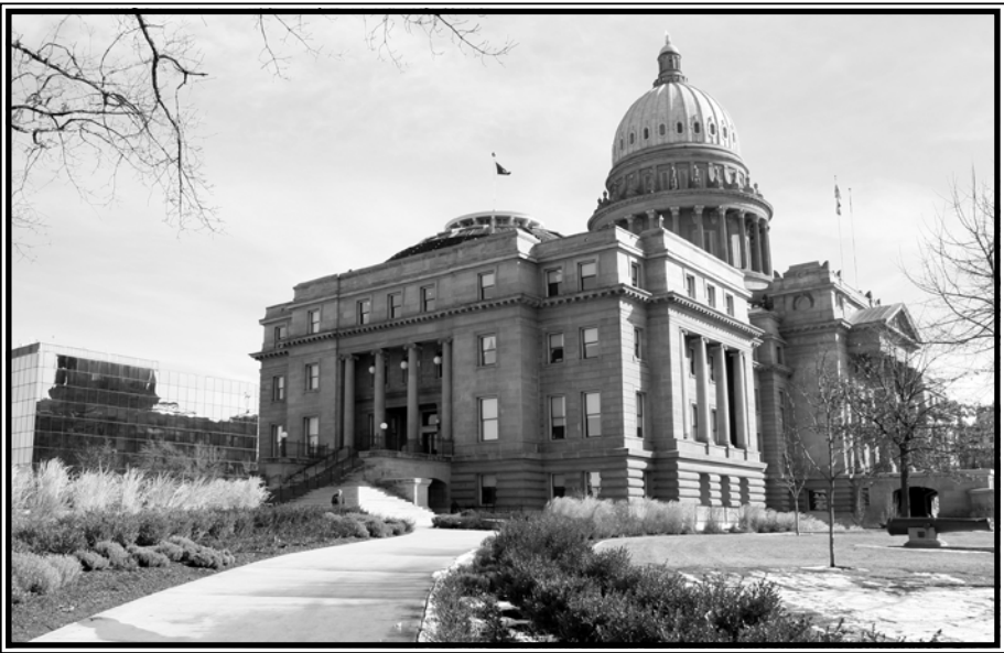
Capitol West Side

Tourtellotte was inspired to create a building that emphasized natural light and used it as a decorative element. He used light shafts, skylights, and reflective marble surfaces to capture natural sunlight and direct it to the interior space. For Tourtellotte, light was a metaphor for an enlightened and moral state government. The original design created an architecturally pleasing building that incorporated the materials and technologies of the day into a working Capitol.