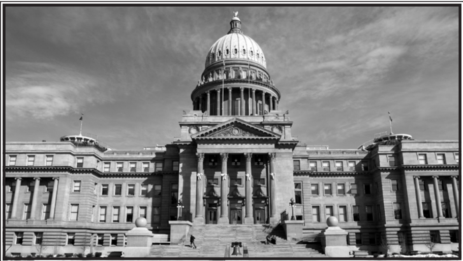
Idaho State Capitol

The underground expansion provided approximately 25,000 square feet on each side of the Capitol, larger legislative hearing rooms and opportunities to move various functions out of the Capitol Building, such as large mechanical spaces, data centers, kitchens, and dining facilities.