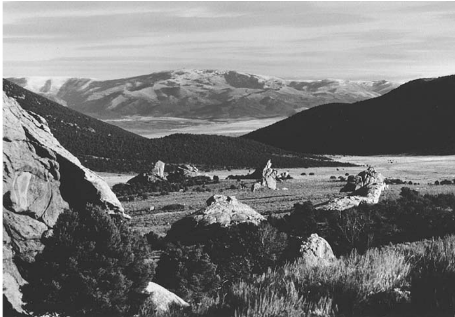
City of Rocks