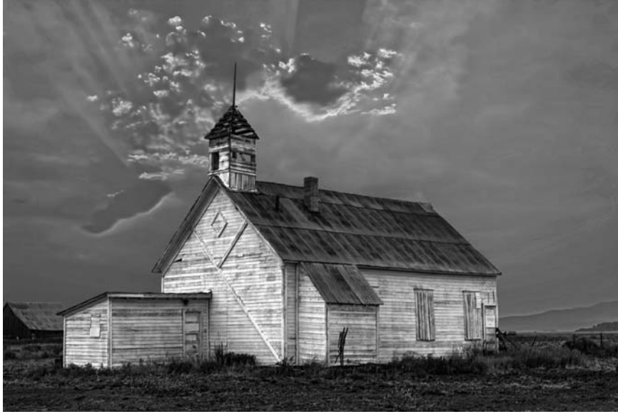
Old Church at Fairfield (top) Anderson Ranch Reservoir in Winter (bottom)