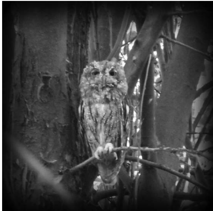
Western Screech Owl