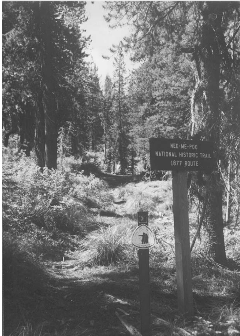
Nee-Mee-Po National Historic Trail in North Central Idaho

The Nez Perce (Nimípuu or Nee-Me-Poo) National Historic Trail stretches from Wallowa Lake, Oregon, to the Bear Paw Battlefield near Chinook, Montana. It was added to the National Trails System by Congress in 1986.