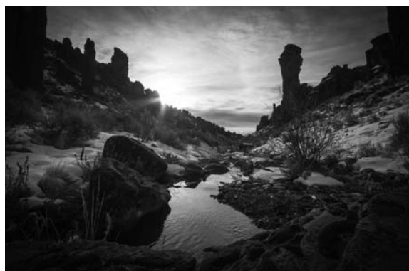
City of Rocks