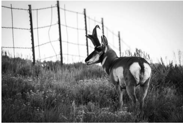
Big Horn Sheep (top) and Pronghorn (bottom)