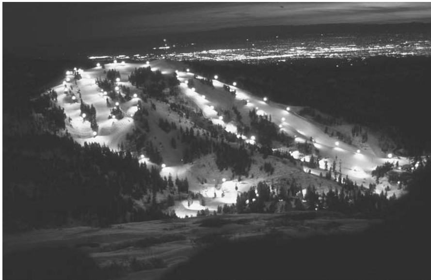
Aerial view of Bogus Basin Resort lit for night skiing.

Bogus Basin Mountain Recreation Area has been the Treasure Valley's winter playground for 66 years. Located 16 miles north of Boise, Mother Nature blankets the slopes of Bogus Basin Mountain Recreation Area with 150"-200" of natural snow. The result is 2,600 acres of