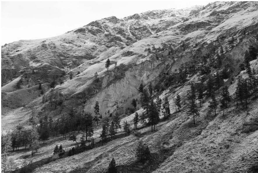
Hells Canyon