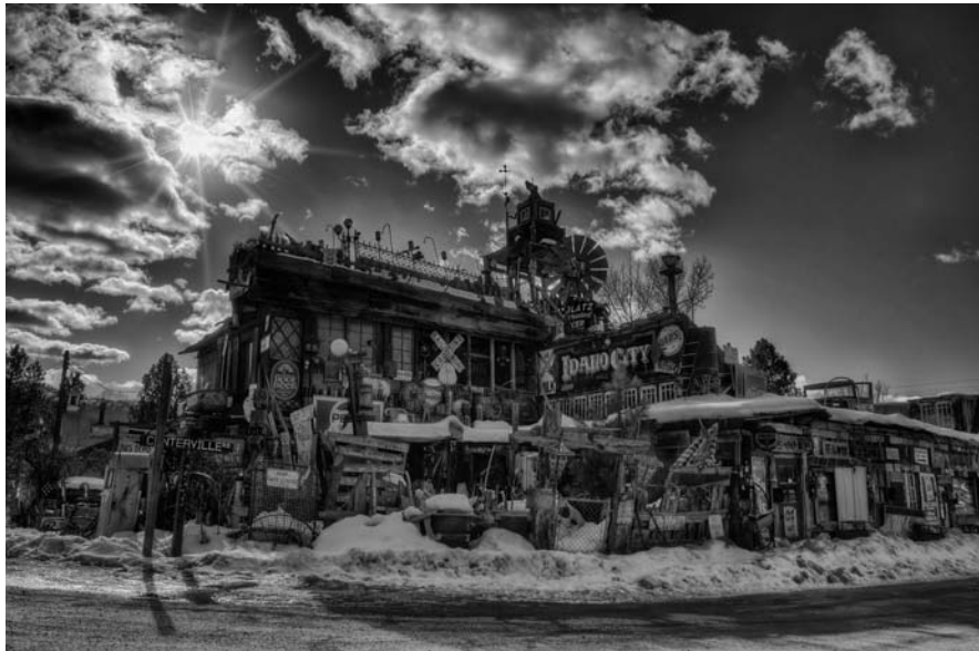
In Idaho City