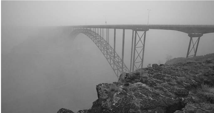
The Perrine Bridge during a snow storm in April of 2013