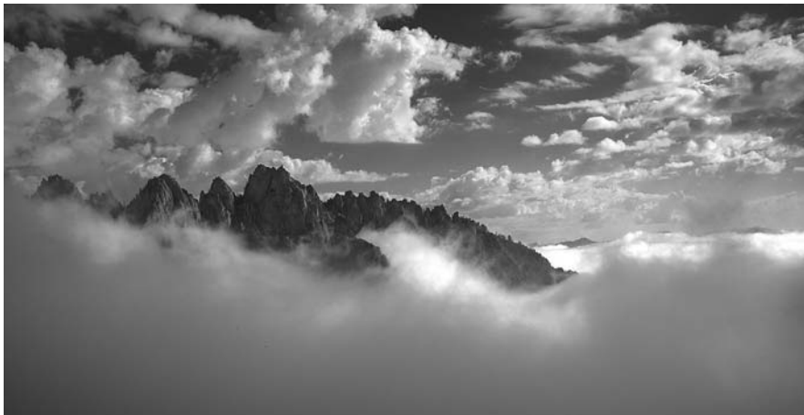
Serrate ridge poking through the clouds above Stanley Idaho in the Sawtooth Wilderness