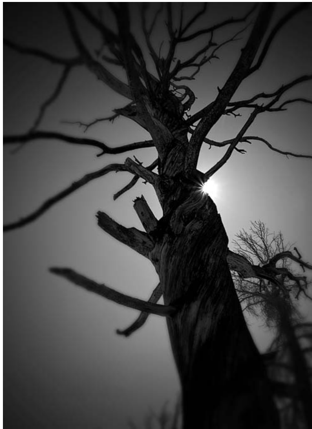
Tree at Big Lost Lake