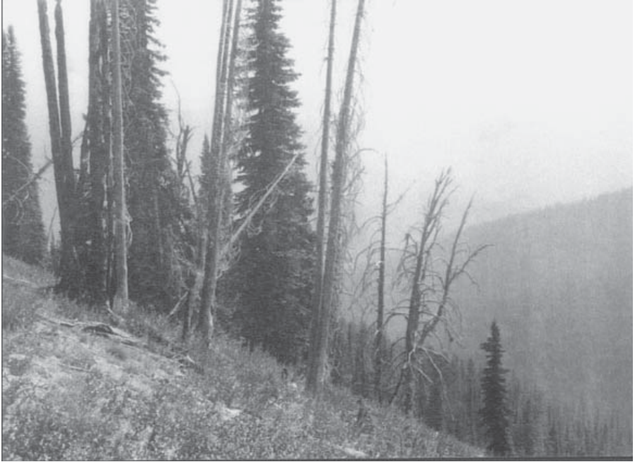
Along Lolo Trail